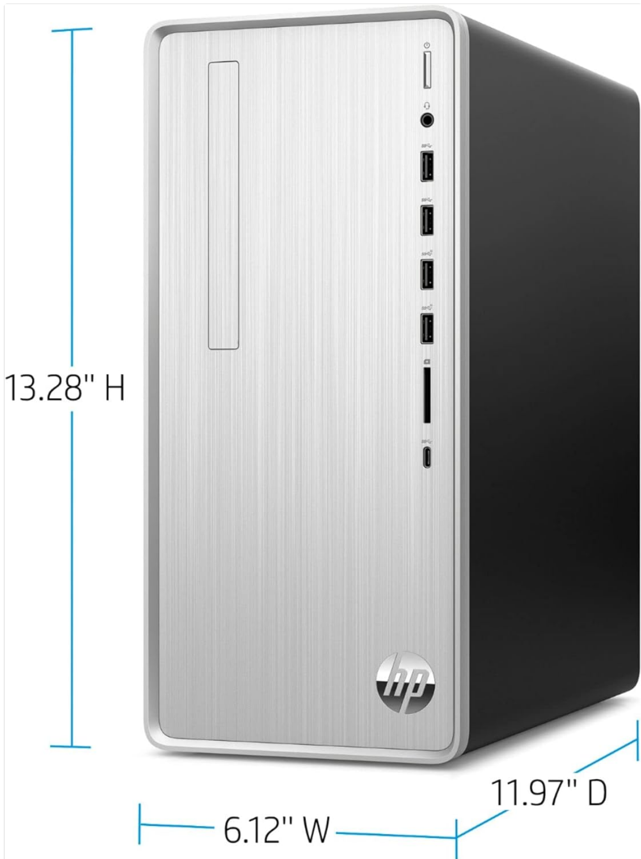
Image 6.1: Diagram illustrating the physical dimensions of the HP Pavilion TP01 Desktop Computer: 13.28 inches (H), 6.12 inches (W), and 11.97 inches (D).