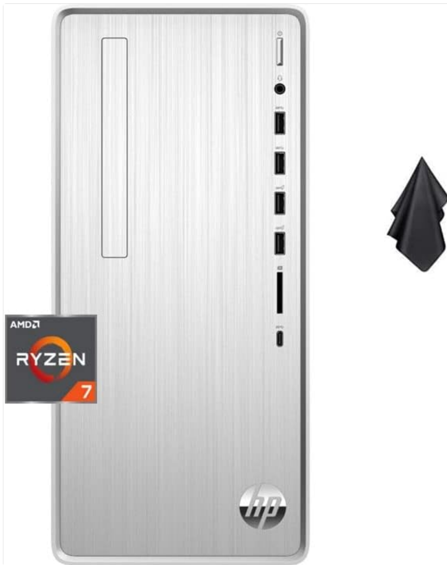
Image 1.1: Front view of the HP Pavilion TP01 Desktop Computer. The computer tower is silver with a black side panel, featuring the HP logo and an AMD Ryzen 7 sticker.