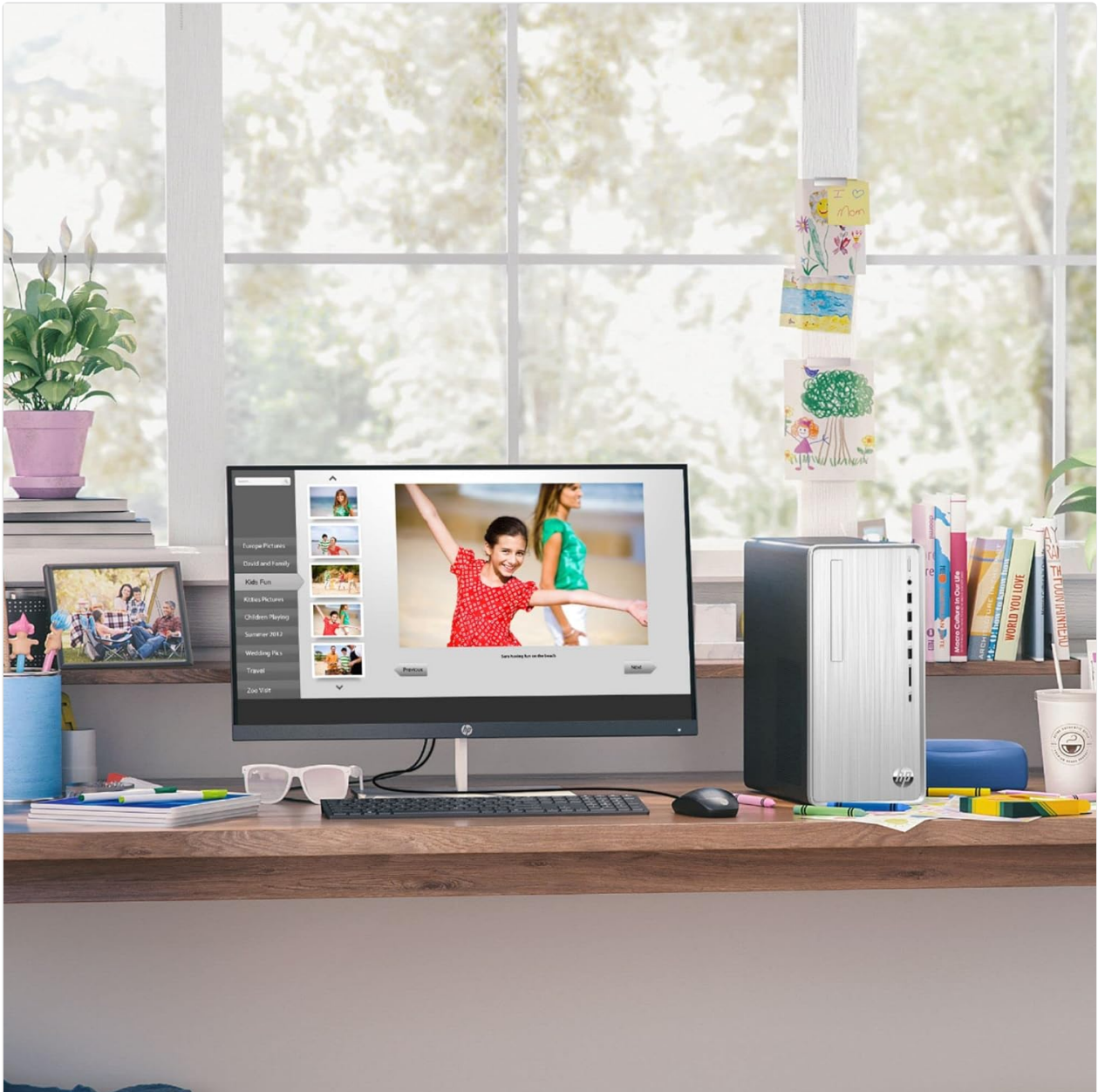
Image 2.1: An example setup of the HP Pavilion TP01 Desktop Computer on a desk, connected to a monitor, keyboard, and mouse, illustrating a typical workstation configuration.