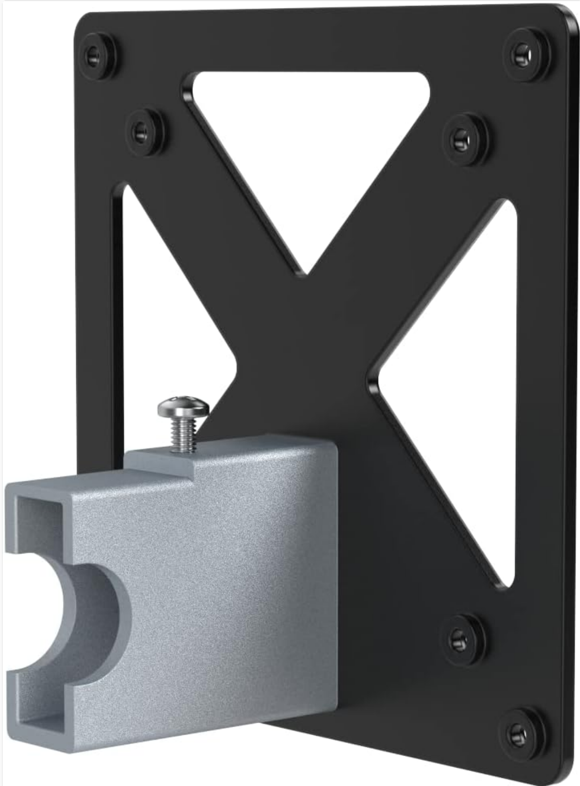
Figure 3.1: HumanCentric VESA Mount Adapter.