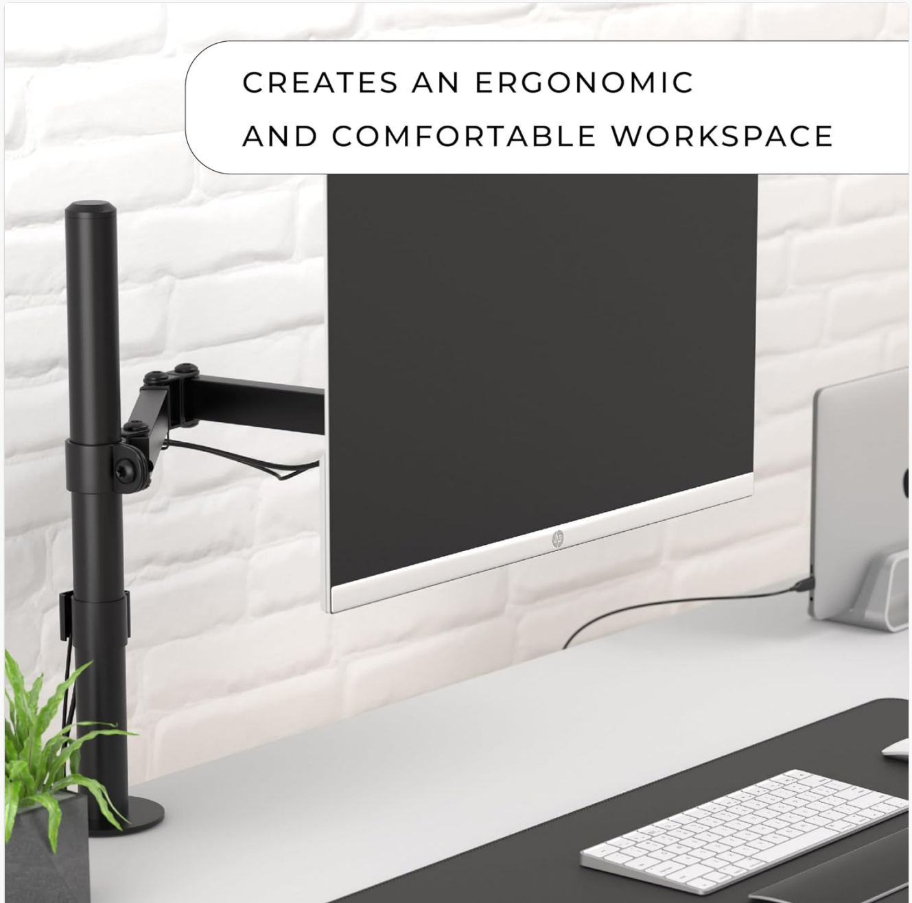
Figure 5.1: Monitor mounted on a VESA arm, contributing to an organized workspace.

Once the VESA mount adapter is securely installed and your monitor is attached to a VESA-compatible arm or stand, you can adjust your monitor according to the instructions provided with your specific VESA mounting system. The adapter itself is fixed and does not offer additional movement beyond what the VESA mount provides.