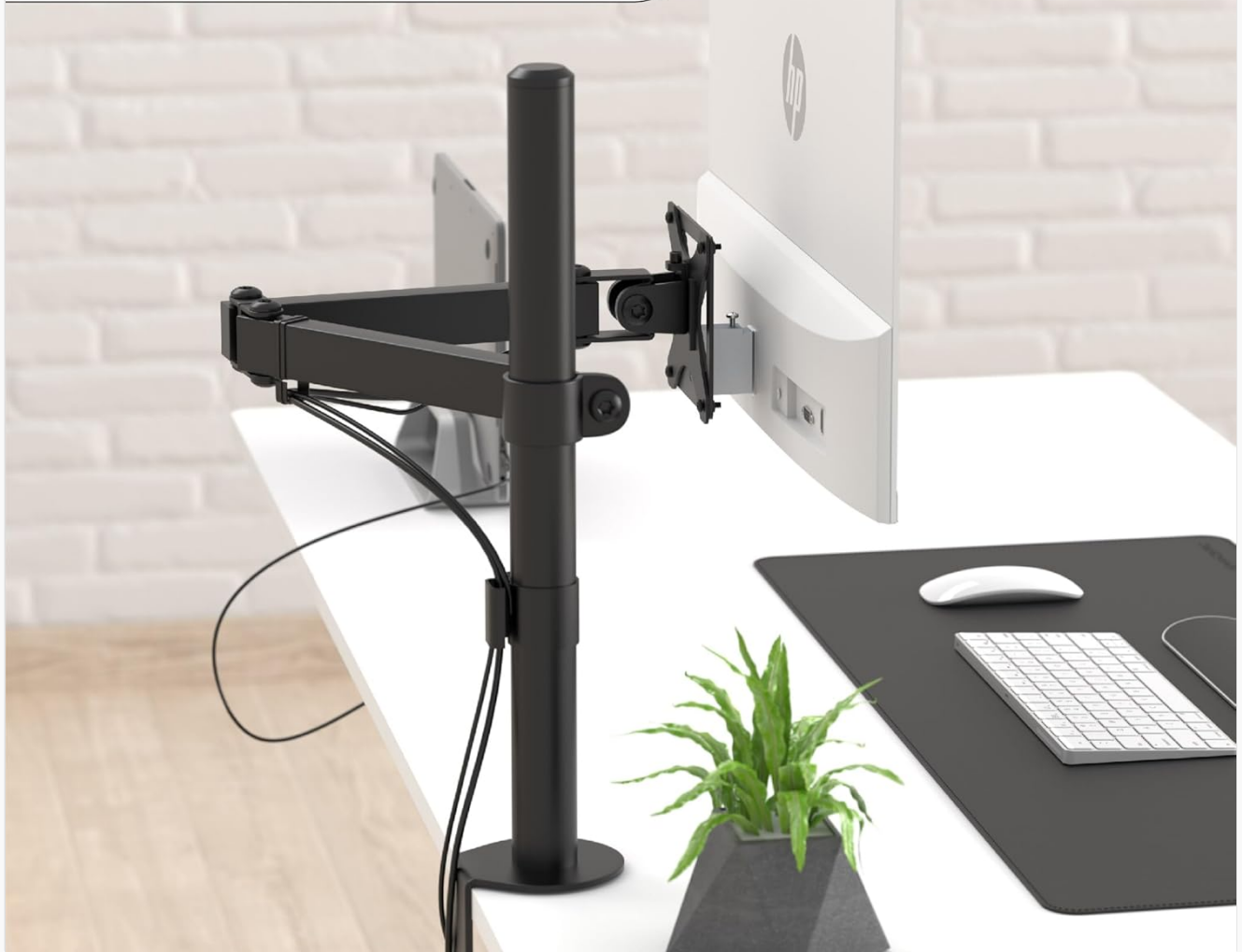
Figure 4.1: Installation diagram for the VESA adapter.