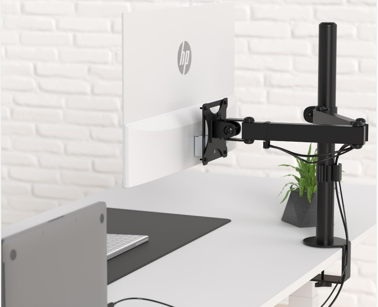
Figure 5.2: Ergonomic setup with the monitor mounted on a VESA arm.