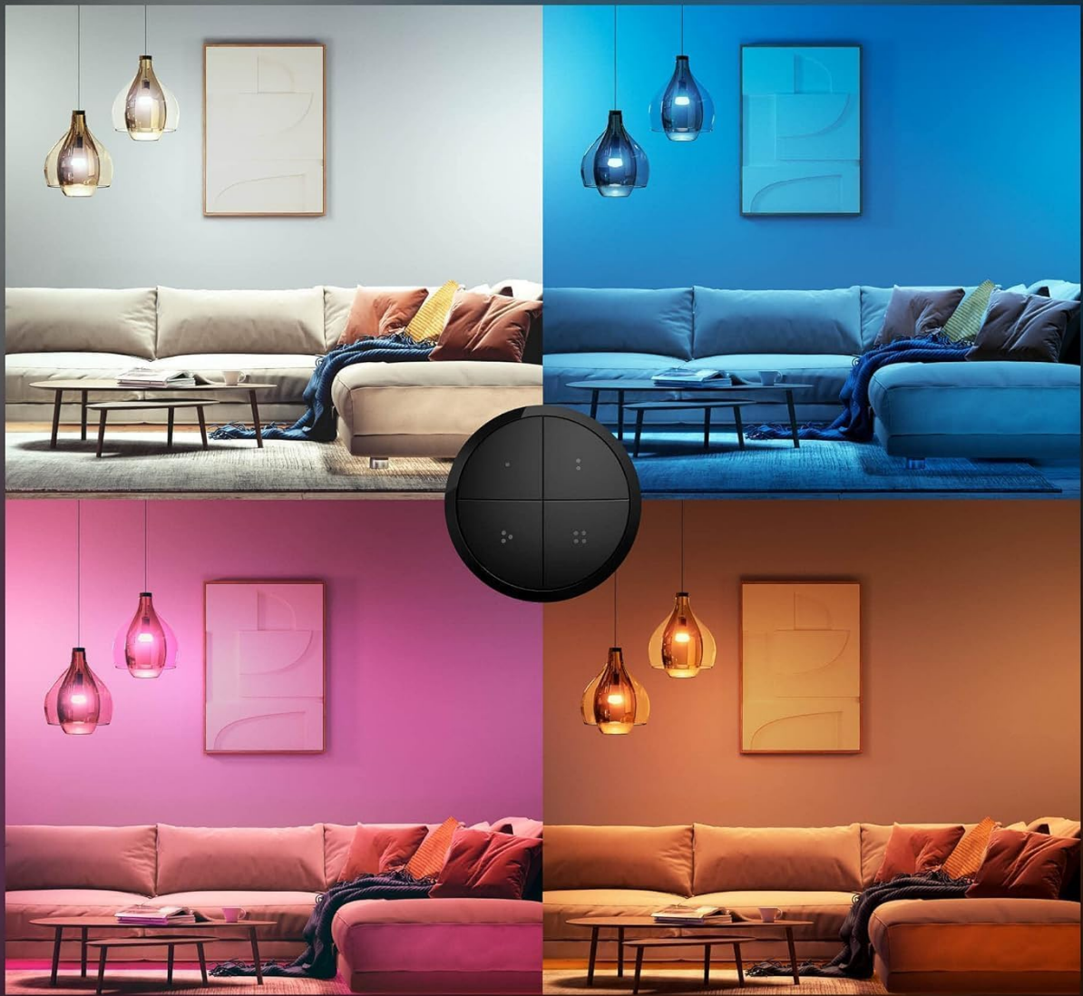
Image: An illustration demonstrating the Philips Hue Wall Tap Dial Switch's ability to control lighting in multiple rooms or zones, each with distinct light settings.