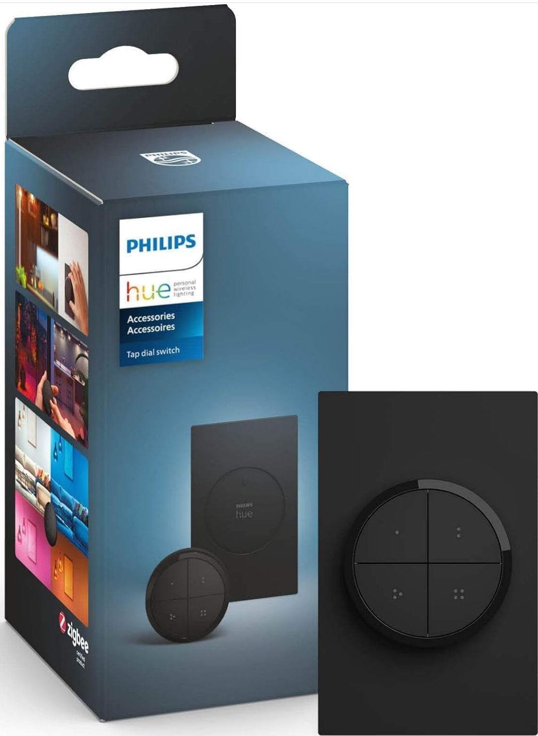
Image: Philips Hue Wall Tap Dial Switch, showing the product in its packaging and the switch itself.