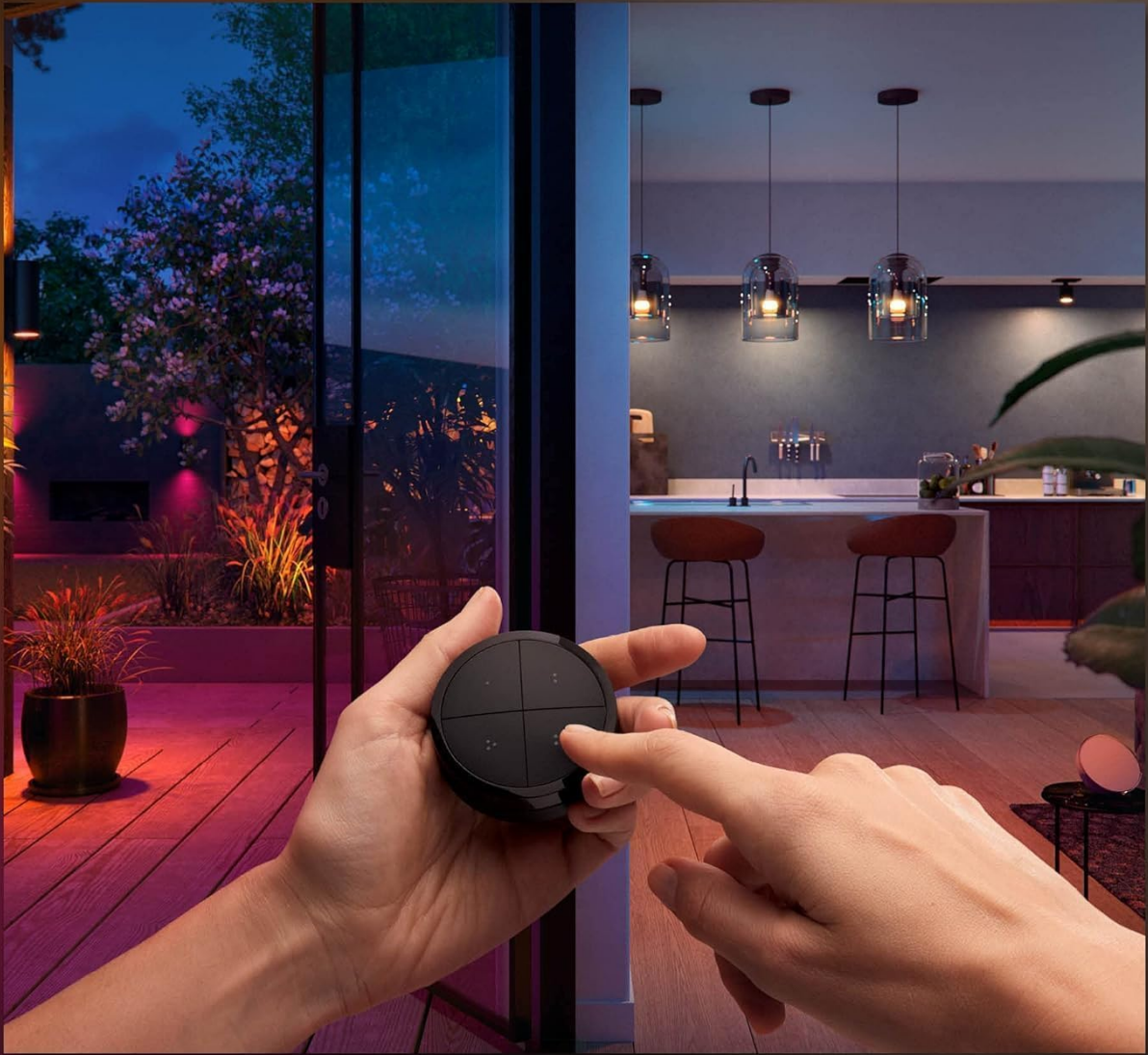
Image: A user interacting with the Tap Dial Switch to instantly set and adjust light scenes in a room.