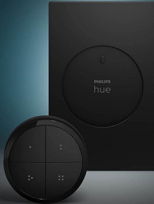
Image: The Philips Hue Wall Tap Dial Switch shown both mounted on a wall plate and detached for use as a portable remote.