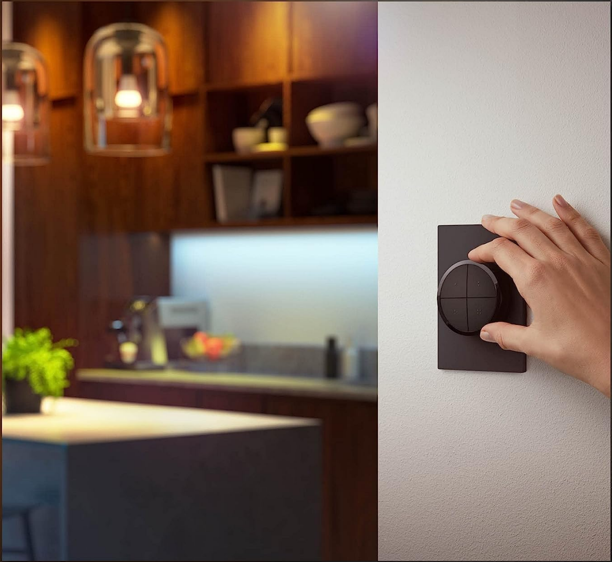
Image: A hand rotating the dial of the Philips Hue Wall Tap Dial Switch to adjust the brightness of lights in a kitchen setting.