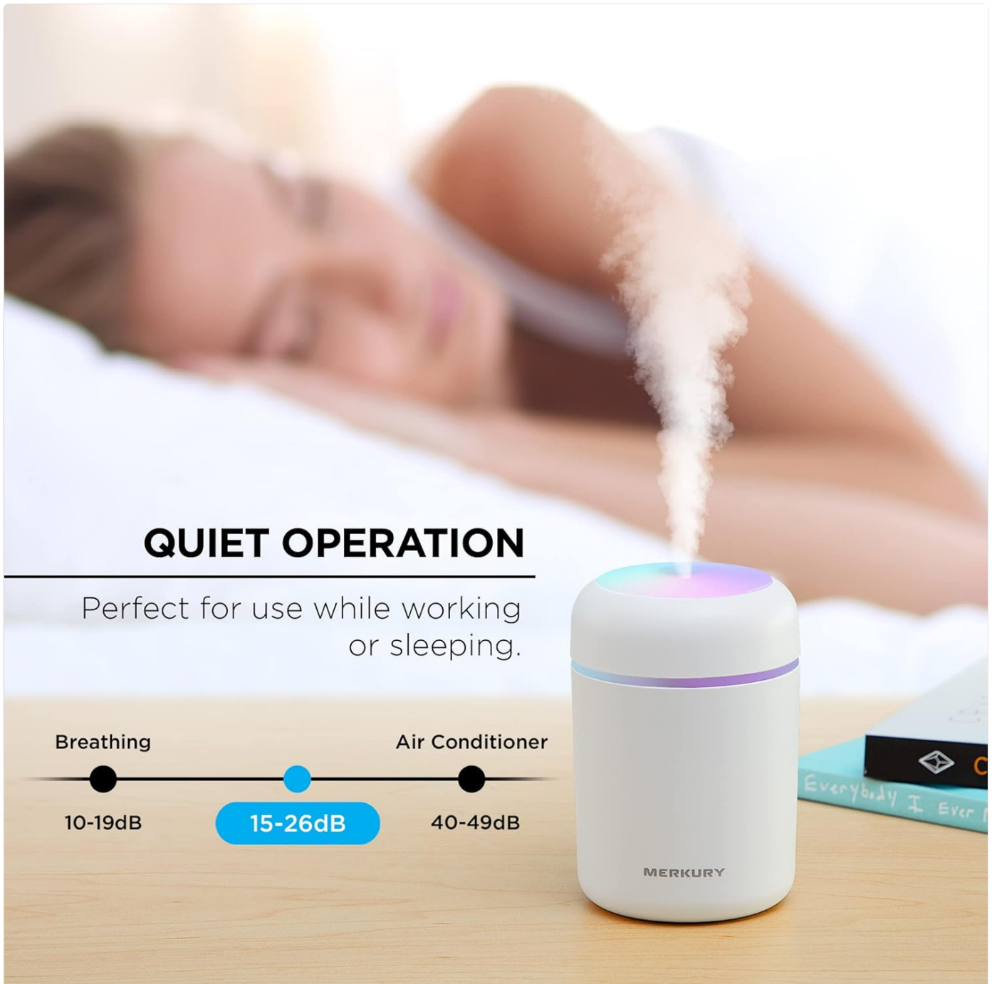
Image: The humidifier operating quietly on a bedside table next to a sleeping person, with a graphic indicating its low noise level (15-26dB) compared to breathing and air conditioning.