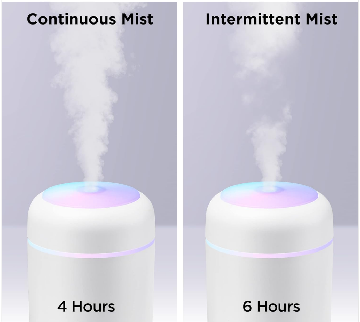
Image: A visual comparison demonstrating the continuous mist mode, which runs for 4 hours, and the intermittent mist mode, which runs for 6 hours, both emitting mist from the humidifier.