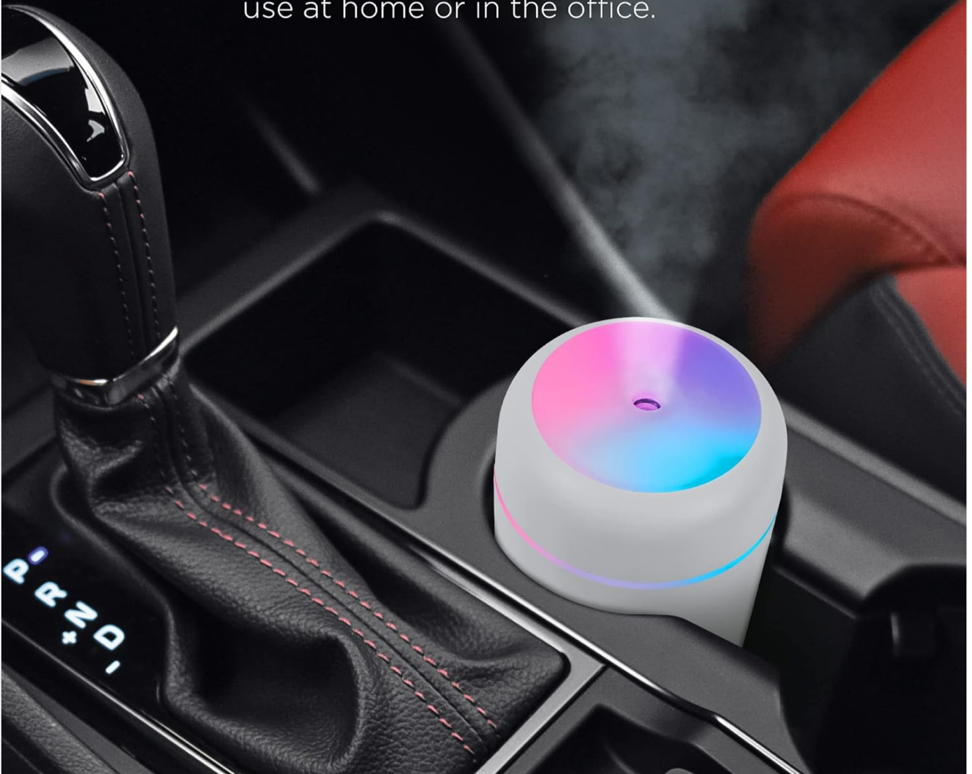
Image: The humidifier positioned in a car's cup holder, illustrating its portable design and how it can purify air in various locations, including inside a vehicle.

Fits in car cup holders and is great for use at home or in the office.