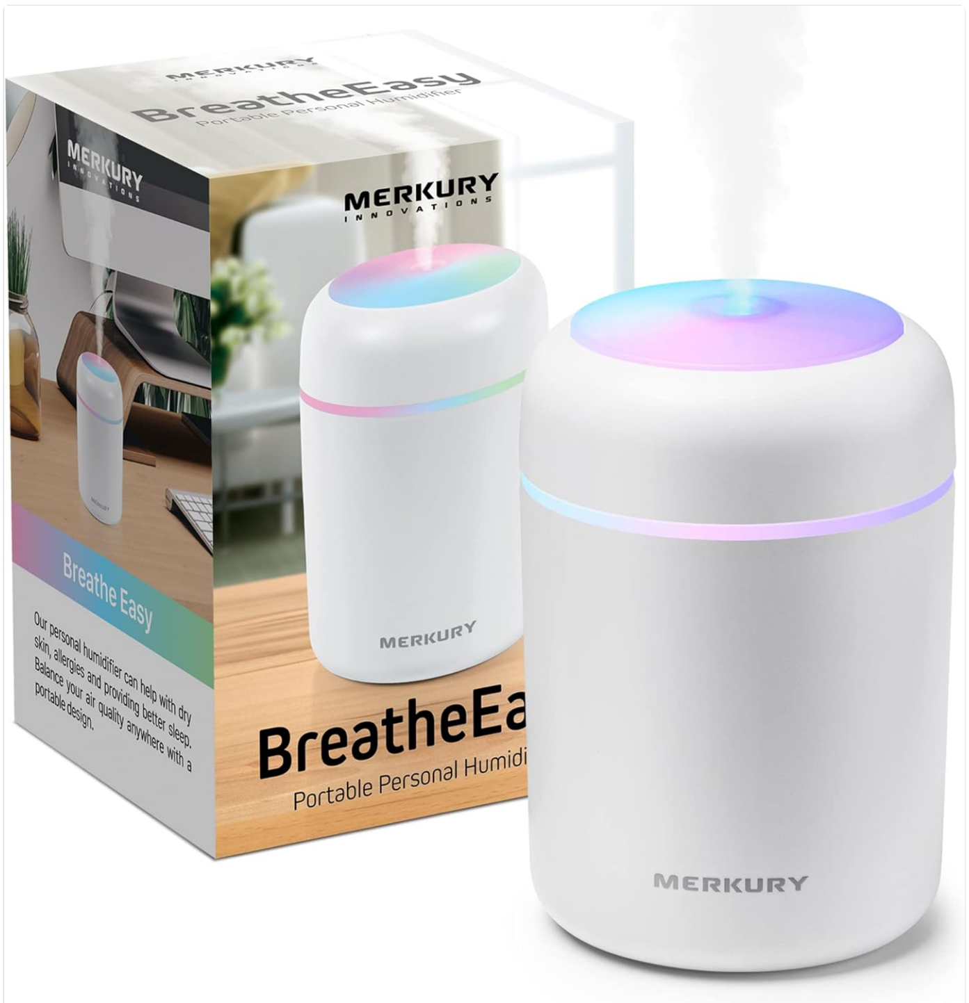
Image: The Merkury Innovations Breathe Easy Portable Personal Humidifier shown alongside its product packaging, highlighting its compact size and design.