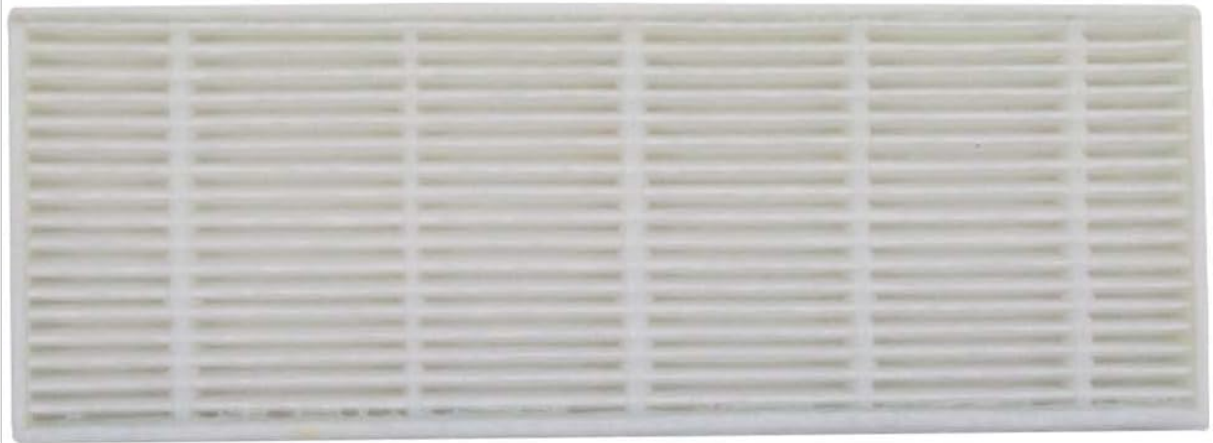
Image: Replacement HEPA filters.