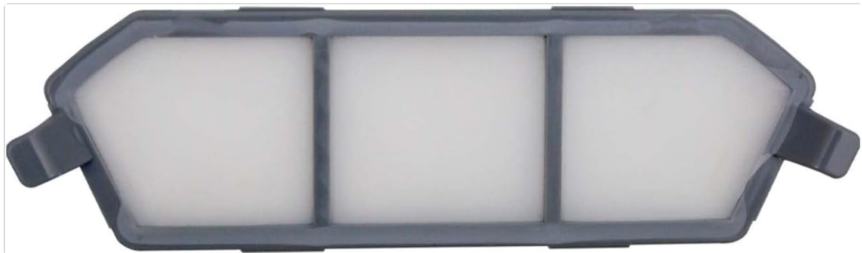
Image: Replacement primary filter.