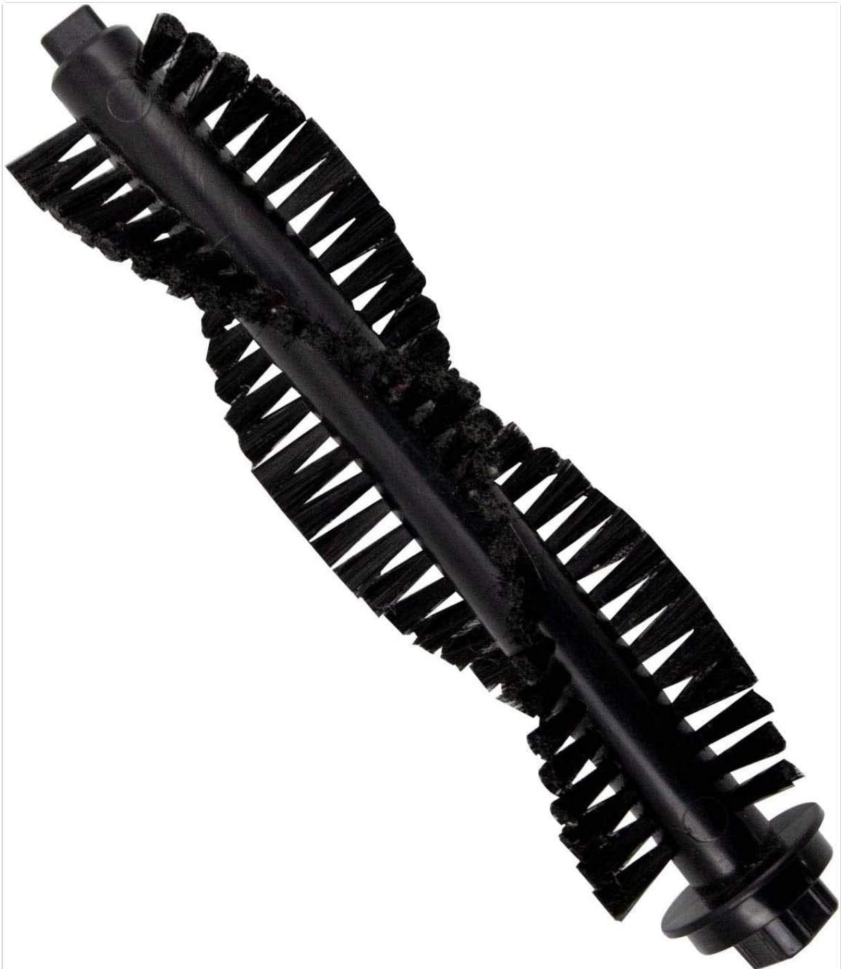
Image: Detailed view of the replacement roller brush.