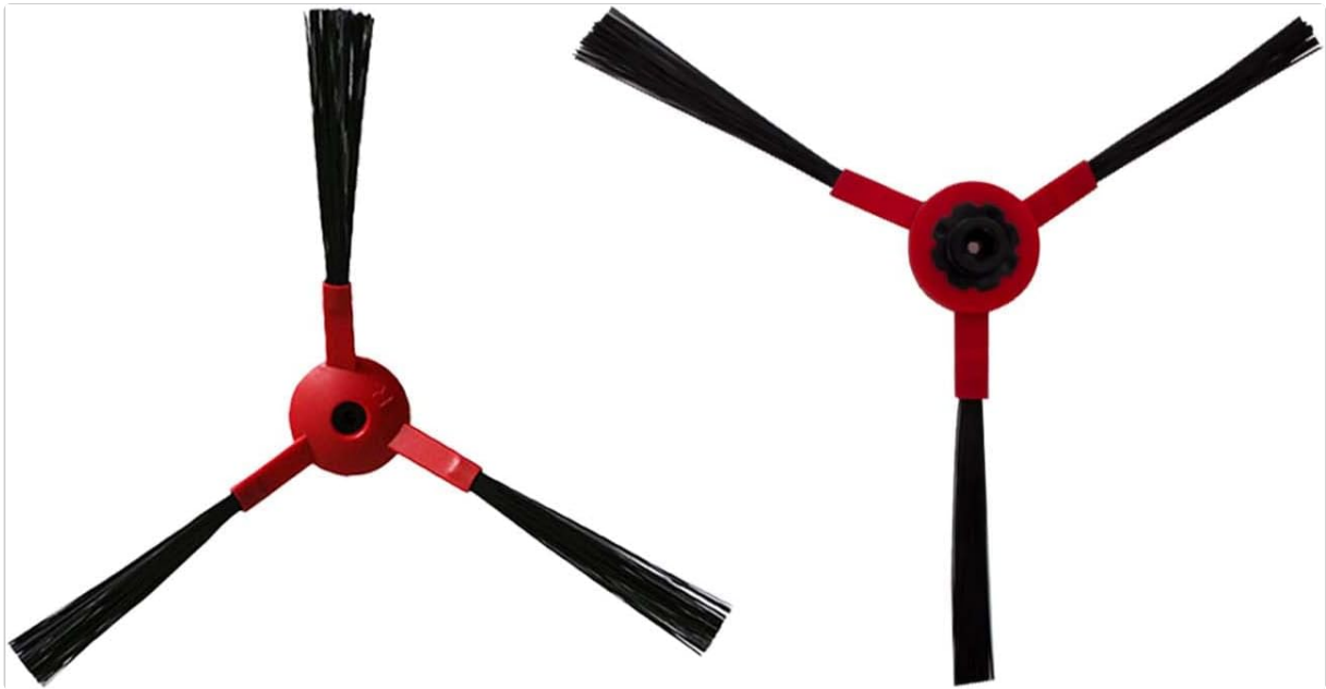
Image: Replacement side brushes.