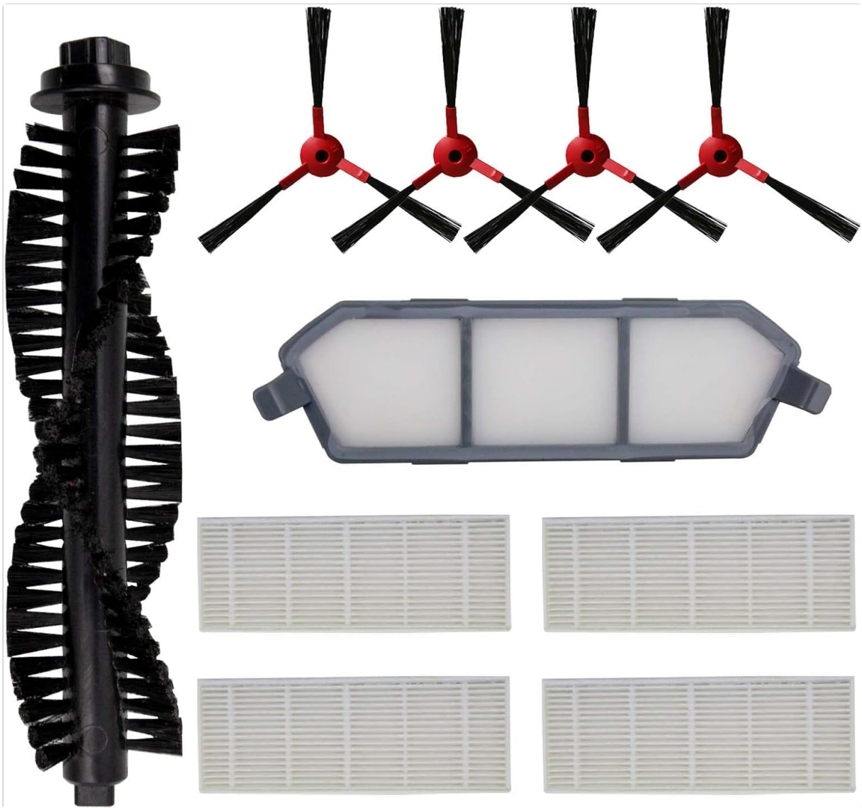
Image: Complete HUIZHEN Replacement Parts Kit for AIRROBO P10.