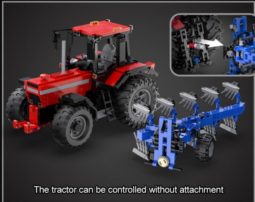
Image: The CaDA C61052W Farm Tractor shown with its plough attachment separated, demonstrating its modular design.