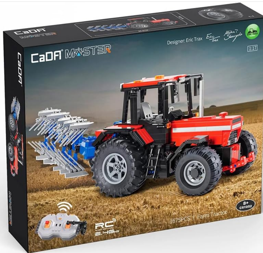
Image: The CaDA C61052W Farm Tractor demonstrating the 180-degree rotation capability of the plough attachment and the automatic wheel adjustment.