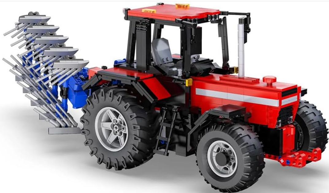
Image: A rear-side view of the fully assembled CaDA C61052W Farm Tractor with the plough attachment.