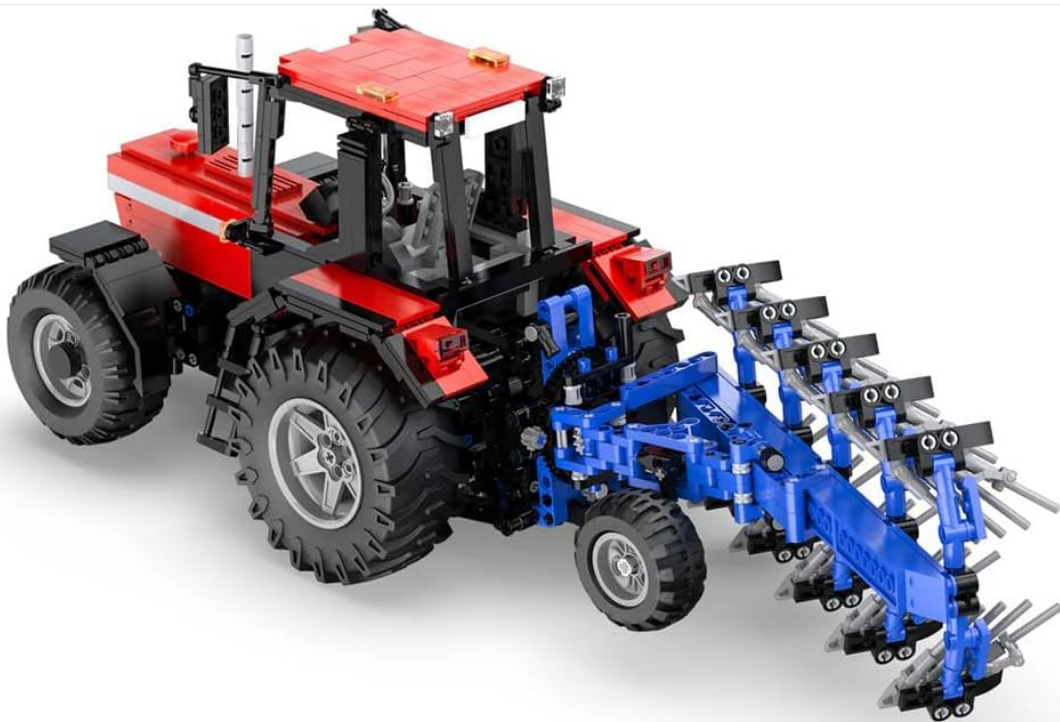
Image: A front-side view of the fully assembled CaDA C61052W Farm Tractor with the plough attachment.