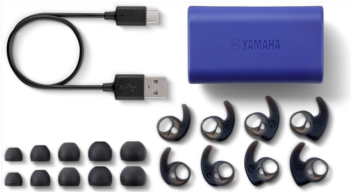
All components included with the Yamaha TW-ES5A True Wireless Sport Earbuds.