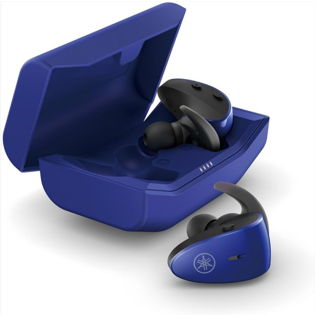
The TW-ES5A earbuds nestled in their protective charging case.

The protective charging case not only stores your earbuds but also recharges them, providing extended battery life. LED indicators on the case show the charging status.