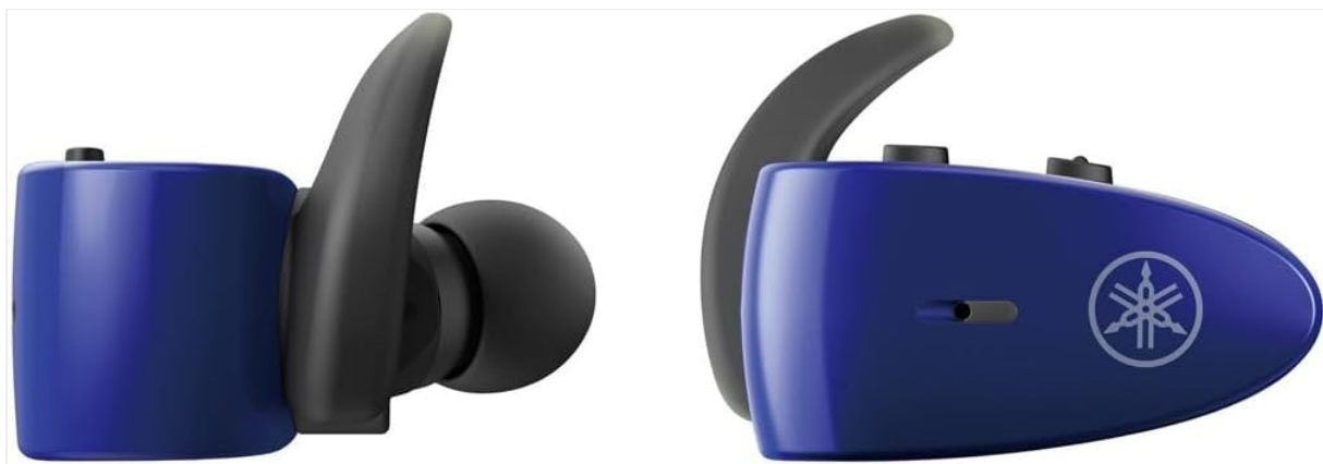
Side view of the TW-ES5A earbuds, highlighting the ergonomic shape and stabilizer fin.

Each earbud features a compact design with integrated controls and a stabilizer ear fin for a secure fit during physical activity. The earbuds are lightweight, weighing approximately 0.28 ounces each.