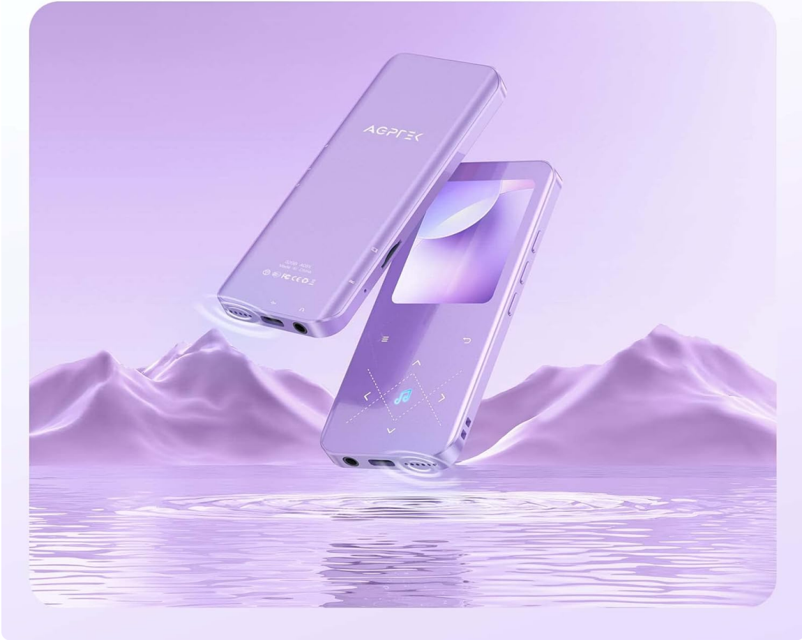
Image: Two AGPTEK A09X MP3 Players floating above water, emphasizing the 2.4-inch HD screen, built-in speaker, and one-click music playback feature.