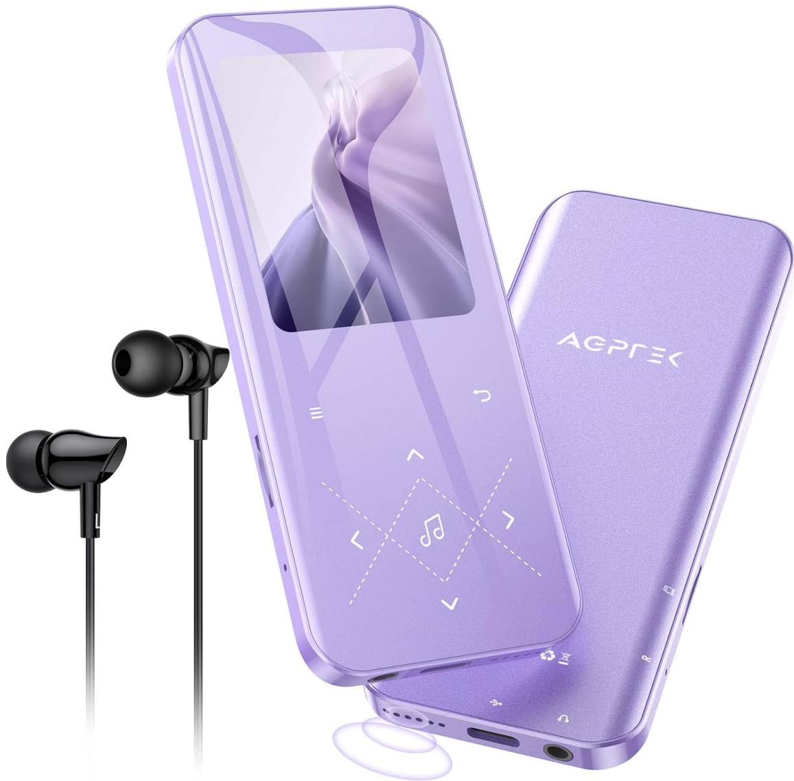
Image: The AGPTEK A09X MP3 Player in purple, shown with its included black wired earphones. The device features a 2.4-inch screen and a compact, portable design.

The AGPTEK A09X features a sleek design with a 2.4-inch TFT color screen and intuitive controls. It includes a built-in speaker for convenient listening without earphones.