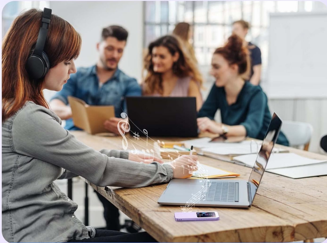
Image: A person wearing headphones and working on a laptop, with the AGPTEK A09X MP3 Player visible on the desk, illustrating the HiFi Lossless Sound feature for focused listening.

Focus on Your Task Wonderful Music World