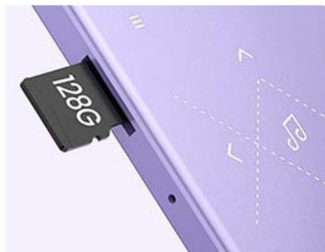
Image: A detailed view of the TF card slot on the AGPTEK A09X MP3 Player, illustrating where to insert the memory card for expanded storage.