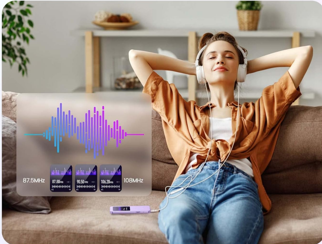
Image: A person relaxing on a couch, listening to the AGPTEK A09X MP3 Player with wired headphones, demonstrating the FM Auto Search feature (87.5-108MHz) and the need for wired headphones as an antenna.

Wired headphone is needed as a radio antenna.