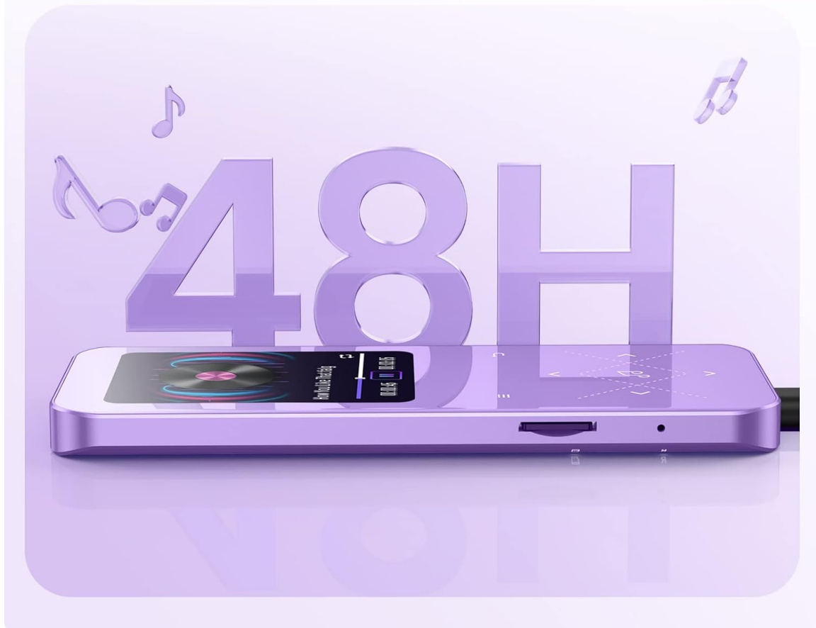
Image: The AGPTEK A09X MP3 Player connected to a charging cable, illustrating its 2.5-hour charging time, 48 hours of music playback with earphones, and 6.8 hours via Bluetooth.