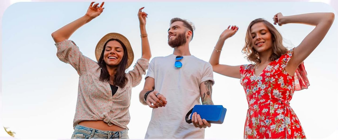
Image: A collage showing three different scenarios of people using the AGPTEK A09X MP3 Player with Bluetooth devices: a person running with wireless earbuds, a person on public transport with over-ear headphones, and a group of friends enjoying music from a Bluetooth speaker, highlighting the Advanced Bluetooth V5.3 Technology.