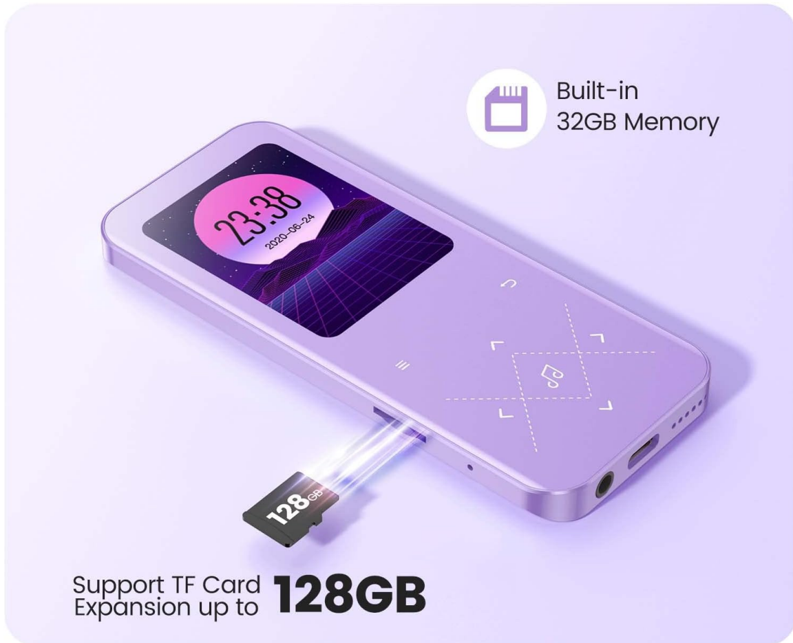
Image: A close-up of the AGPTEK A09X MP3 Player showing a 128GB TF card being inserted into its slot, highlighting the device's 32GB built-in memory and support for up to 128GB expansion.