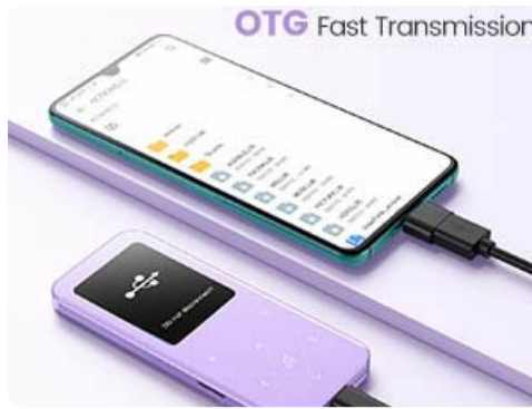
Image: The AGPTEK A09X MP3 Player connected via USB to a smartphone, demonstrating OTG (On-The-Go) fast transmission for file transfer.