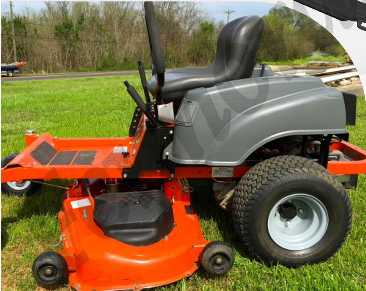
Figure 5: Baffle installed on a mower deck.

Note on Videos: No official seller videos specifically demonstrating the installation of this exact baffle were available. The provided videos were from influencers and did not directly pertain to this product's installation by the seller.