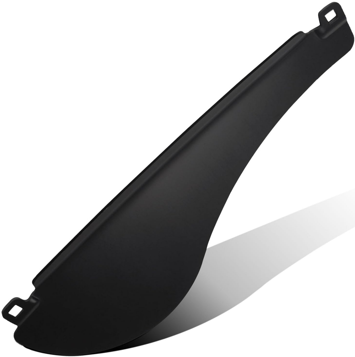
Figure 1: The Fennoral 532403149 Center Deck Baffle.