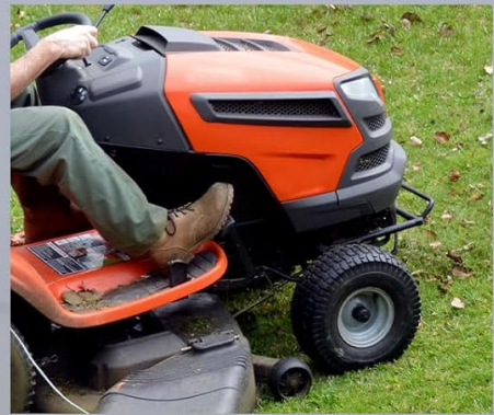
Figure 3: Compatibility with Ariens models.