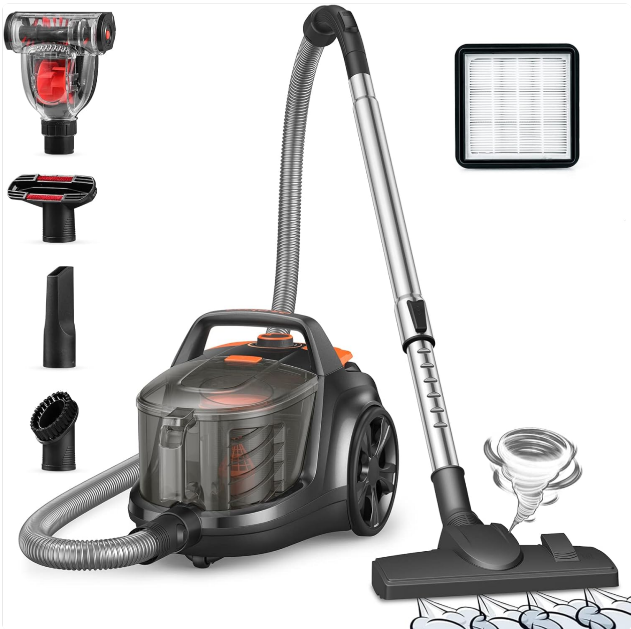
Image: Aspiron Canister Vacuum Cleaner with its main unit, telescopic wand, floorhead, and various attachments including a crevice tool, small dust brush, pet powermate, and upholstery brush, along with a HEPA filter.