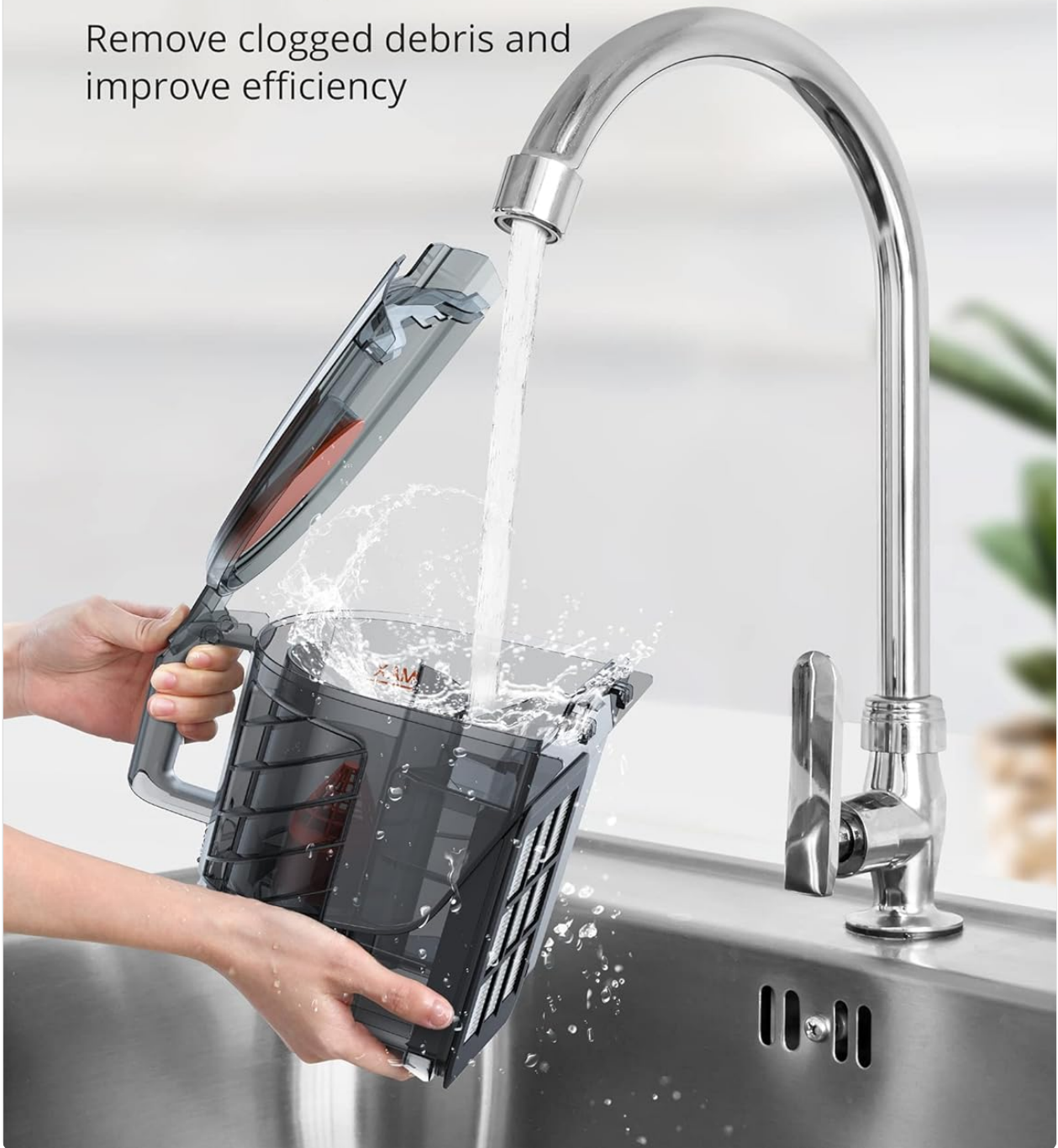
Image: A hand washing the dust cup and HEPA filter under running water, demonstrating their washable design.

Remove clogged debris and improve efficiency