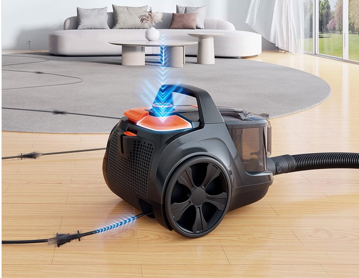
Image: The Aspire vacuum cleaner on a wooden floor with its power cord extended, illustrating the automatic cord rewind feature.