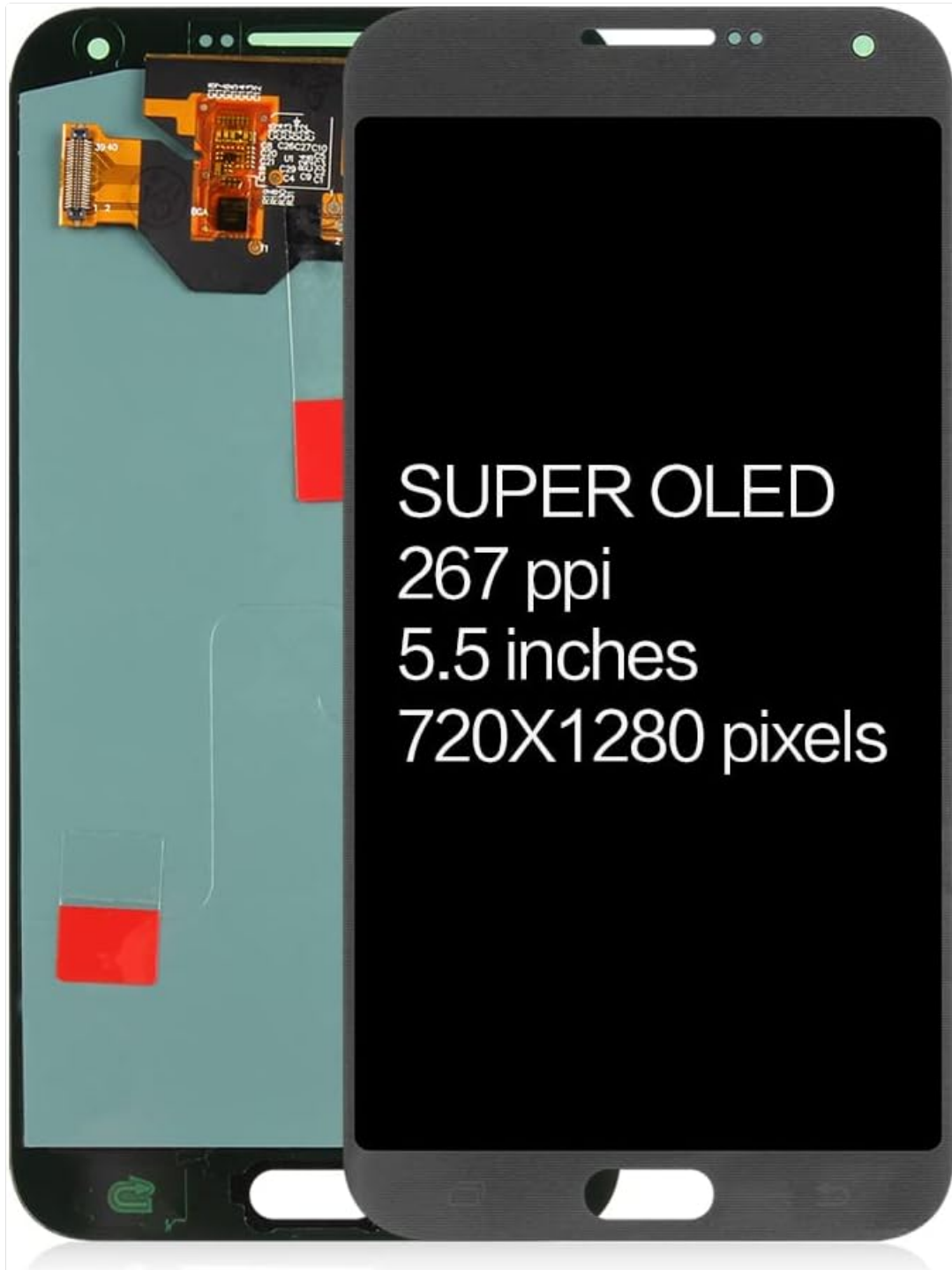
Image 6.1: The A-MIND replacement screen displaying its key specifications, which can be used to verify display functionality during testing.