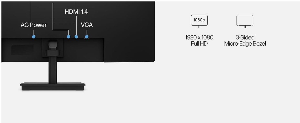
Image: Rear view of the HP 27h monitor, pointing out the joypad OSD button and showing the HP Display Center interface for settings adjustment.

Navigate the On-Screen Display (OSD) menu using the intuitive joypad control, usually found on the rear or bottom of the monitor. This allows you to customize various settings.