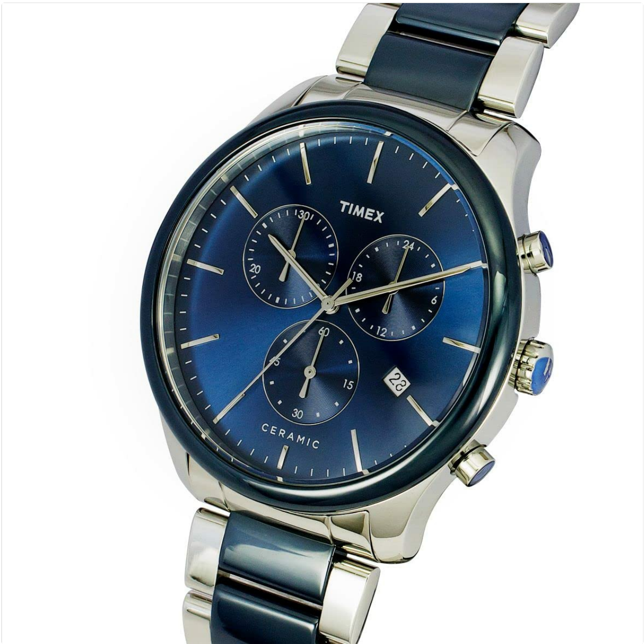
Front view of the TIMEX Analog Watch TWEG21701, showcasing the blue dial and stainless steel bracelet.