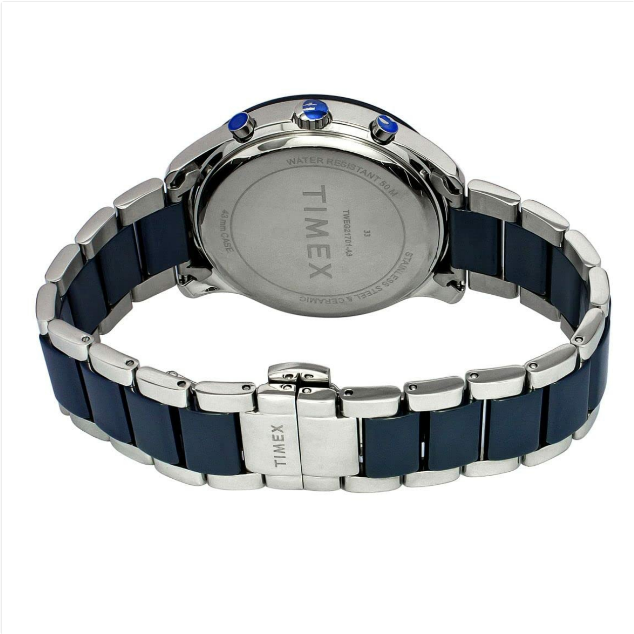
Rear view of the watch, displaying the model number and water resistance rating on the case back.