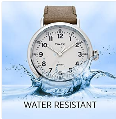
Image illustrating the watch's water resistance against splashes.