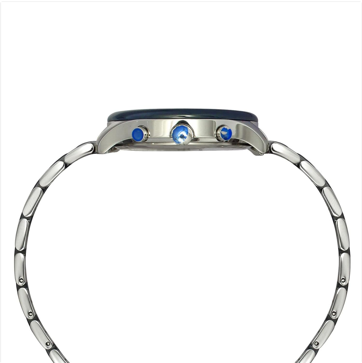
Side view of the watch, highlighting the crown used for time adjustment.