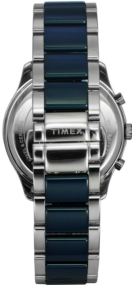
Close-up of the watch bracelet and clasp mechanism.