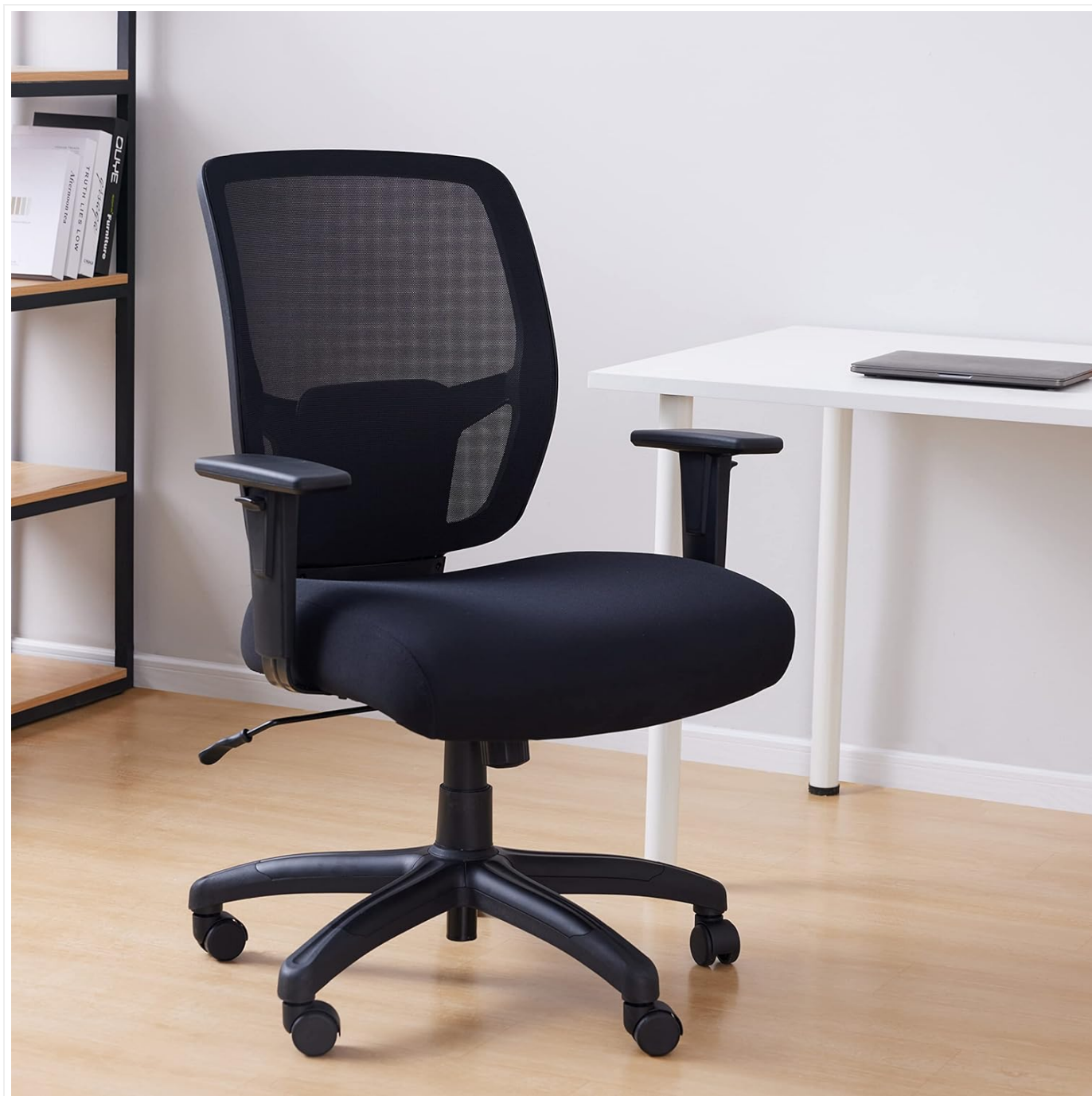
Figure 1: The Amazon Basics Mesh Desk Chair (Model FG-50854M) in a typical office environment. This chair features a black mesh backrest, a wide padded seat, and adjustable armrests, designed for comfort and support.

The Amazon Basics Mesh Desk Chair is designed for comfort and durability, featuring a breathable mesh backrest, a wide seat with thick, high-density foam cushioning, and integrated lumbar support. It is built to accommodate a high load capacity and offers various adjustments for personalized comfort.