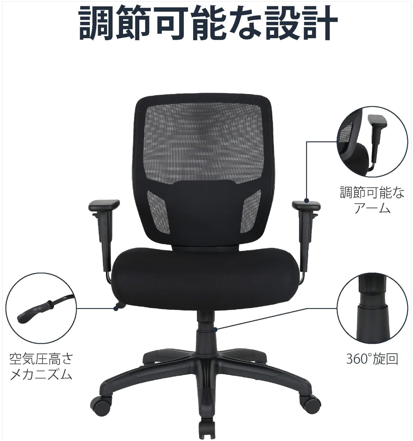
Figure 2: Chair Components and Adjustable Features. This image illustrates the main parts of the chair, including the mesh backrest, padded seat, armrests, pneumatic height adjustment lever, and 360-degree swivel base with caster wheels.

Before assembly, ensure all components are present and undamaged. Refer to the diagram below for identification of key parts and adjustable features.