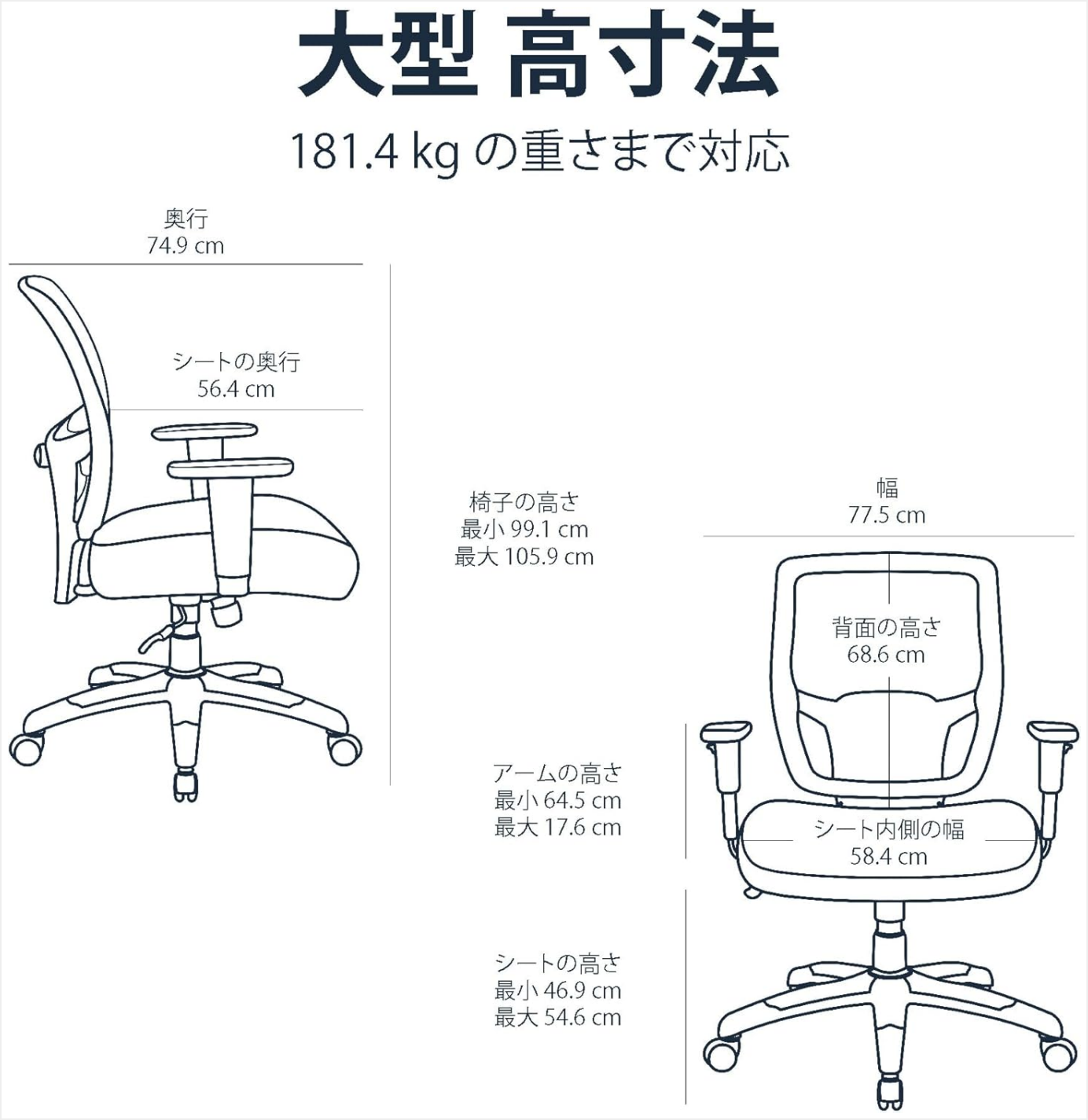
Figure 3: Chair Dimensions. This diagram provides detailed measurements for the chair's width, depth, and height, including seat dimensions, backrest height, and armrest height.