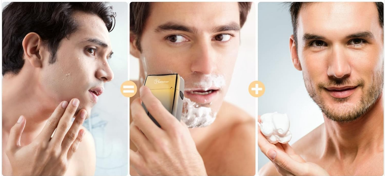
Image 3.1: Demonstrating the dual functionality for head and facial hair.