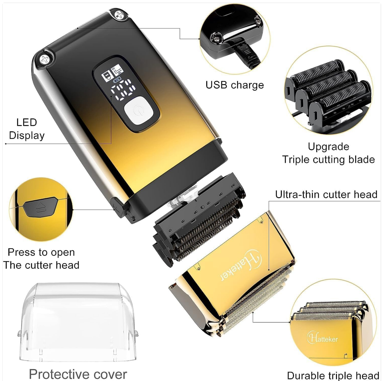
Image 3.2: Detailed view of the shaver's components and LED display.