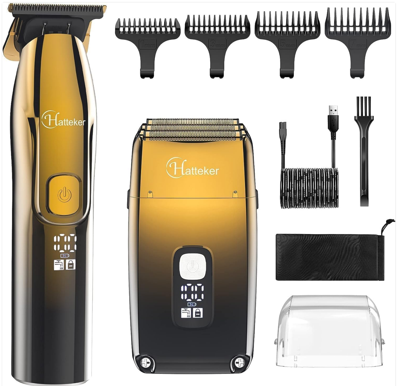
Image 2.1: All components included in the Hatteker Foil Shaver & Hair Trimmer Kit.