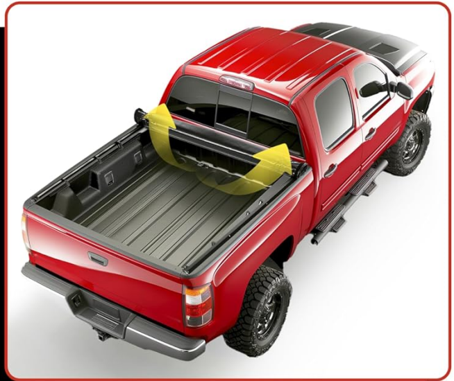
Image 5.1: A visual guide demonstrating the three steps for easy cargo access: open the back latch, roll up the cover, and place items in the truck bed.