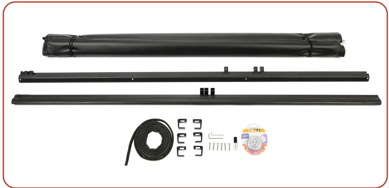
Image 3.1: A visual display of all items included in the package: the rolled-up tonneau cover, side rails, mounting clamps, weather seal, and small tools.