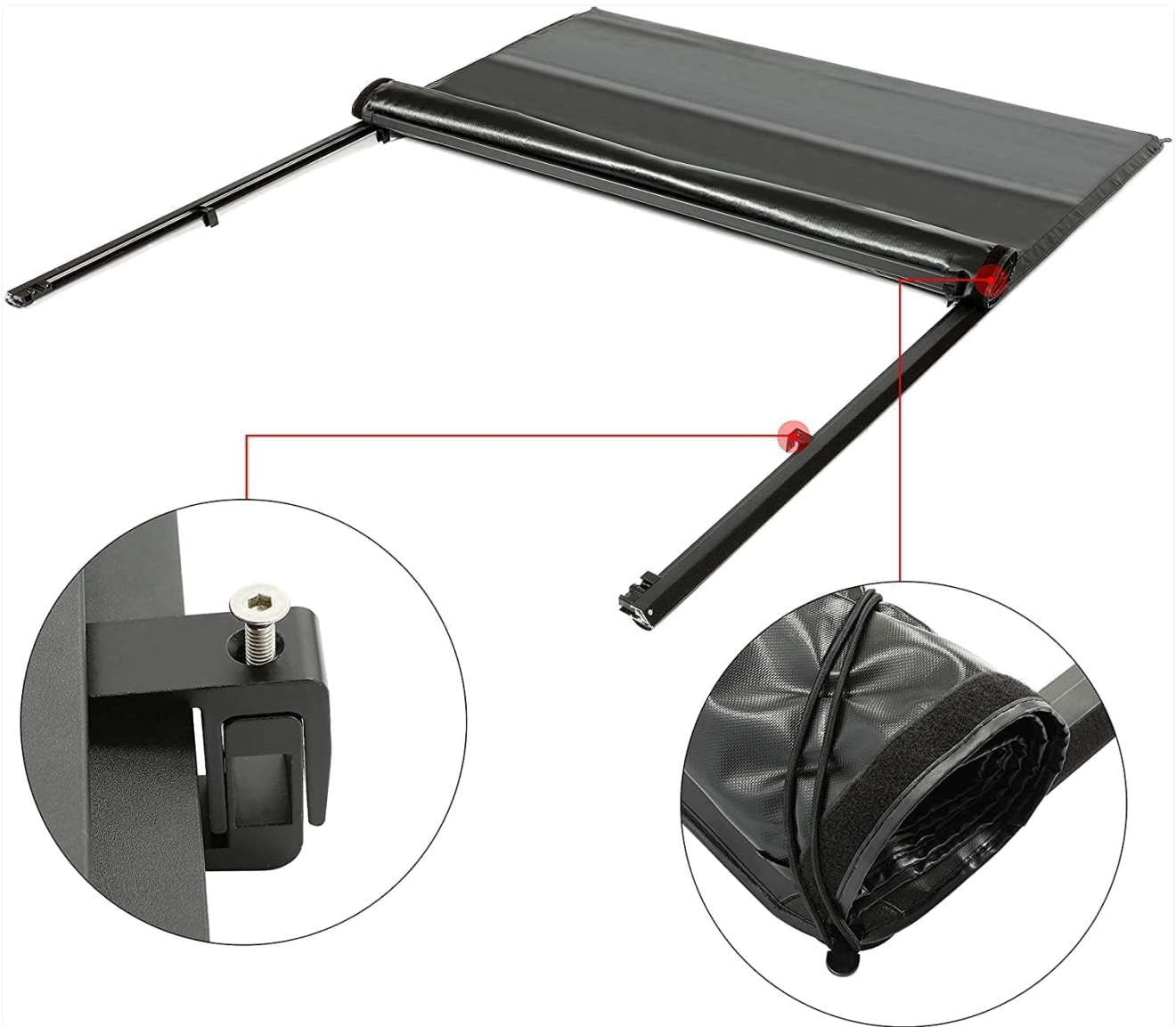
Image 4.1: A detailed view showing the clamp mechanism used to secure the tonneau cover's side rails to the truck bed, and the Velcro attachment system for the cover fabric.