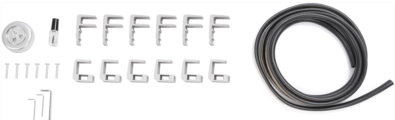
Image 3.2: A close-up of the various small hardware components, including screws, Allen wrenches, mounting clamps, and the weather seal strip.