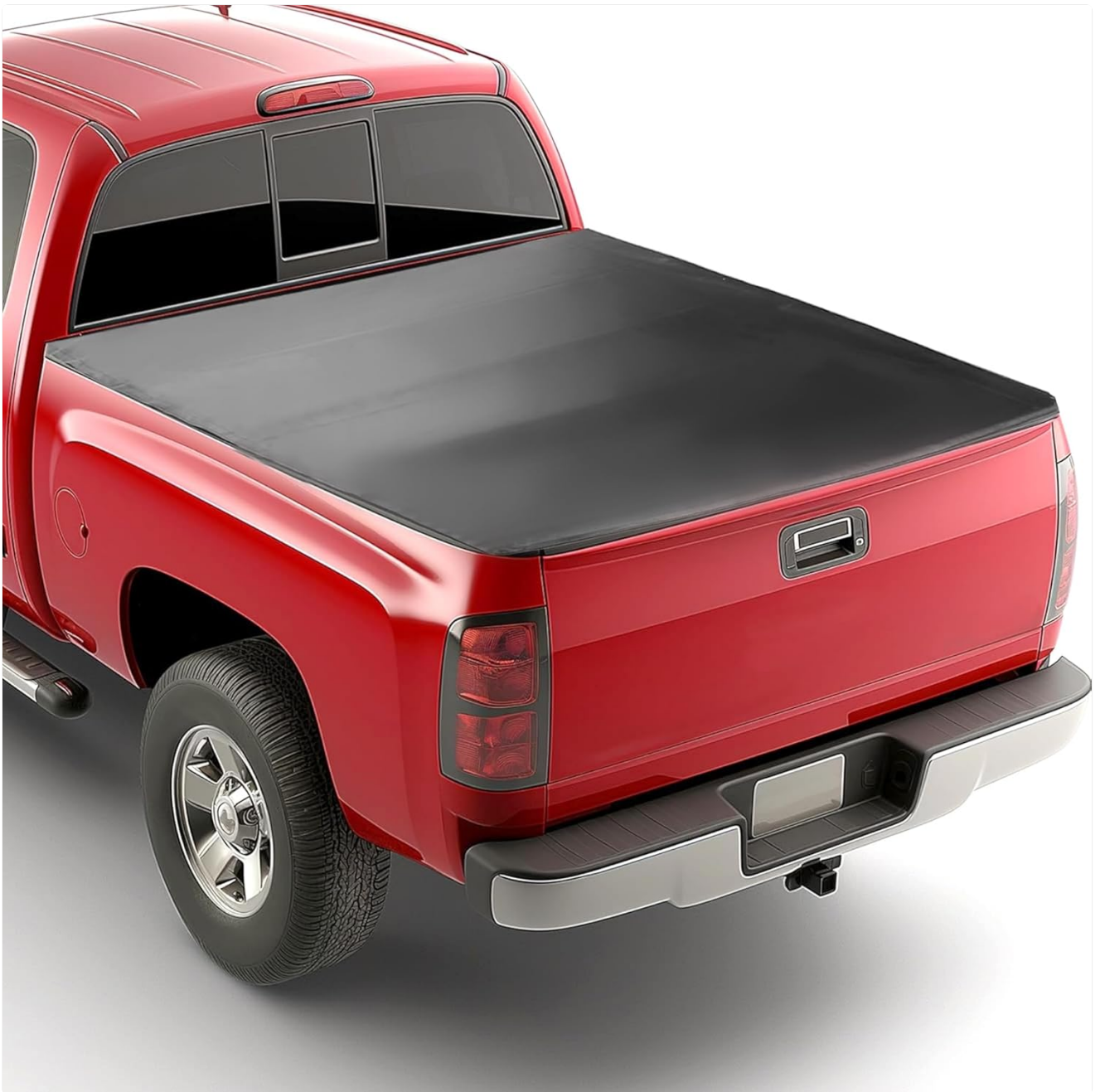
Image 1.1: The HECASA Roll-up Soft Truck Tonneau Cover securely installed on the bed of a red pickup truck, providing a sleek and protected cargo area.