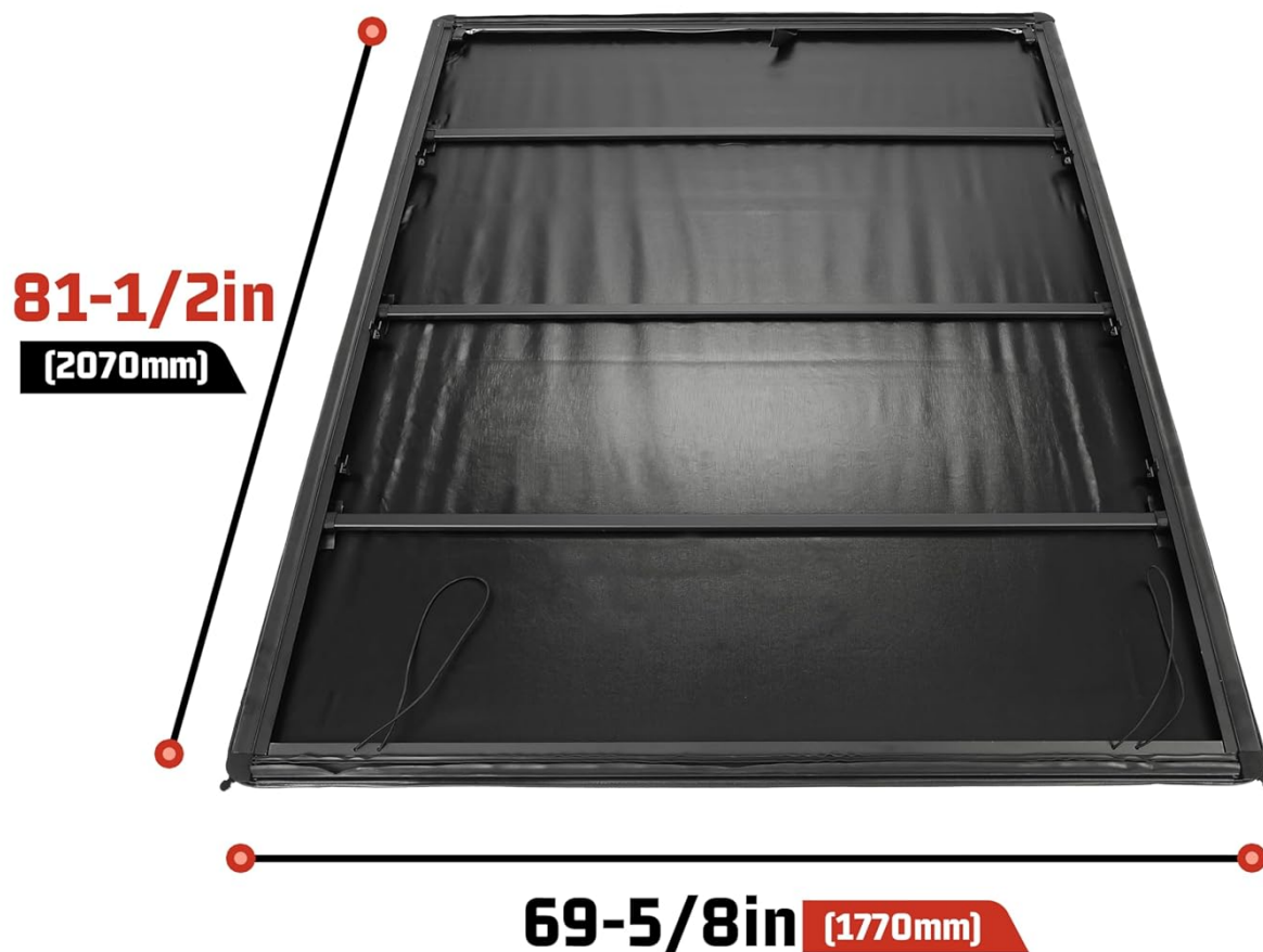
Image 8.1: Technical drawing showing the approximate length (81-1/2 inches / 2070mm) and width (69-5/8 inches / 1770mm) of the tonneau cover.