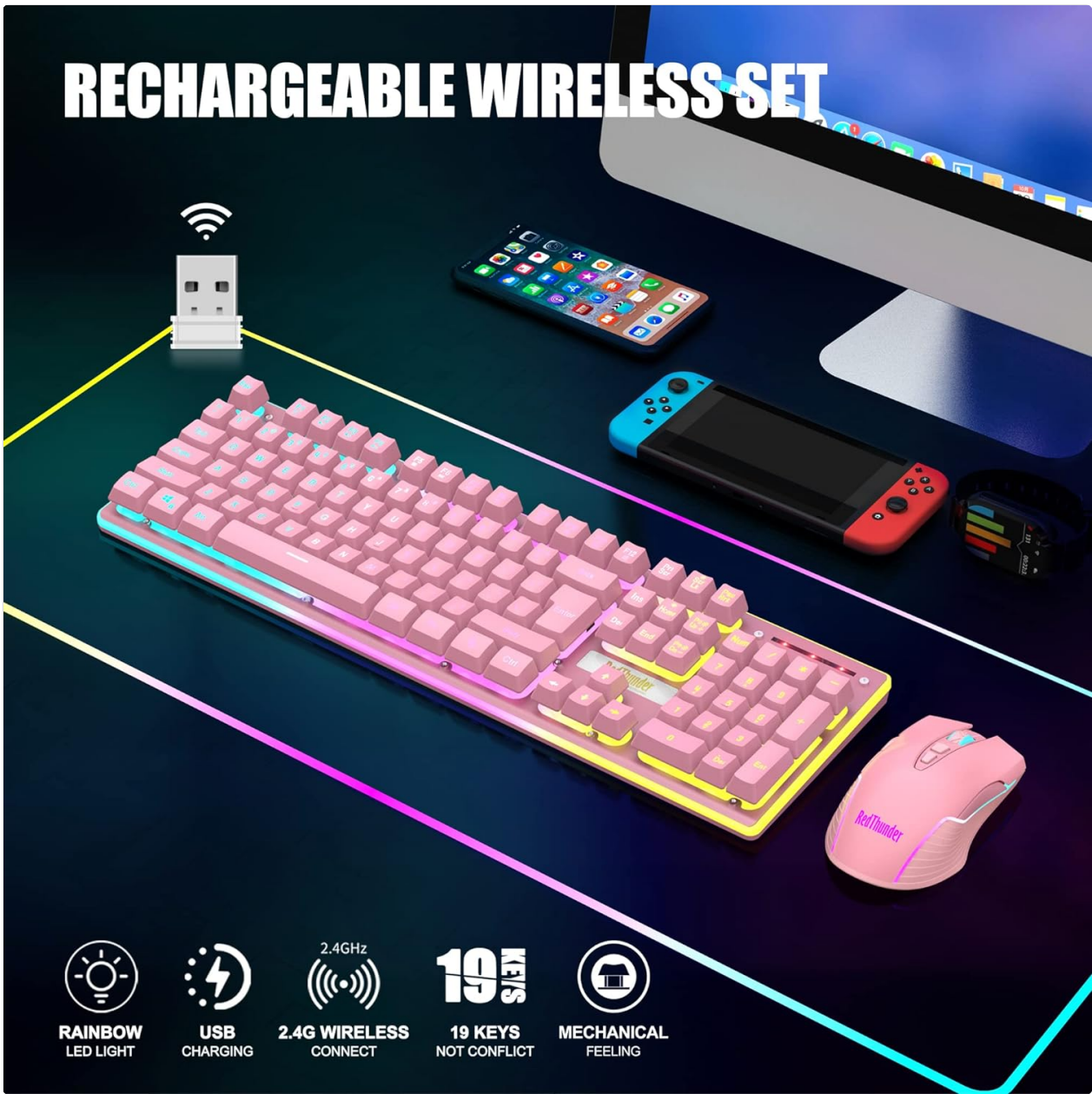
Figure 3.2: Rechargeable Wireless Set. The image shows the keyboard and mouse in a typical desktop setup, emphasizing their wireless capability and compatibility with various devices.