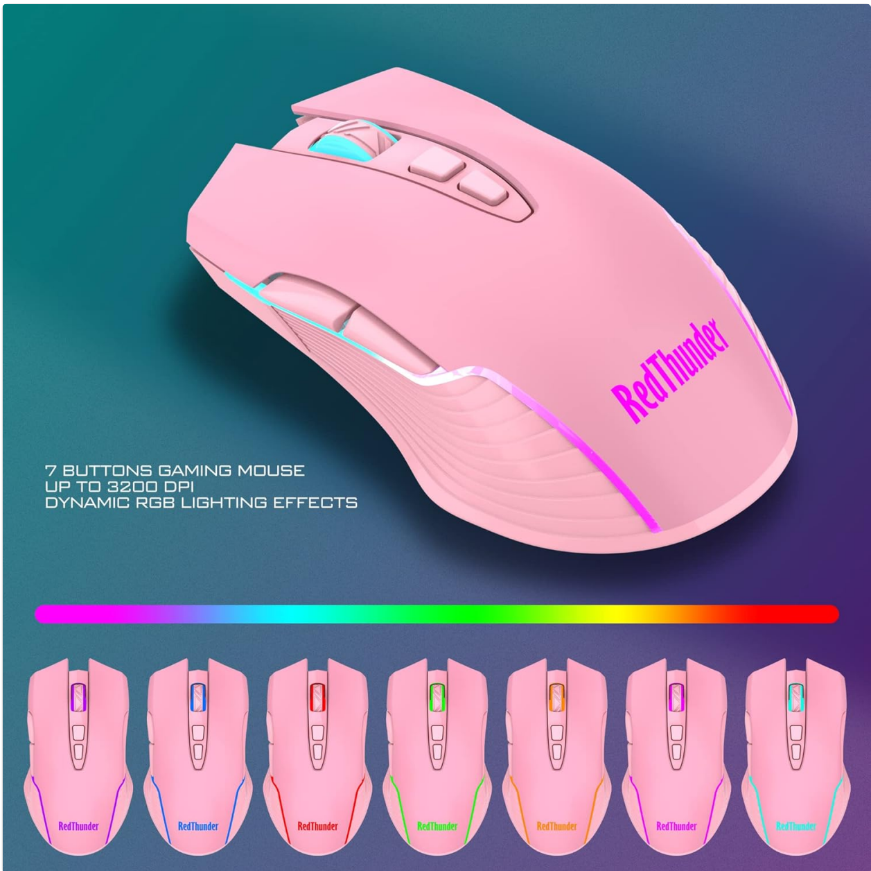
Figure 3.6: 7 Buttons Gaming Mouse. This visual showcases the mouse's 7-button layout and its dynamic 7-color cyclic gradual lighting effect. Note that the mouse's light mode is not adjustable.