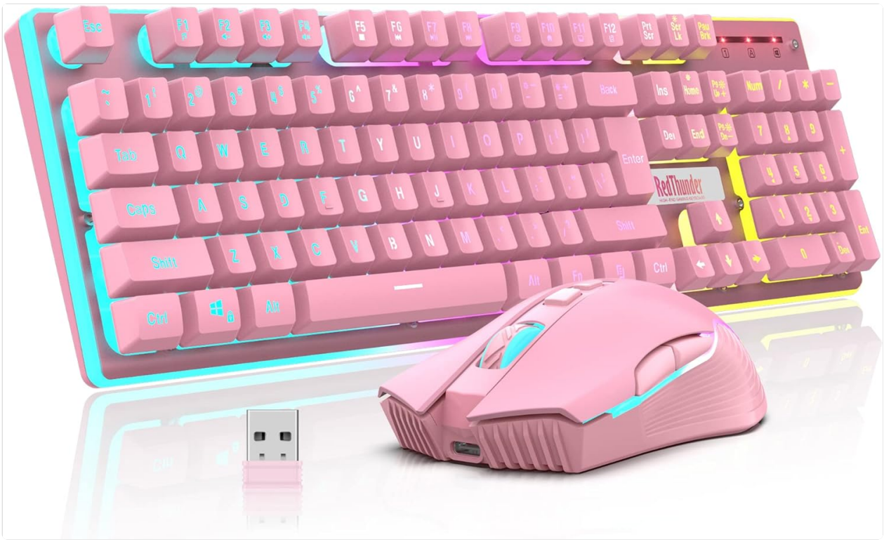
Figure 3.1: RedThunder K10 Wireless Gaming Keyboard and Mouse Combo. This image displays the pink keyboard and mouse, along with the USB receiver, highlighting their integrated design and vibrant backlighting.