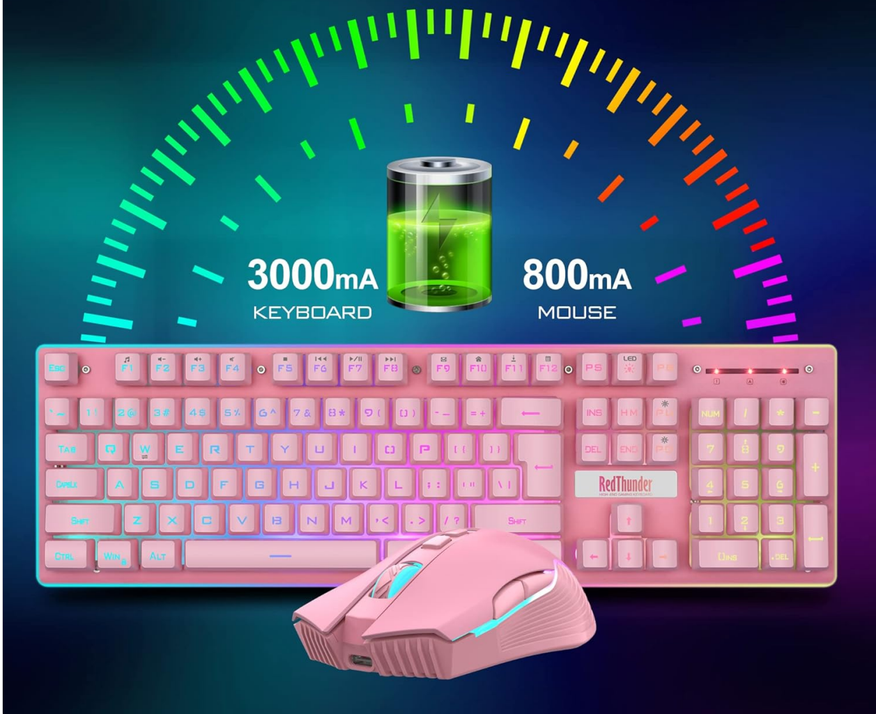
Figure 3.3: Super Battery Life. This graphic illustrates the high capacity batteries: 3000mAh for the keyboard and 800mAh for the mouse, ensuring extended usage.