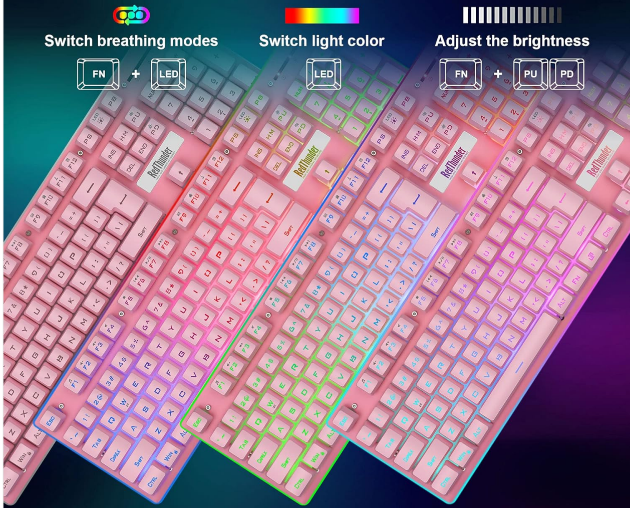
Figure 3.4: Shining Your Gaming Desk. This image demonstrates the keyboard's three groups of rainbow backlight effects, showing how to switch breathing modes, light colors, and adjust brightness using FN key combinations.