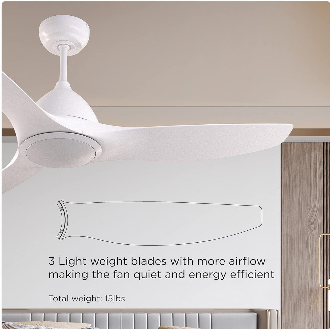
Image: Close-up view of the fan motor and one blade, illustrating the lightweight construction and how blades attach.