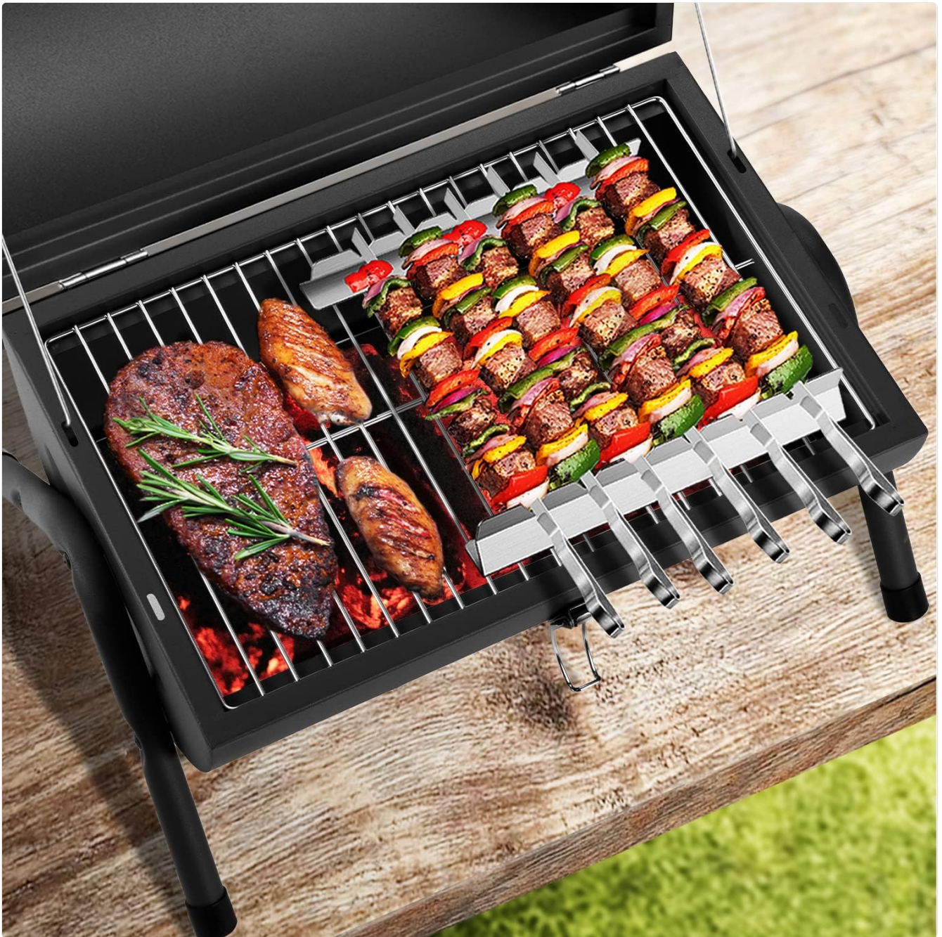
Figure 5.1: Grilling various foods on the cooking grid.