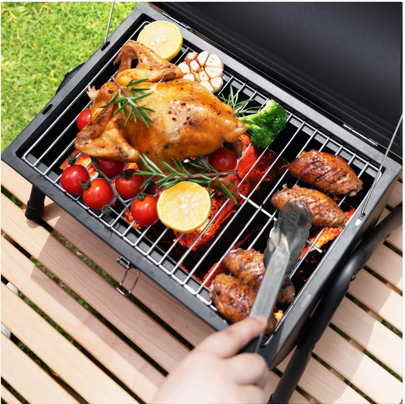
Figure 5.2: Grill capacity for larger items like a whole chicken.