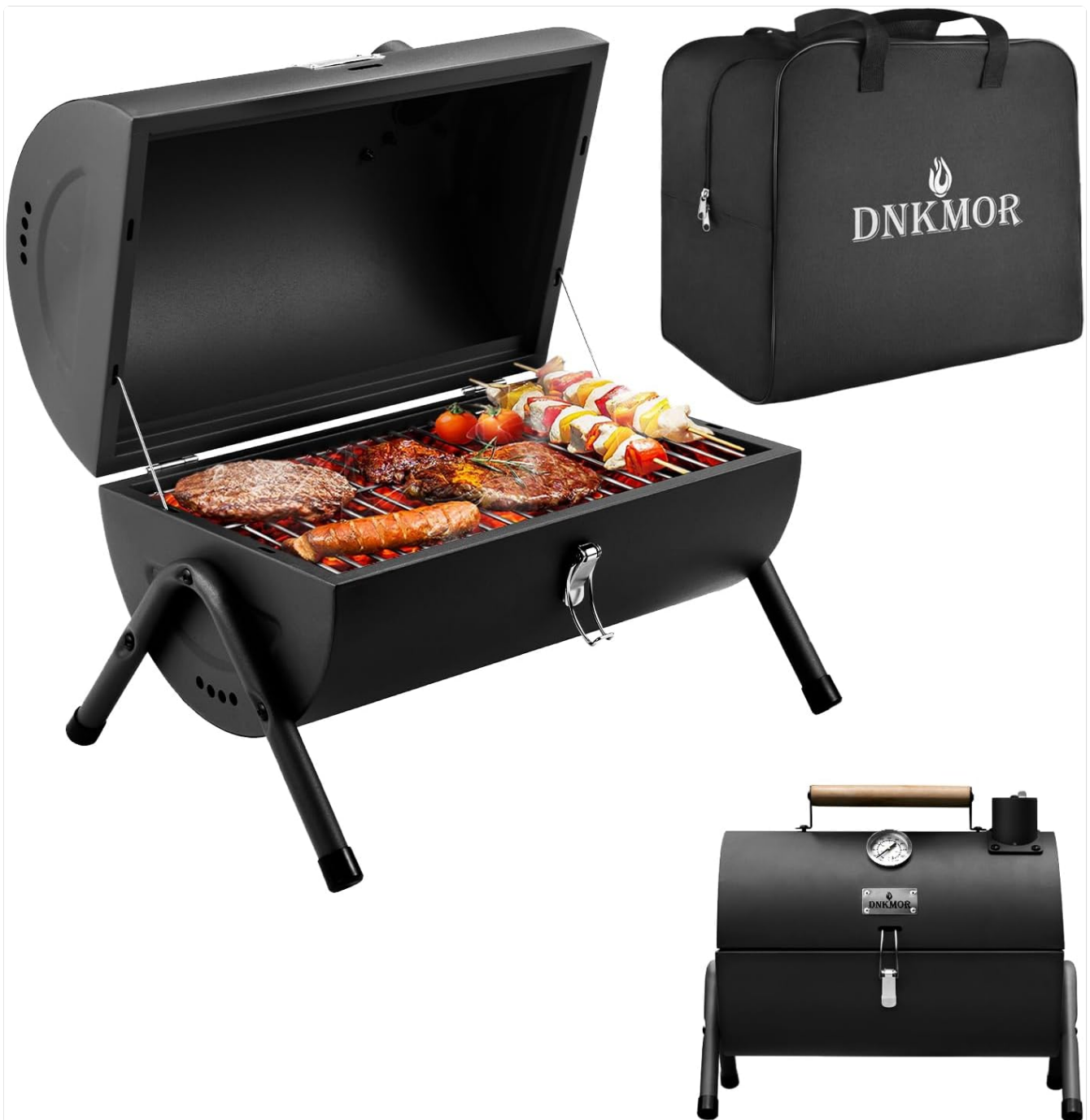
Figure 4.1: Assembled DNKMOR Portable Charcoal Grill.