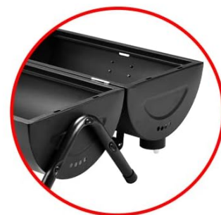
HEAT RESISTANT POWDER