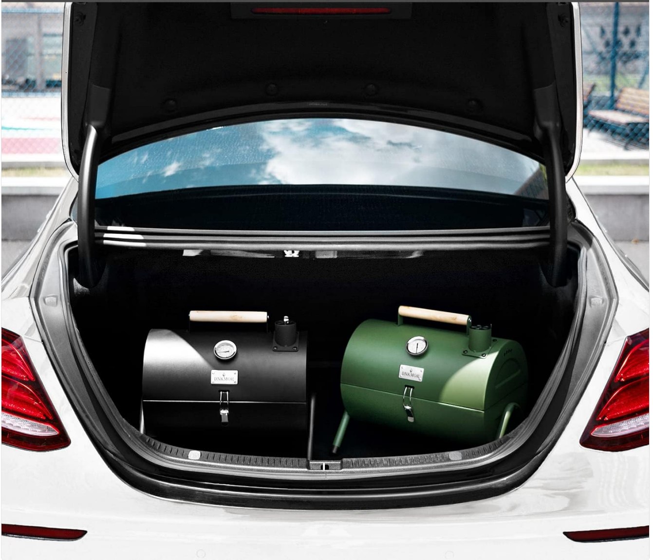
Figure 8.2: Compact size for portability.