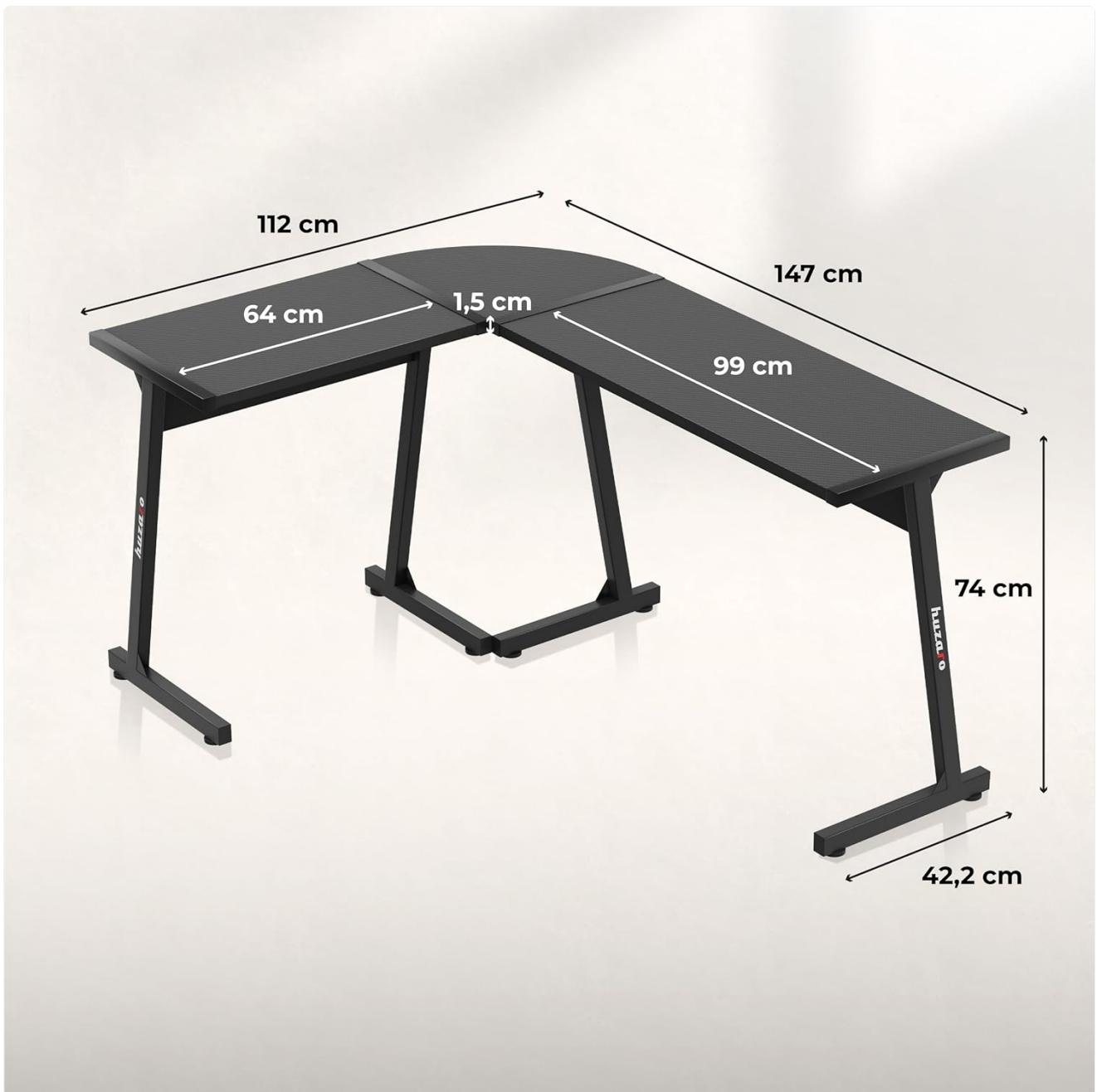
Image: The Huzaro Hero 6.0 Corner Desk with key dimensions indicated in centimeters, including overall length, width, height, and tabletop thickness.