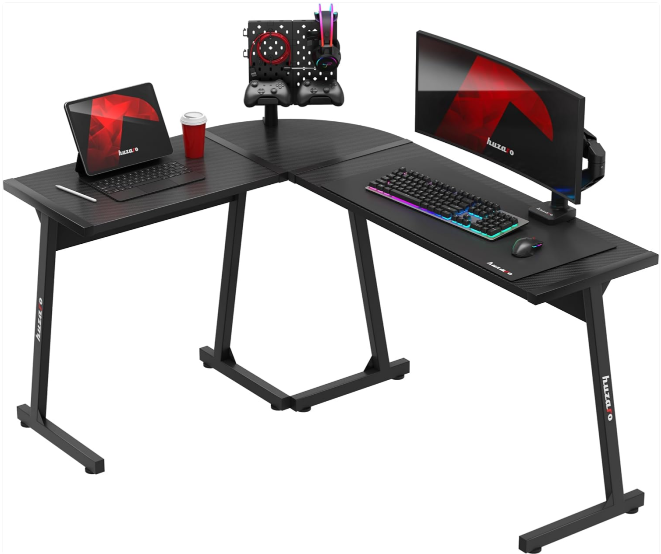
Image: The Huzaro Hero 6.0 Corner Desk, showcasing its L-shaped design with a gaming monitor, keyboard, mouse, and laptop setup. This image illustrates the desk's primary use case and ample surface area.