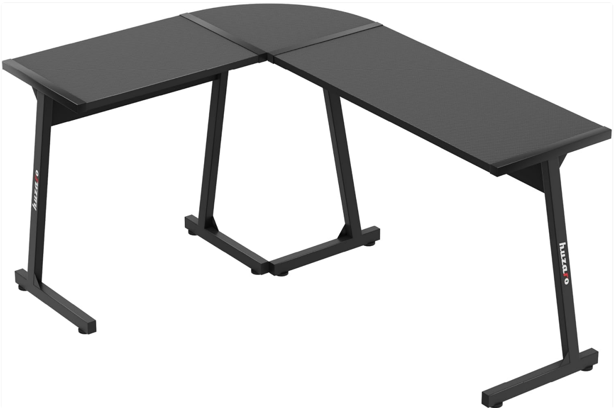
Image: The Huzaro Hero 6.0 Corner Desk configured for a right-hand setup, showing the shorter side extending to the right.