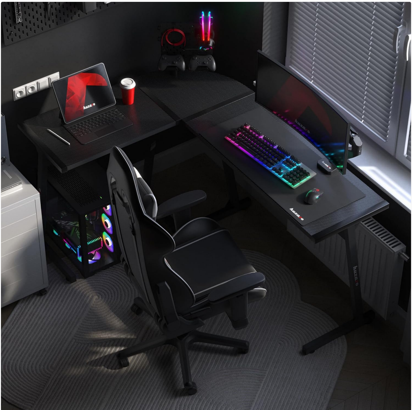
Image: The Huzaro Hero 6.0 Corner Desk integrated into a modern room setup, complete with a gaming chair, demonstrating its suitability for home office or gaming environments.