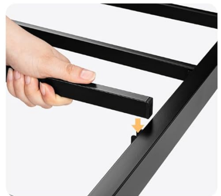
Easy Assemble Slats