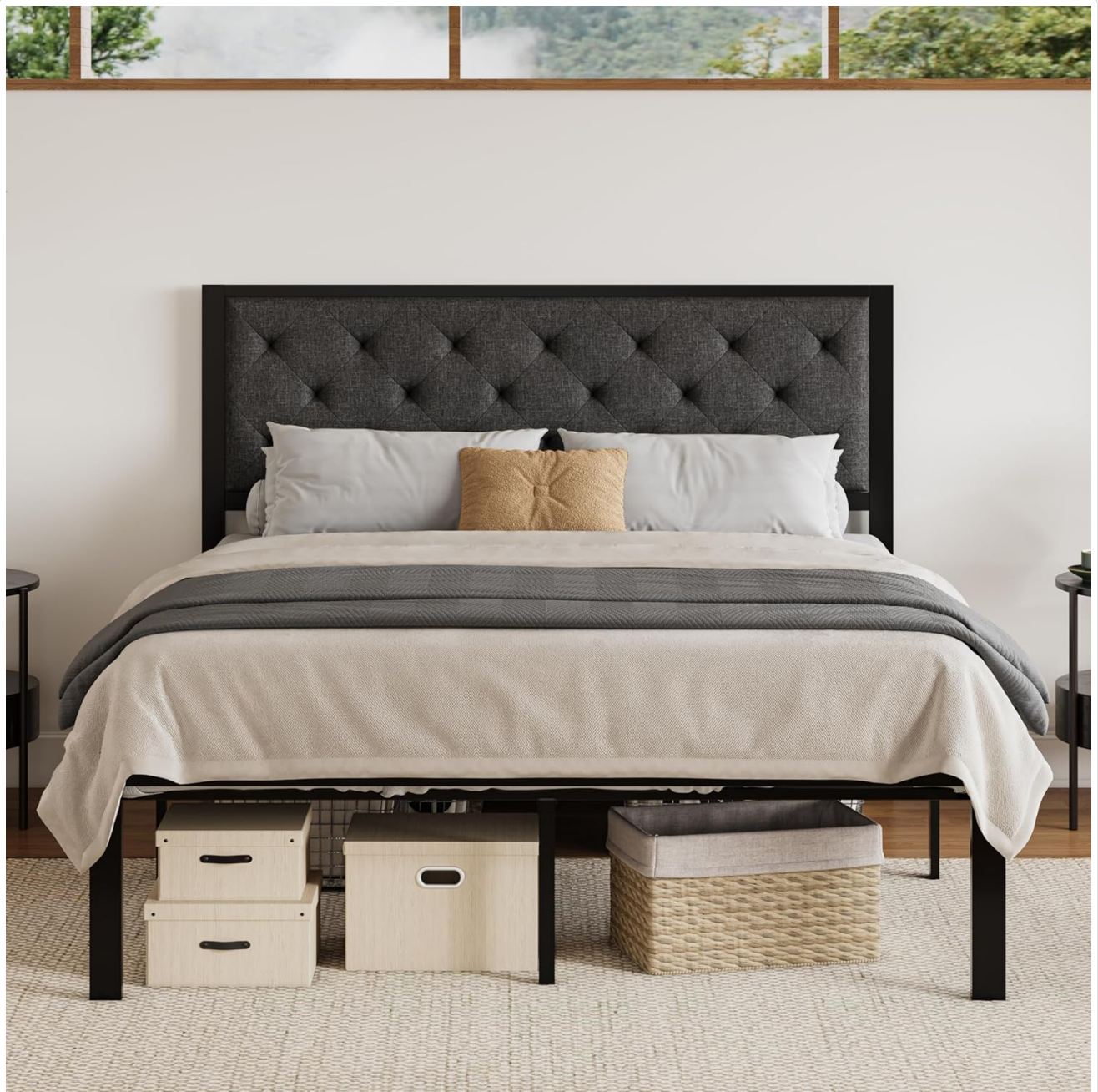
Figure 2.1: Fully assembled SHA CERLIN Queen Size Metal Platform Bed Frame with mattress.