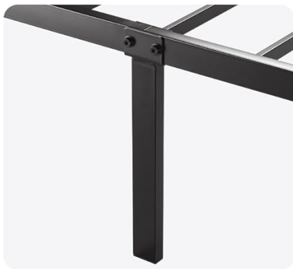
Thickened Support Leg