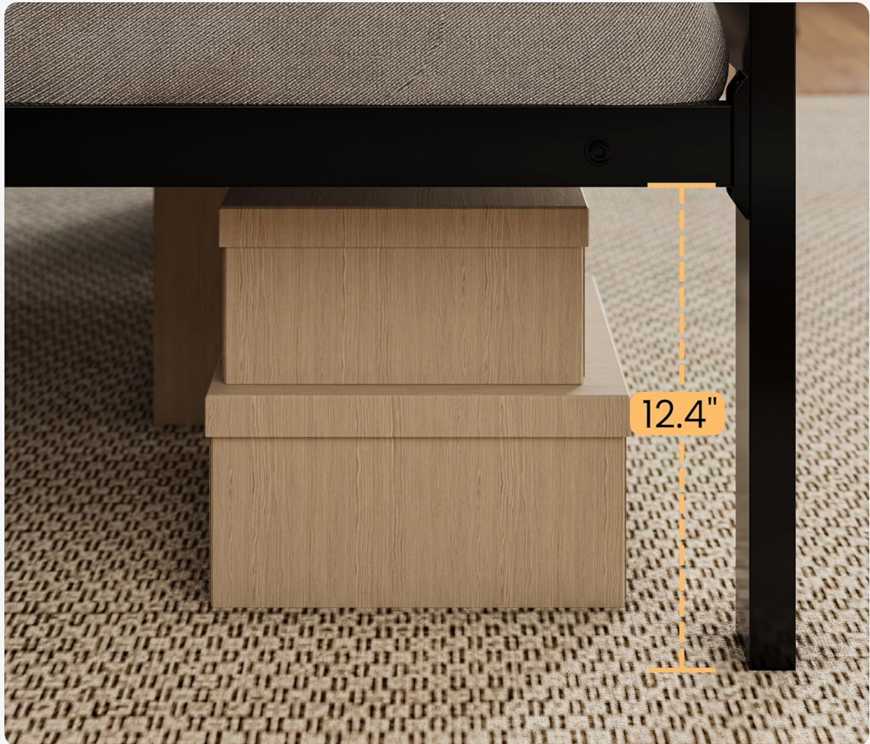
Figure 5.2: The generous 12.4-inch under-bed clearance provides convenient storage space.