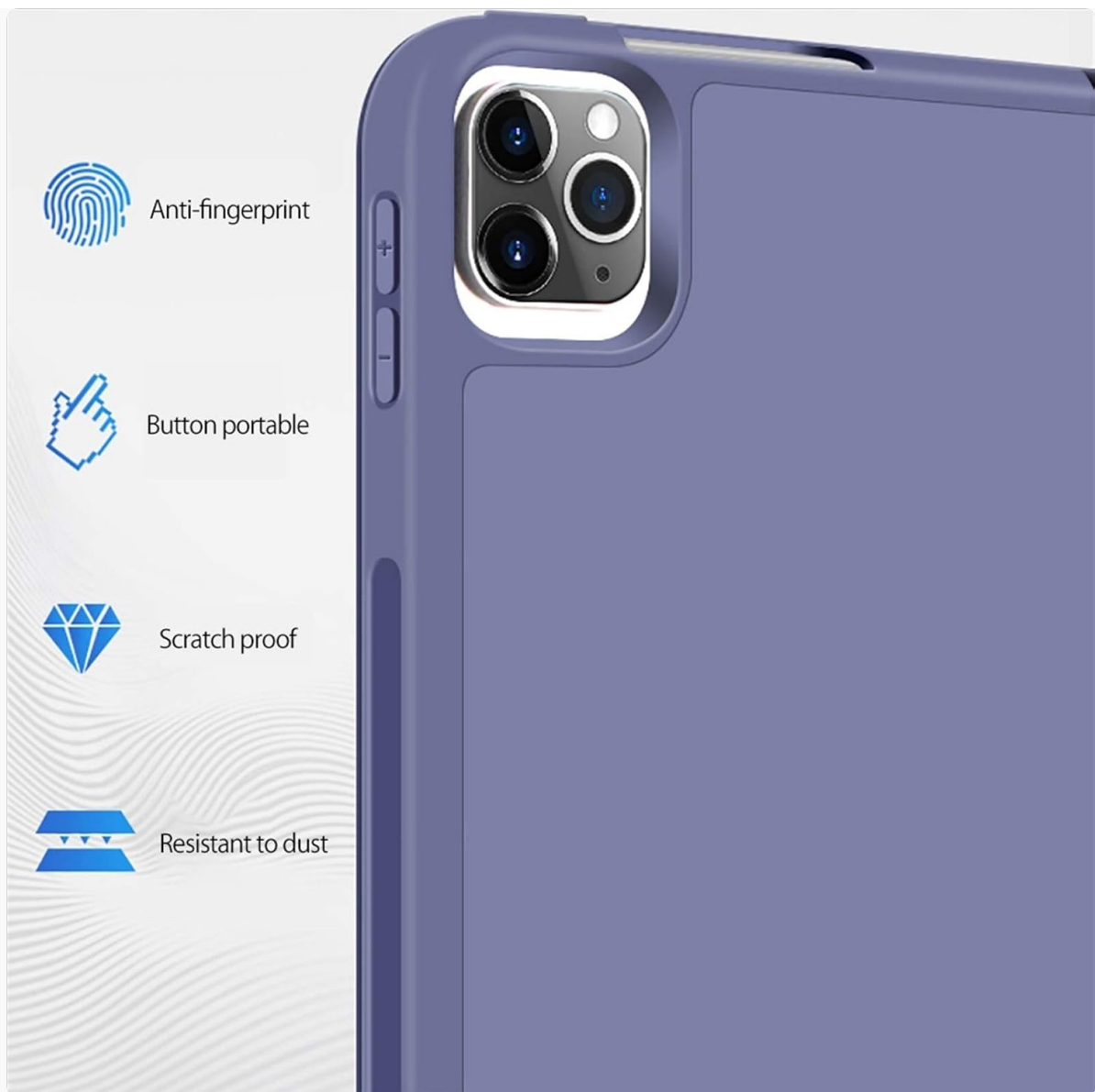
Image 4.3: Detail of the case's design, highlighting accurate cutouts for the camera and volume buttons, ensuring unhindered access and functionality.