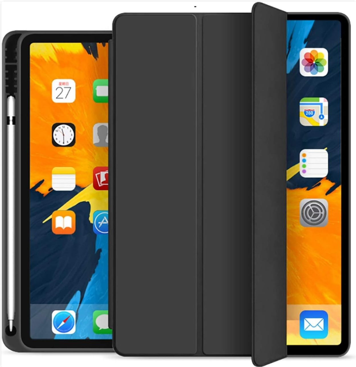
Image 1.1: The HAODEE Protective Case in black, shown with an iPad inserted, highlighting its sleek design and protective coverage. The case features a tri-fold front cover.