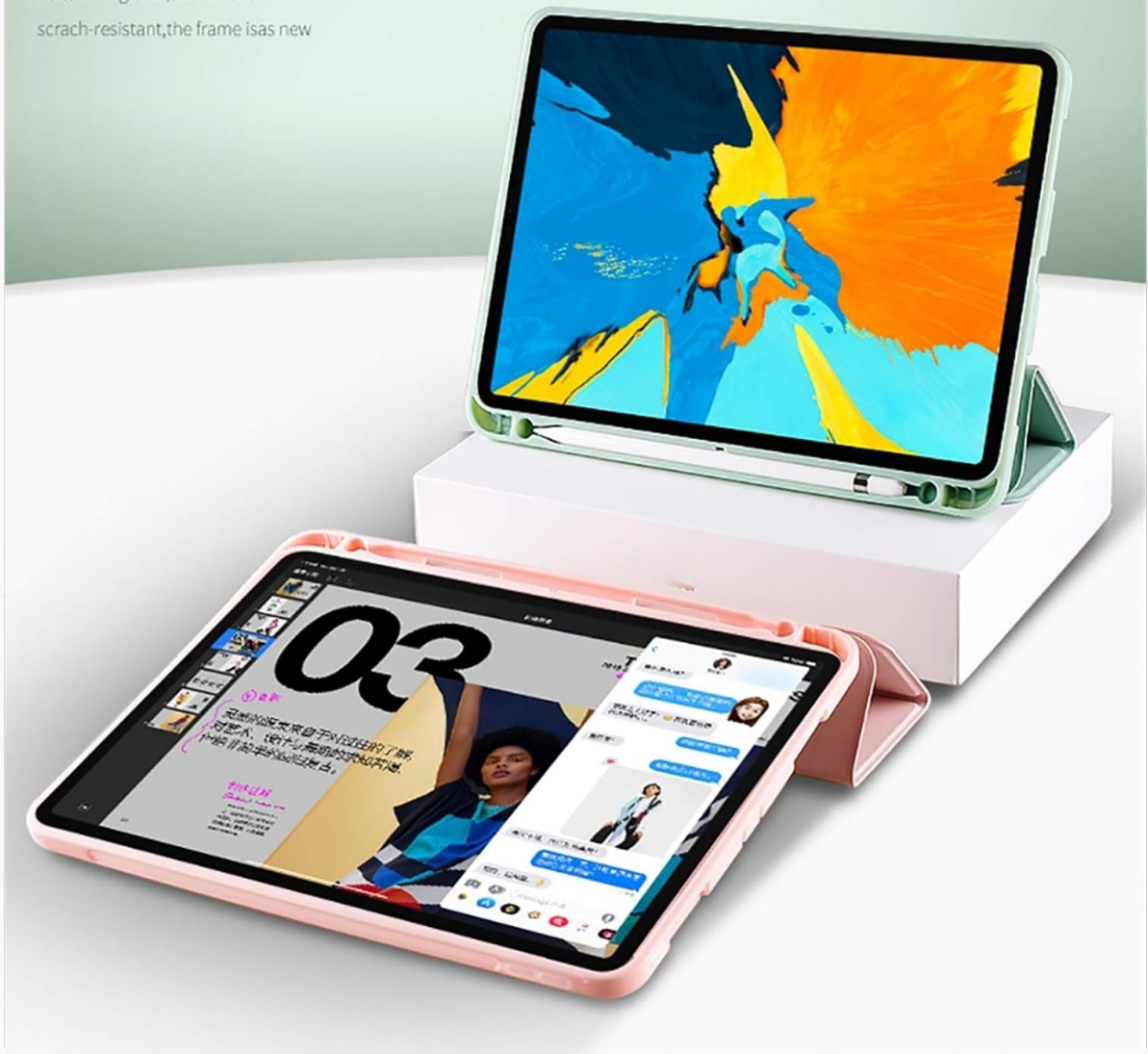
Image 4.2: The case supports two viewing angles: an upright position ideal for watching videos or video calls, and a lower angle suitable for typing or drawing.