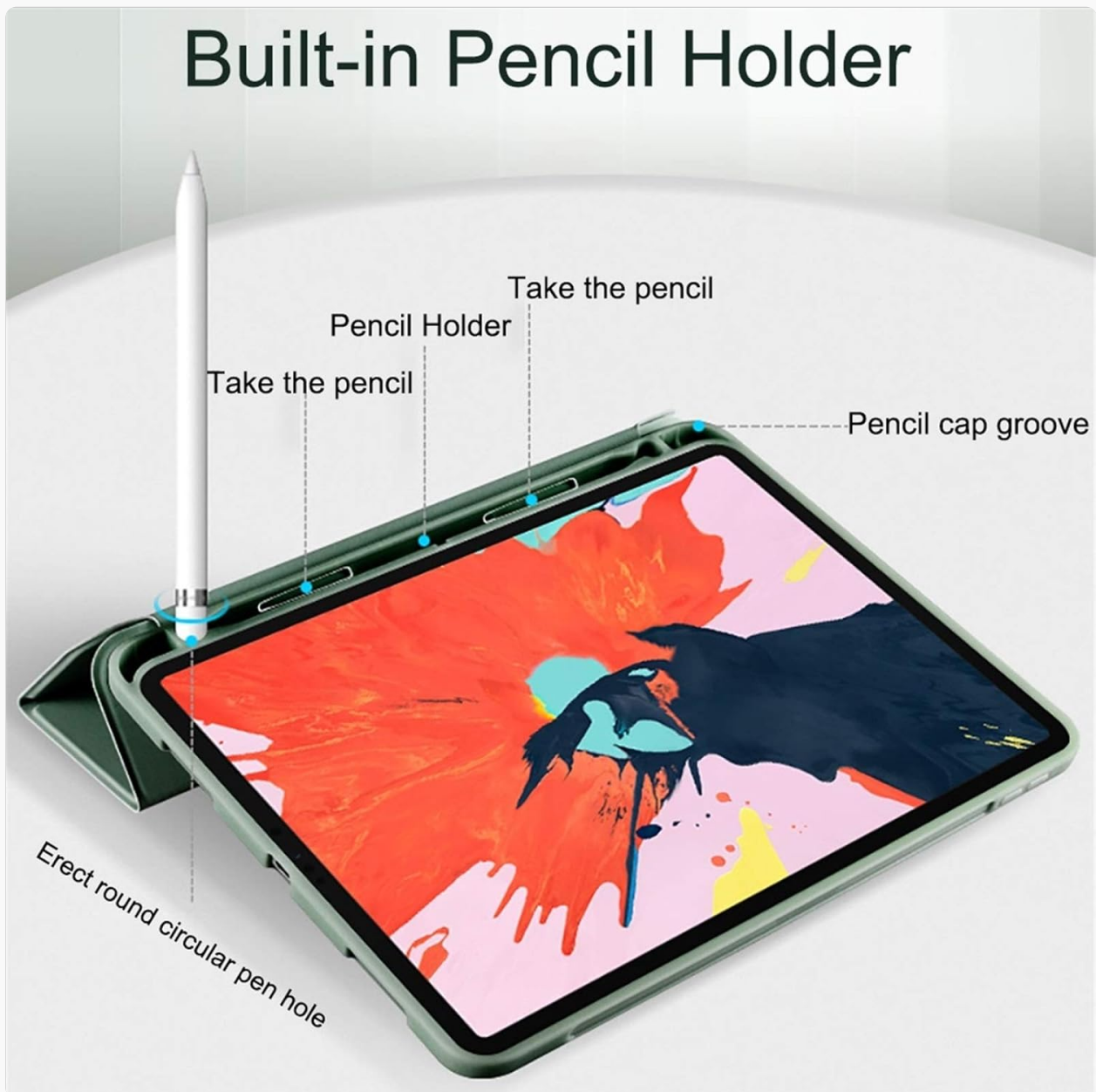
Image 3.1: Illustration of the integrated pencil holder, designed to securely store your Apple Pencil and prevent loss or damage. It includes a groove for the pencil cap.