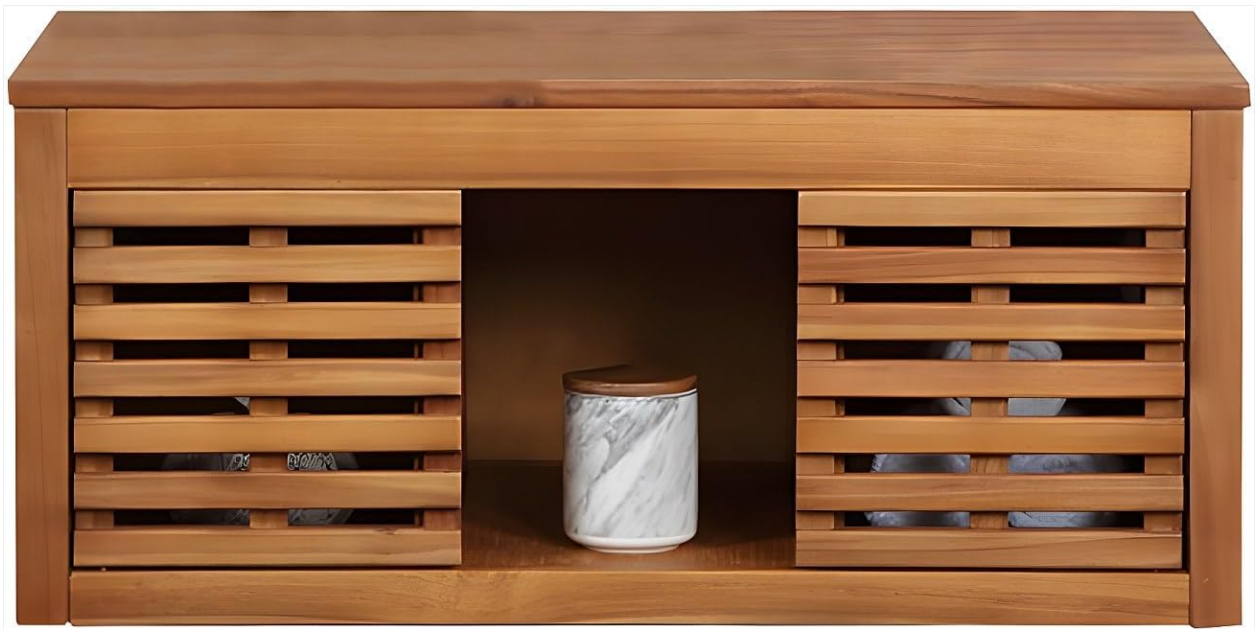
Image 5.1: Front view of the vanity unit, highlighting the slatted doors and the open niche.