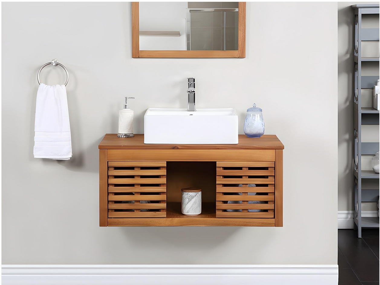
Image 1.1: The PENEDEL vanity unit integrated into a bathroom setting, showcasing its wall-mounted design and storage capabilities.