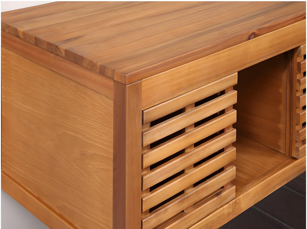
Image 4.1: The internal structure of the vanity unit with doors open, showing the two storage compartments behind the doors and the central open niche.