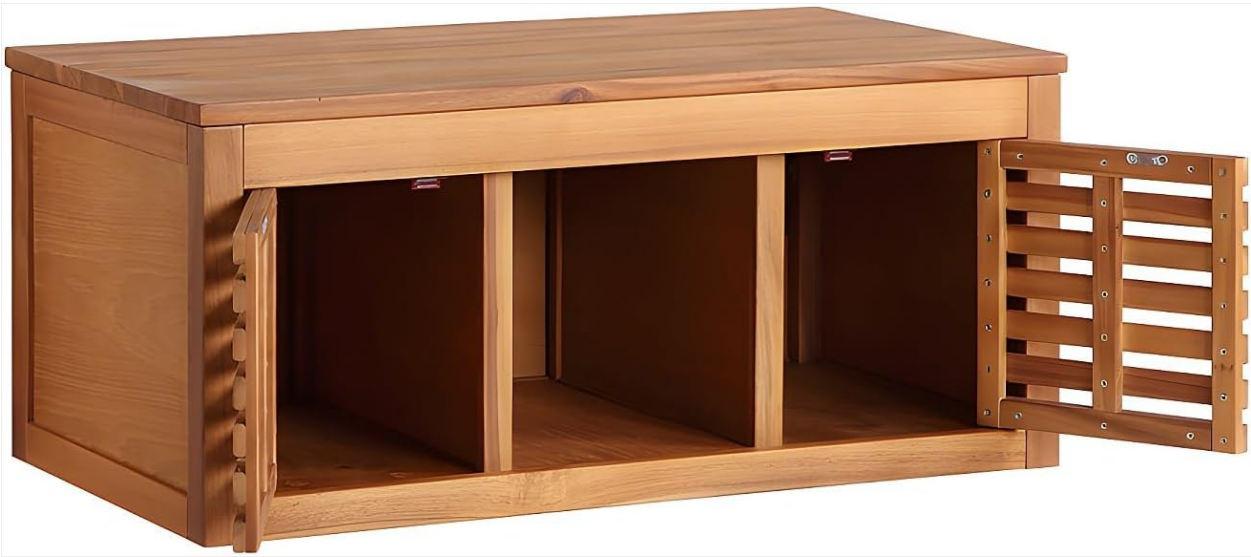
Image 6.1: Close-up of the acacia wood finish and slatted door detail, emphasizing the natural texture.