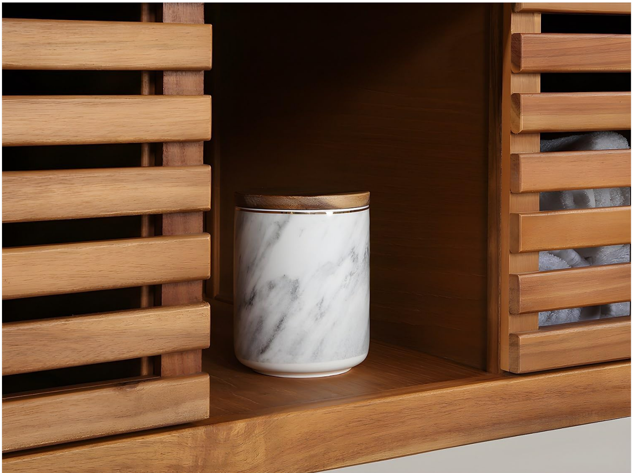
Image 5.2: Detailed view of the open niche, suitable for decorative items or easy-access storage.