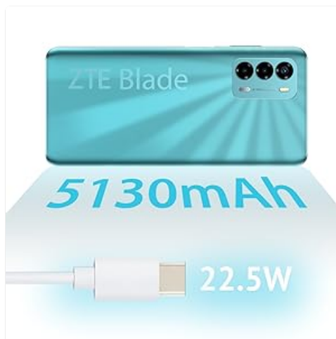
Image: Visual representation of the 5130mAh battery capacity and 22.5W fast charging capability.