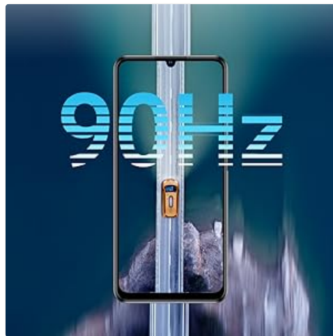
Image: Graphic illustrating the 90Hz refresh rate for smoother scrolling and gaming experience.