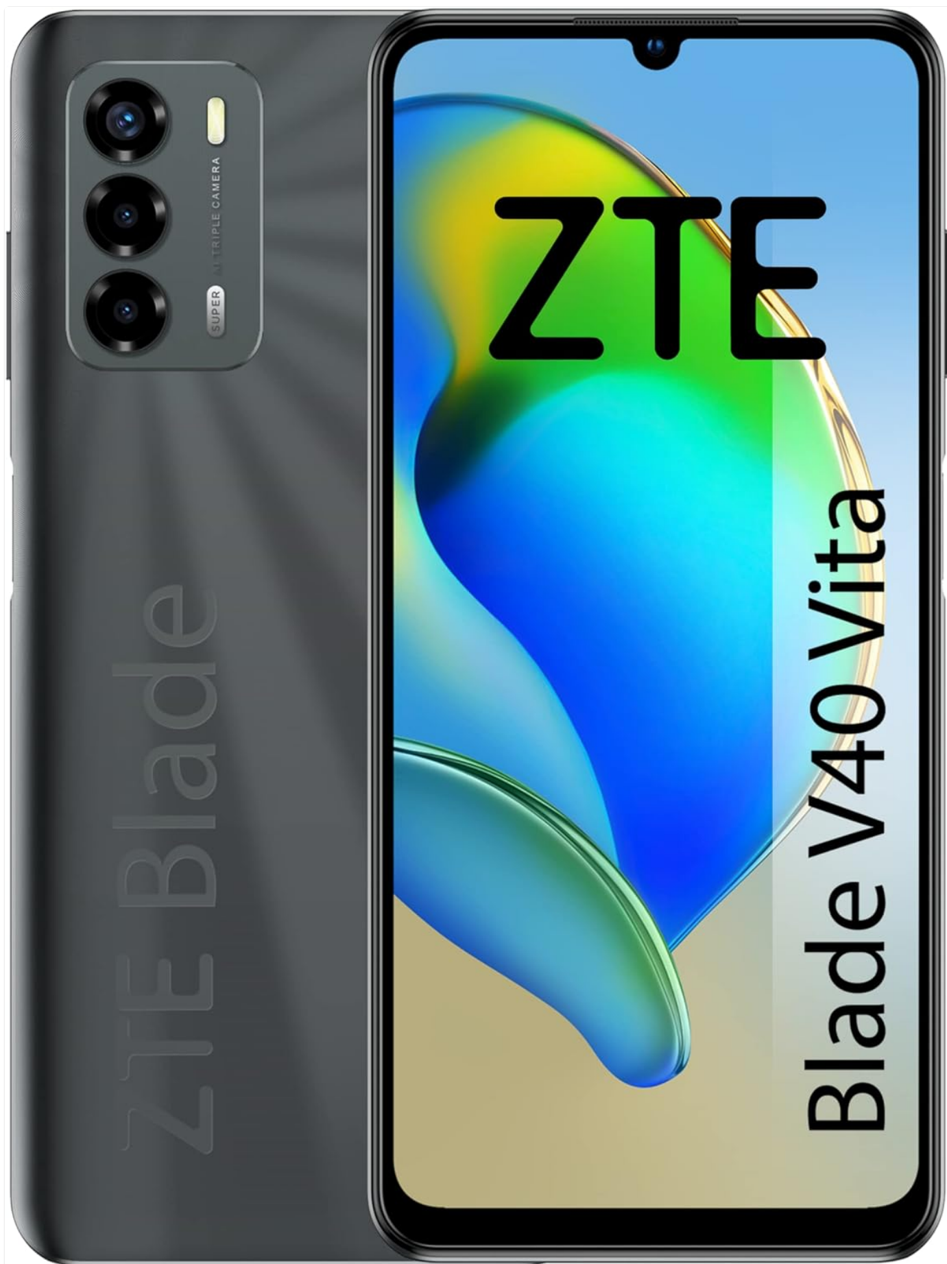
Image: Front and back view of the ZTE Blade V40 Vita Smartphone, showcasing its design and triple camera setup.