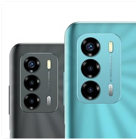
Image: Close-up view of the triple camera setup on the ZTE Blade V40 Vita, highlighting the lens arrangement.