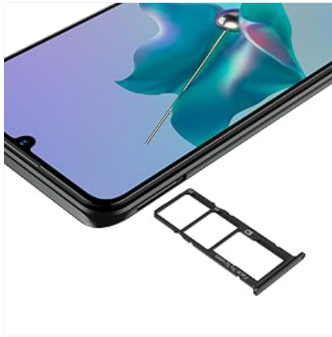
Image: Illustration of the SIM and microSD card tray, showing how to insert the cards.