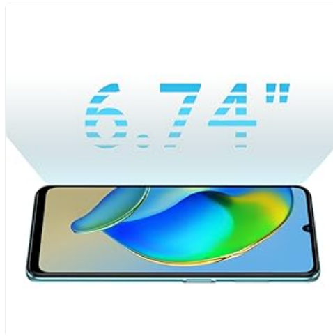
Image: Depiction of the 6.74-inch display size of the ZTE Blade V40 Vita.