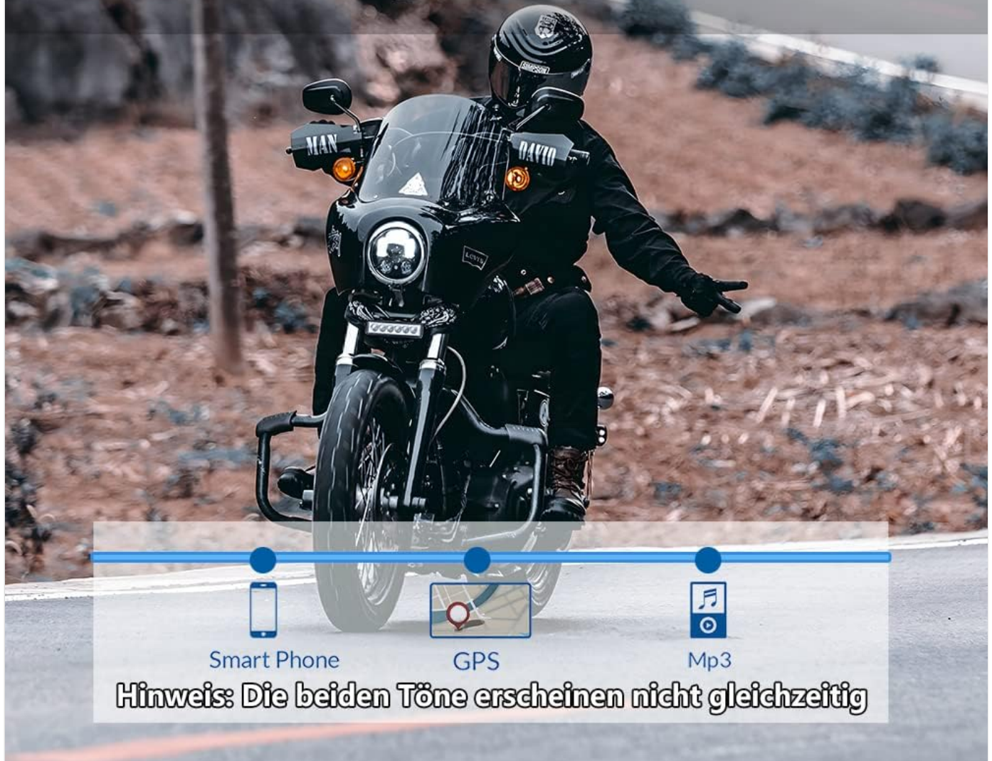
Figure 5.1: The R5 can connect to two Bluetooth devices simultaneously, such as a smartphone and a GPS.

Sie können Chats auch während der Navigation wechseln