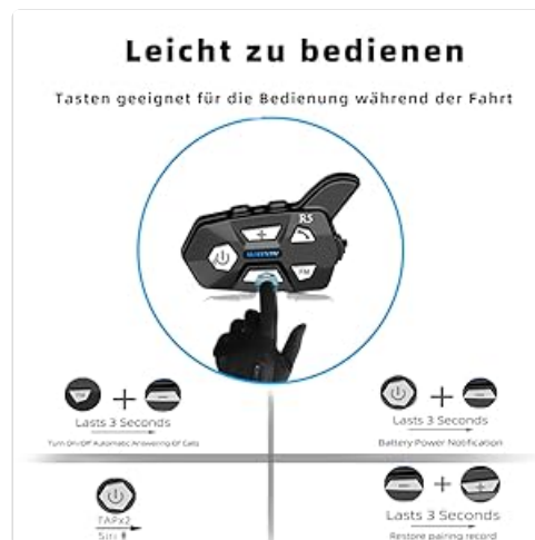
Figure 3.6: The large button design facilitates easy operation while riding.