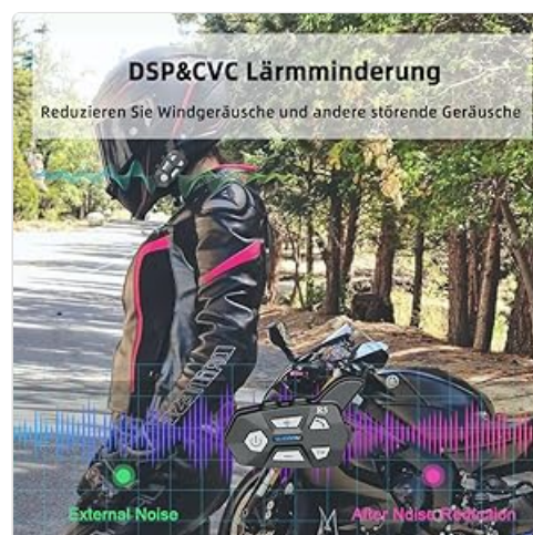
Figure 3.2: DSP and CVC technologies effectively reduce external and wind noise for clearer communication.