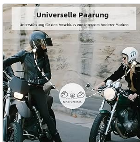
Figure 3.4: The R5 supports universal pairing with other intercom brands.