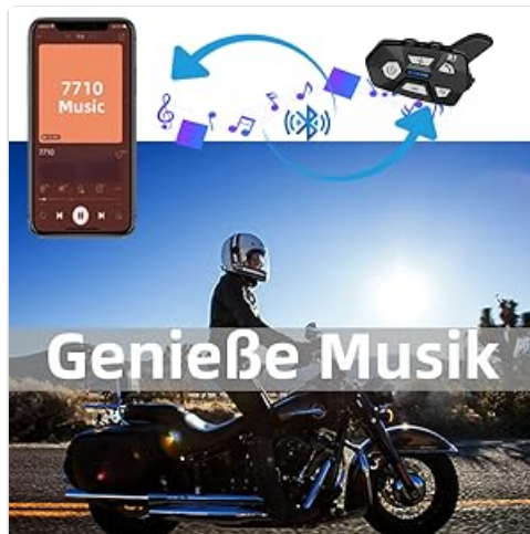
Figure 5.2: Enjoy high-quality music streaming via Bluetooth.