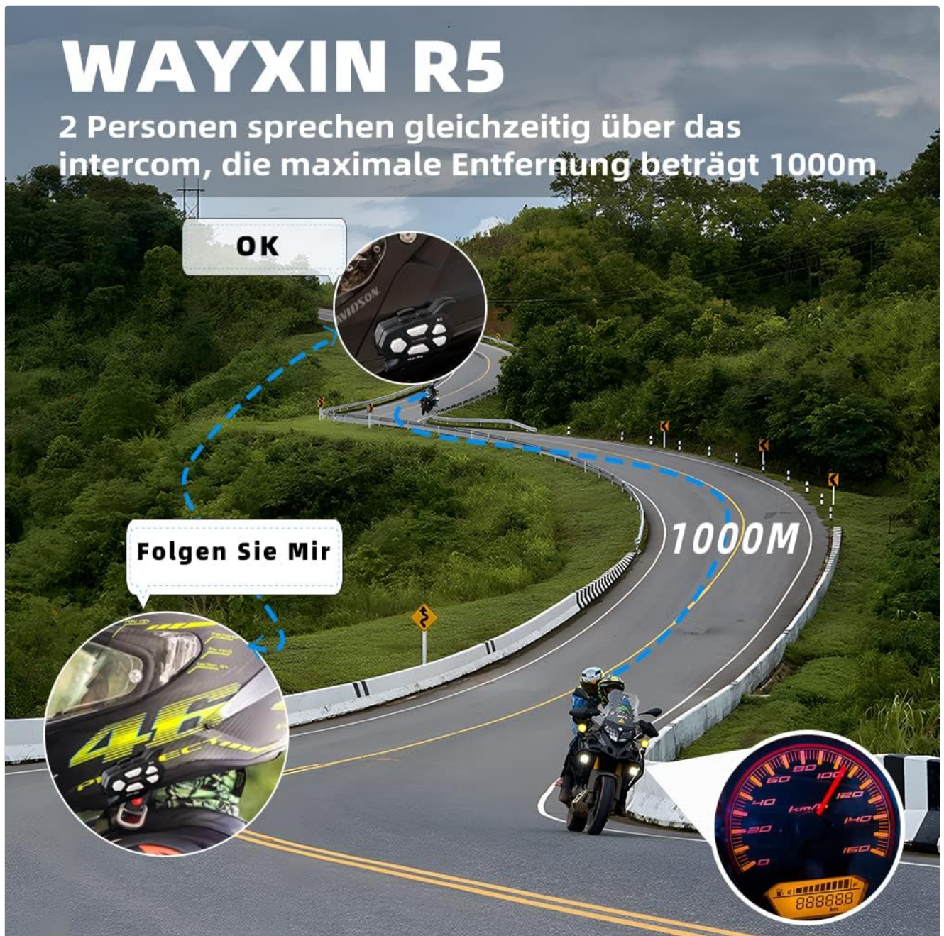
Figure 3.1: The WAYXIN R5 supports intercom communication up to 1000 meters between two riders.