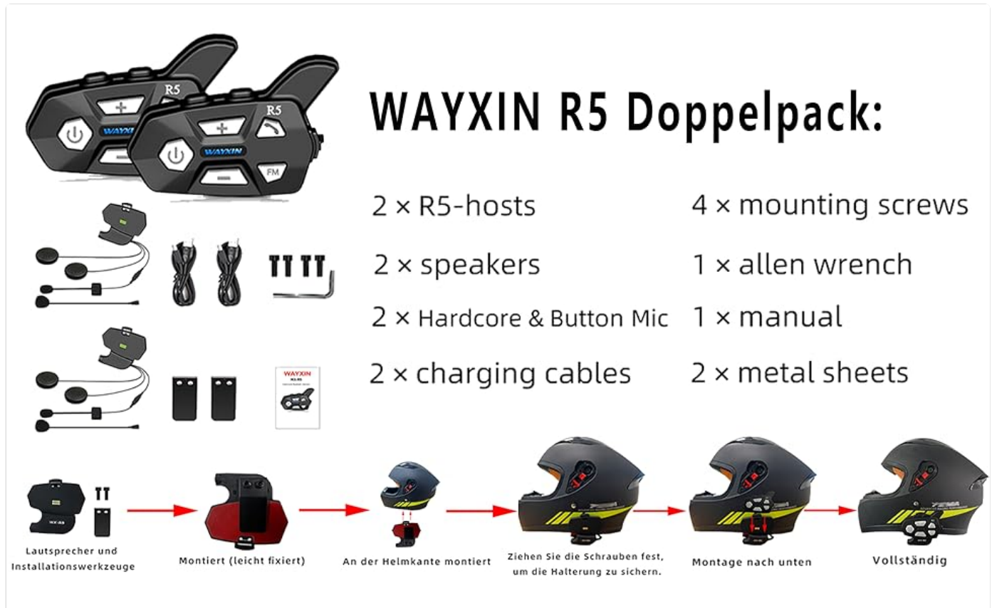
Figure 2.1: Contents of the WAYXIN R5 Double Pack.