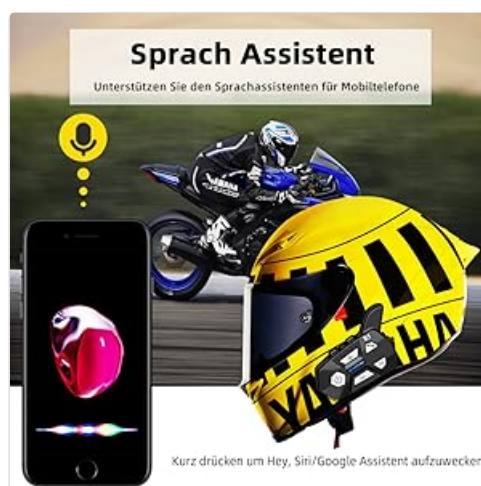
Figure 3.9: Short press to activate your mobile phone's voice assistant (Siri/Google Assistant).