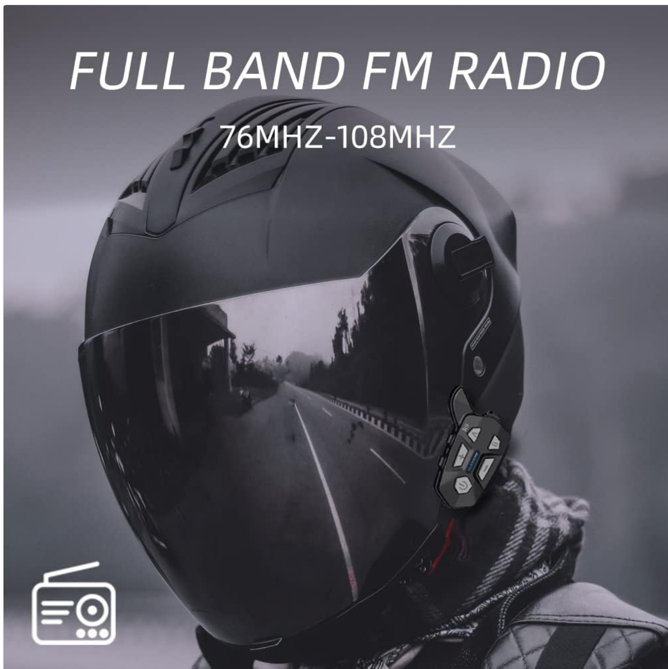
Figure 3.8: The R5 includes a full band FM radio (76MHz-108MHz).