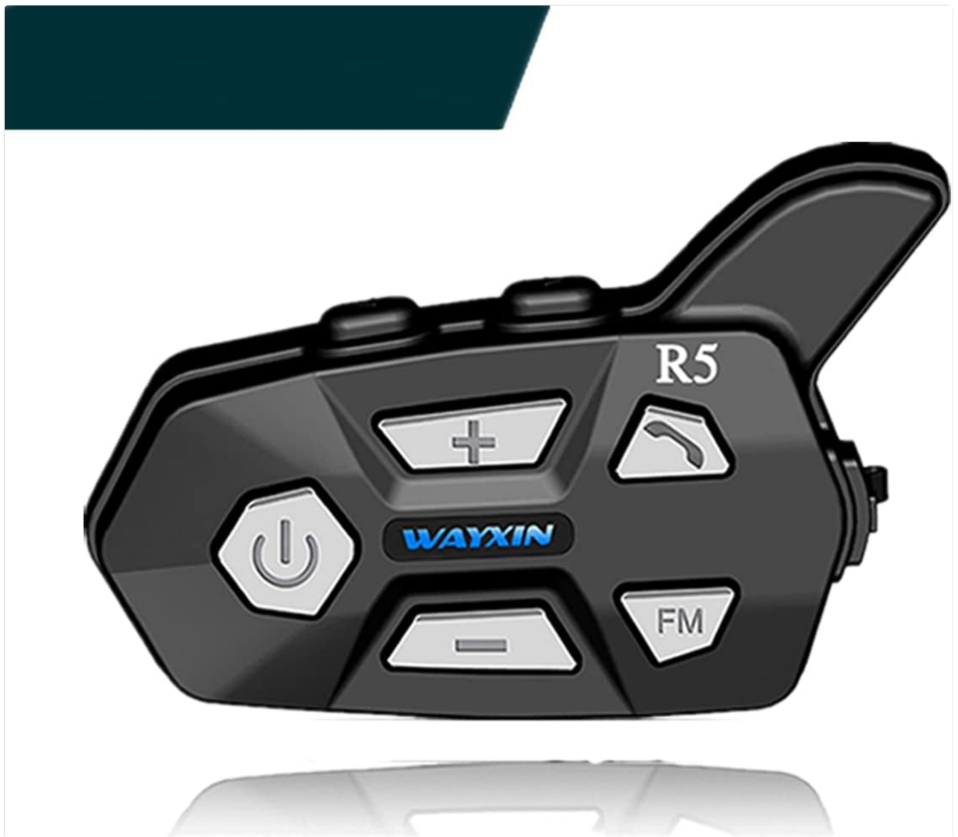
Figure 1.1: WAYXIN R5 Motorcycle Bluetooth Intercom Headset unit.