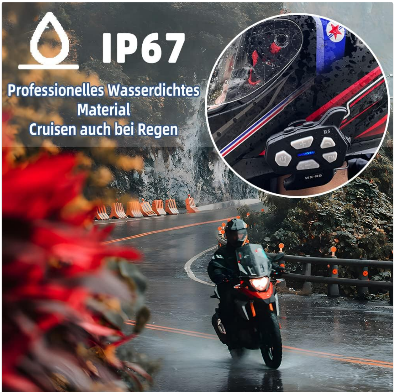
Figure 3.7: The R5 features professional IP67 waterproof material, allowing for use even in rainy conditions.