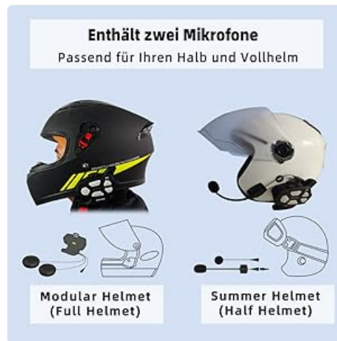
Figure 3.5: The package includes two types of microphones for compatibility with modular (full) and half helmets.