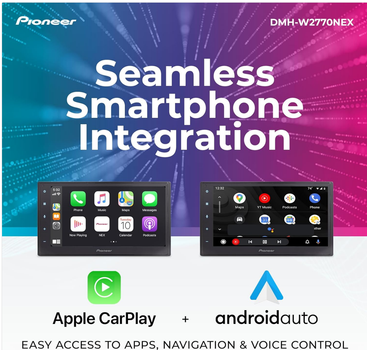
Figure 4: Seamless smartphone integration with Apple CarPlay and Android Auto.

The system will automatically detect and launch CarPlay or Android Auto.