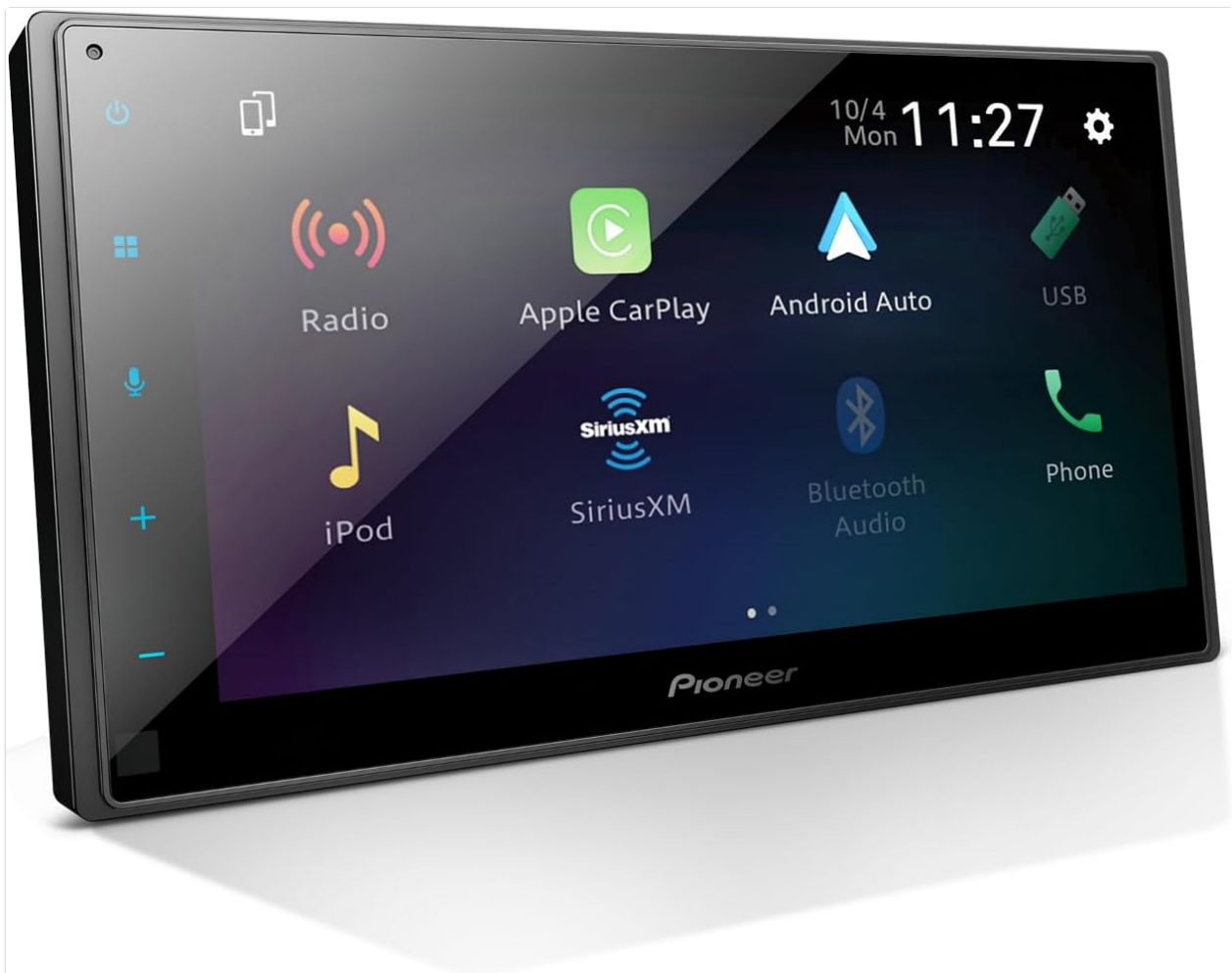
Figure 2: Front view of the Pioneer DMH-W2770NEX receiver.