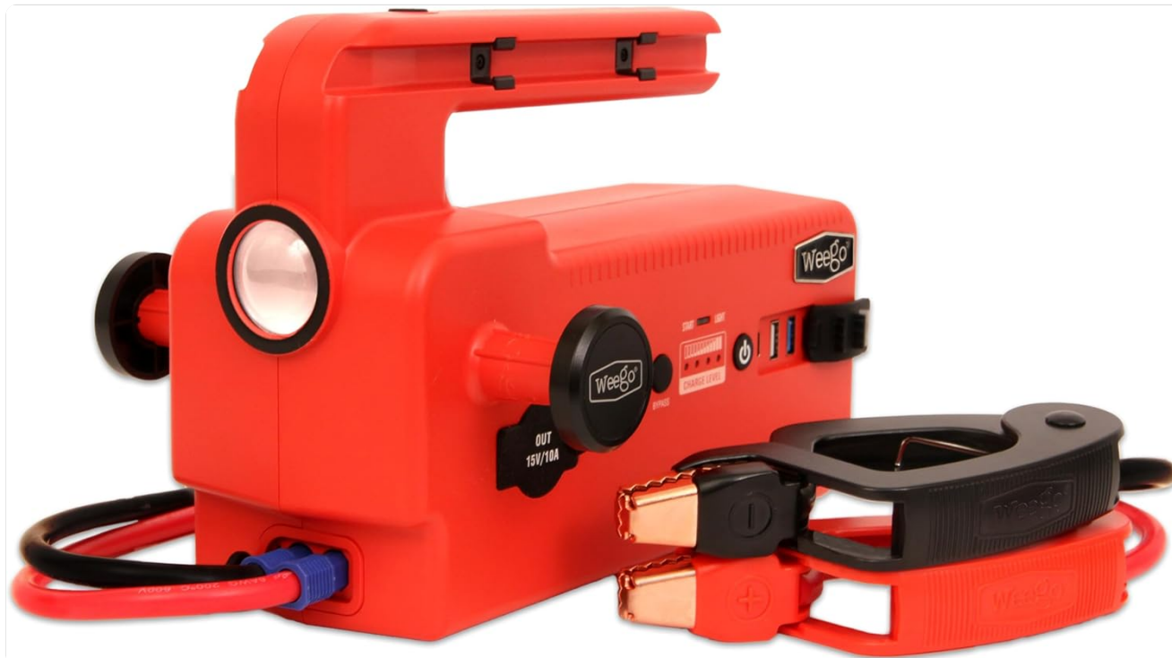
The Weego 120 Jump Starter, featuring its compact design and included Smarty Clamps.

The Weego 120 is a powerful and versatile 12V jump starter designed to provide reliable starting power for a wide range of vehicles. Weighing just 5.5 lbs, this compact device delivers 5000 peak amps and 1200 cranking amps, making it suitable for all gas engines and diesel engines up to 15L. Beyond jump starting, it functions as a portable power bank for USB and 12V devices and includes a 600 lumen flashlight. Equipped with patented Smarty Clamps and built-in safety features, the Weego 120 ensures a safe and easy jump starting experience.