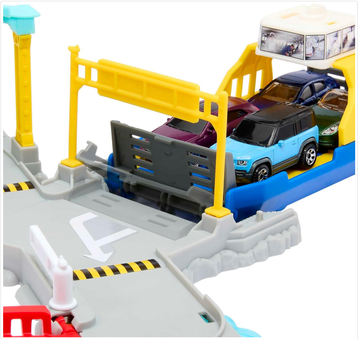
Figure 4.2: Close-up view of the ferry ramp, demonstrating its functionality for vehicle loading and unloading.