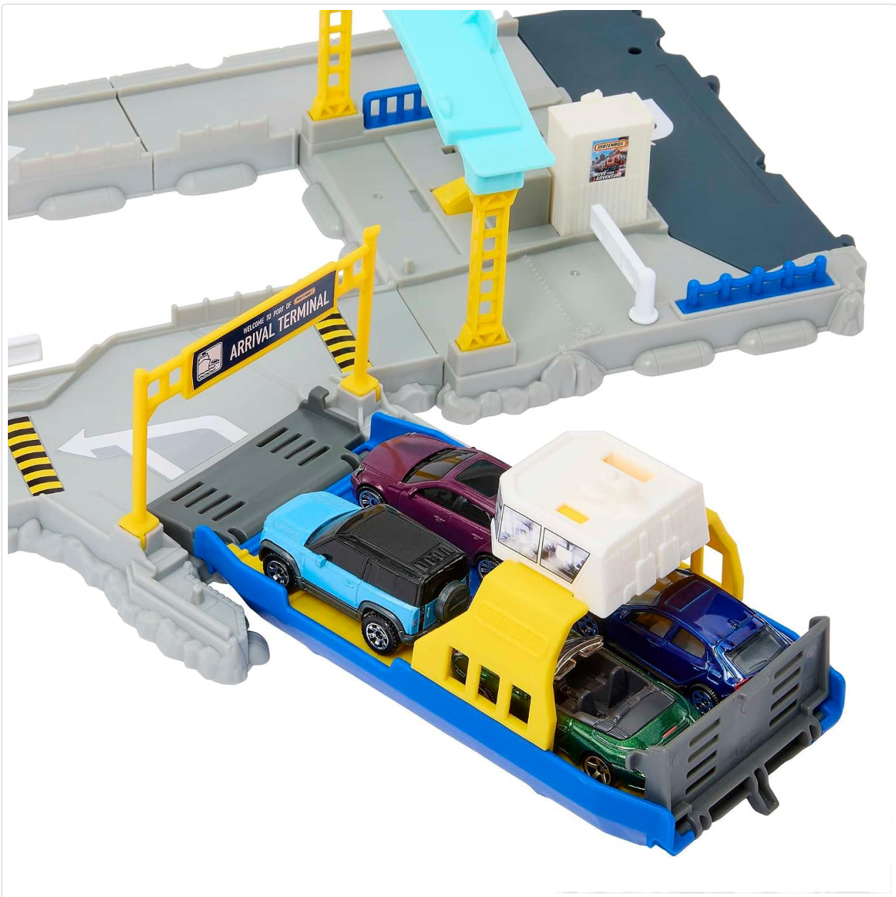
Figure 4.1: The ferry loaded with multiple Matchbox vehicles, ready for departure.