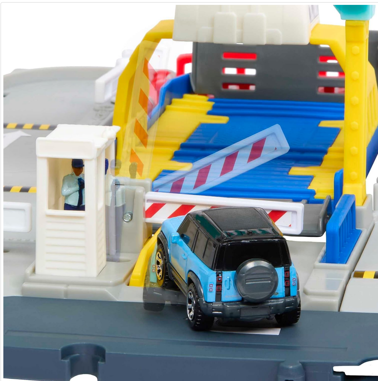
Figure 4.3: A Matchbox car approaching the port entrance, ready to interact with the playset's features.