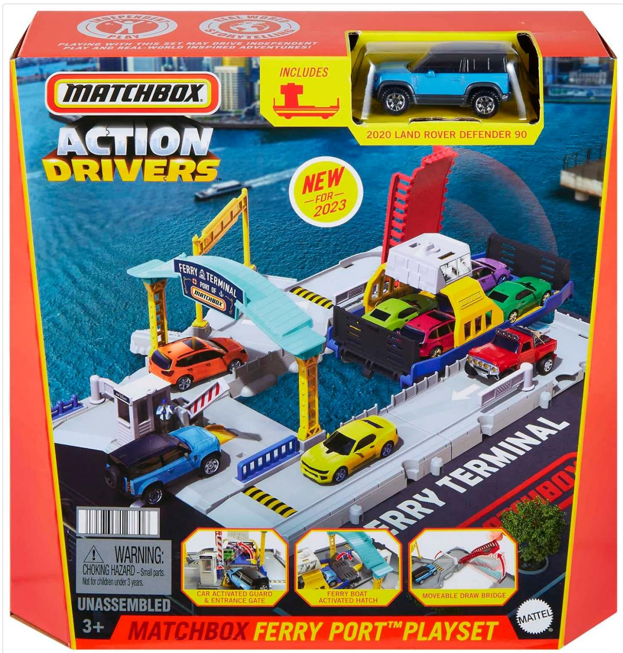
Figure 3.1: The product packaging, showing the playset and included Land Rover vehicle.