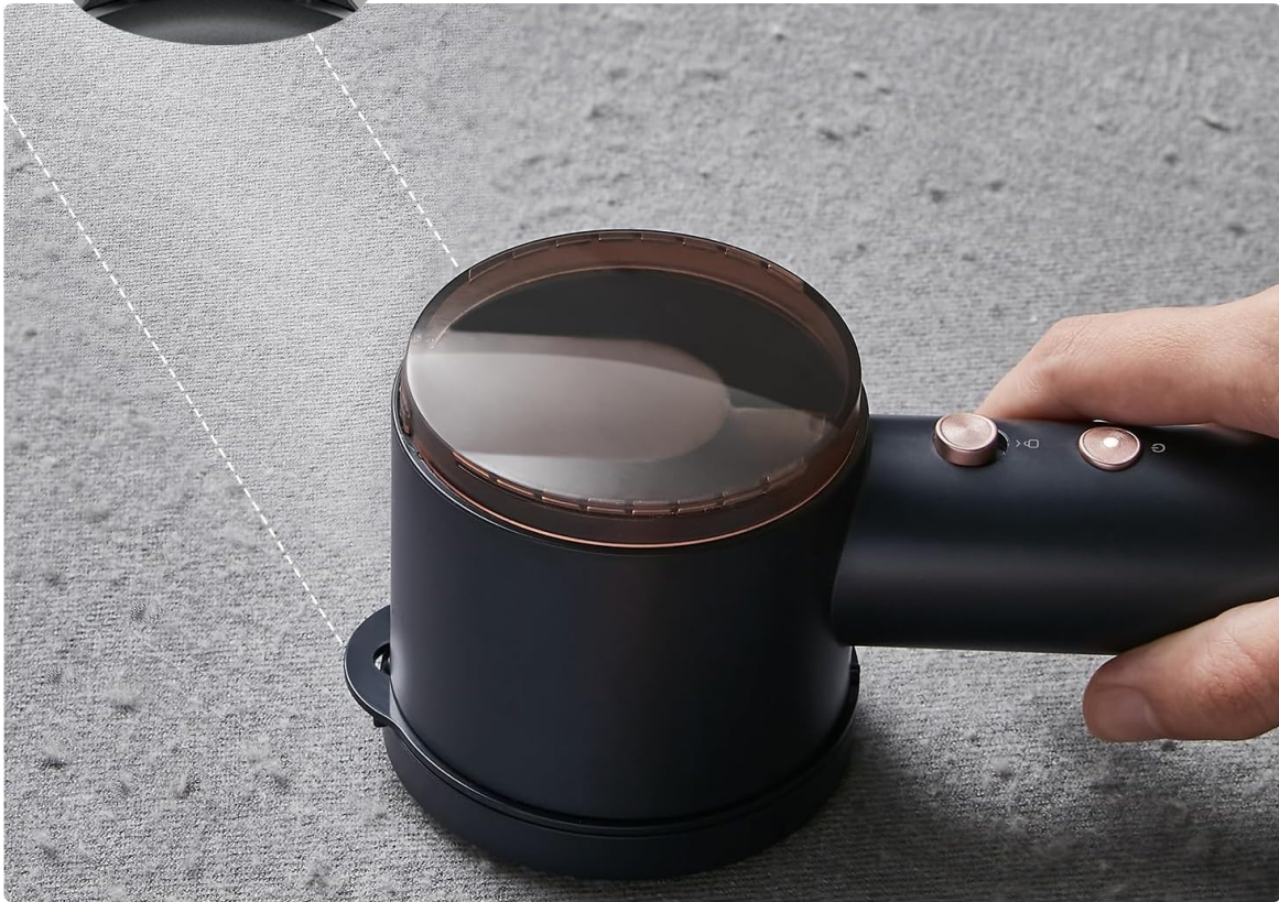
Image 5: A close-up view of the fabric shaver's head, highlighting the adjustable dial for setting the shaving height. Setting '0' is recommended for most clothing.