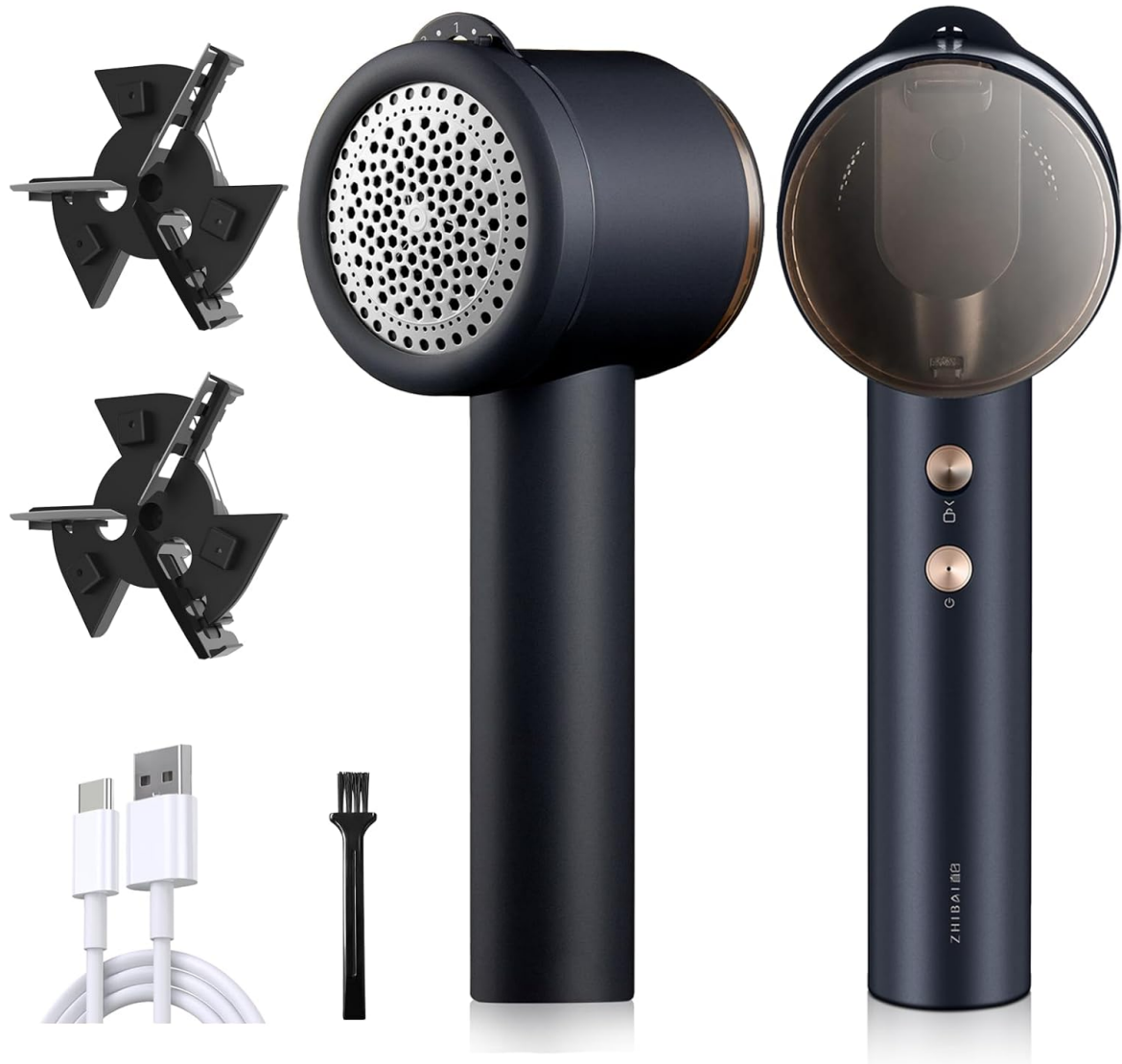
Image 1: The ZHIBAI Electric Fabric Shaver, including two replacement blade sets, a USB-C charging cable, and a cleaning brush.