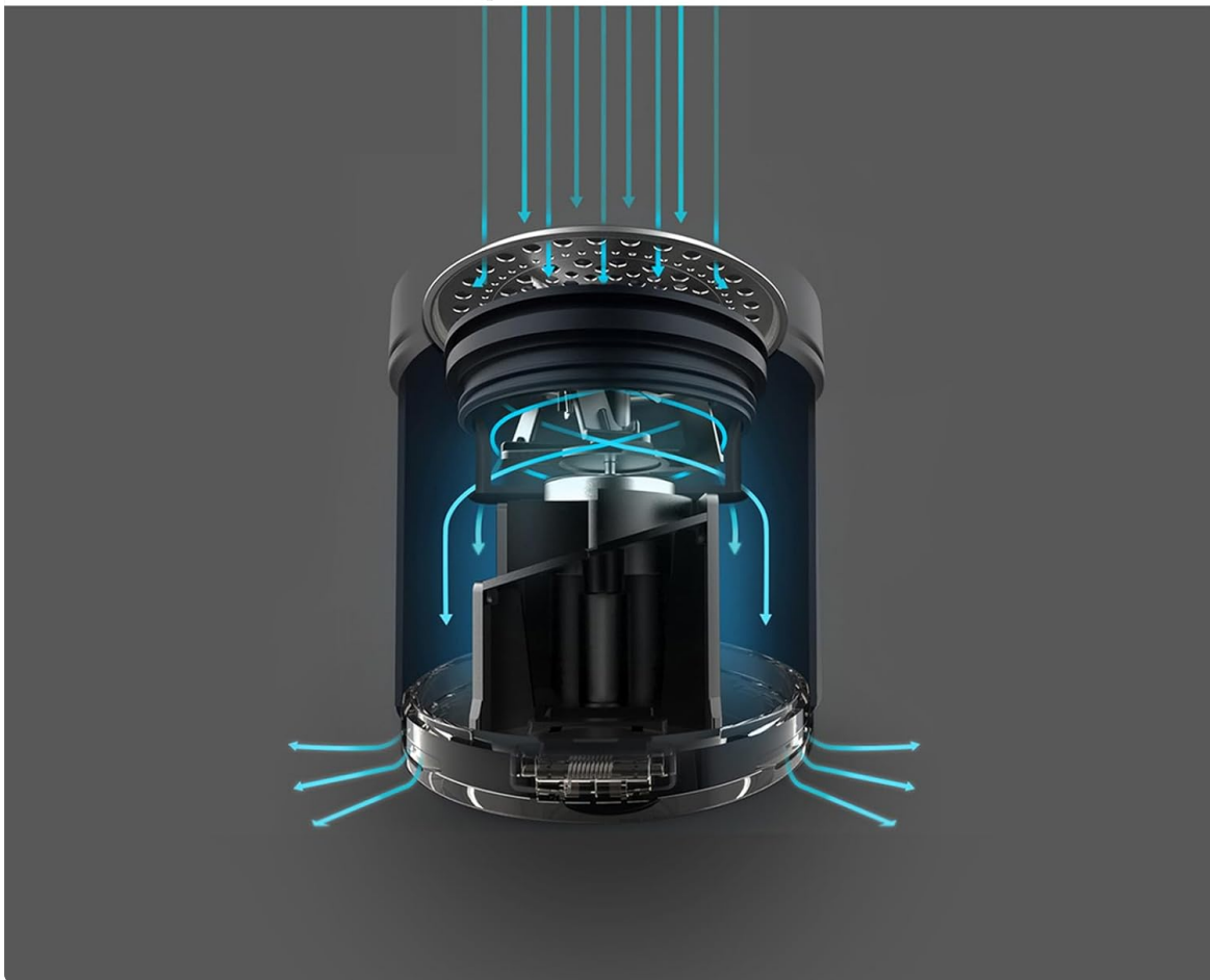
Image 2: An internal diagram illustrating the cyclone convection design, which helps remove lint from the blades instantly to maintain performance.

Remove lint from the blade instantly, No decline in performance.