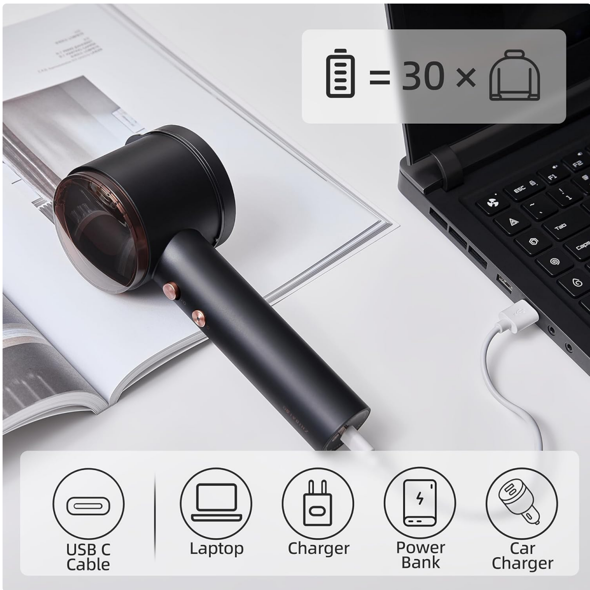
Image 3: The fabric shaver being charged via its USB-C cable, demonstrating compatibility with various power sources like laptops, power banks, and car chargers.