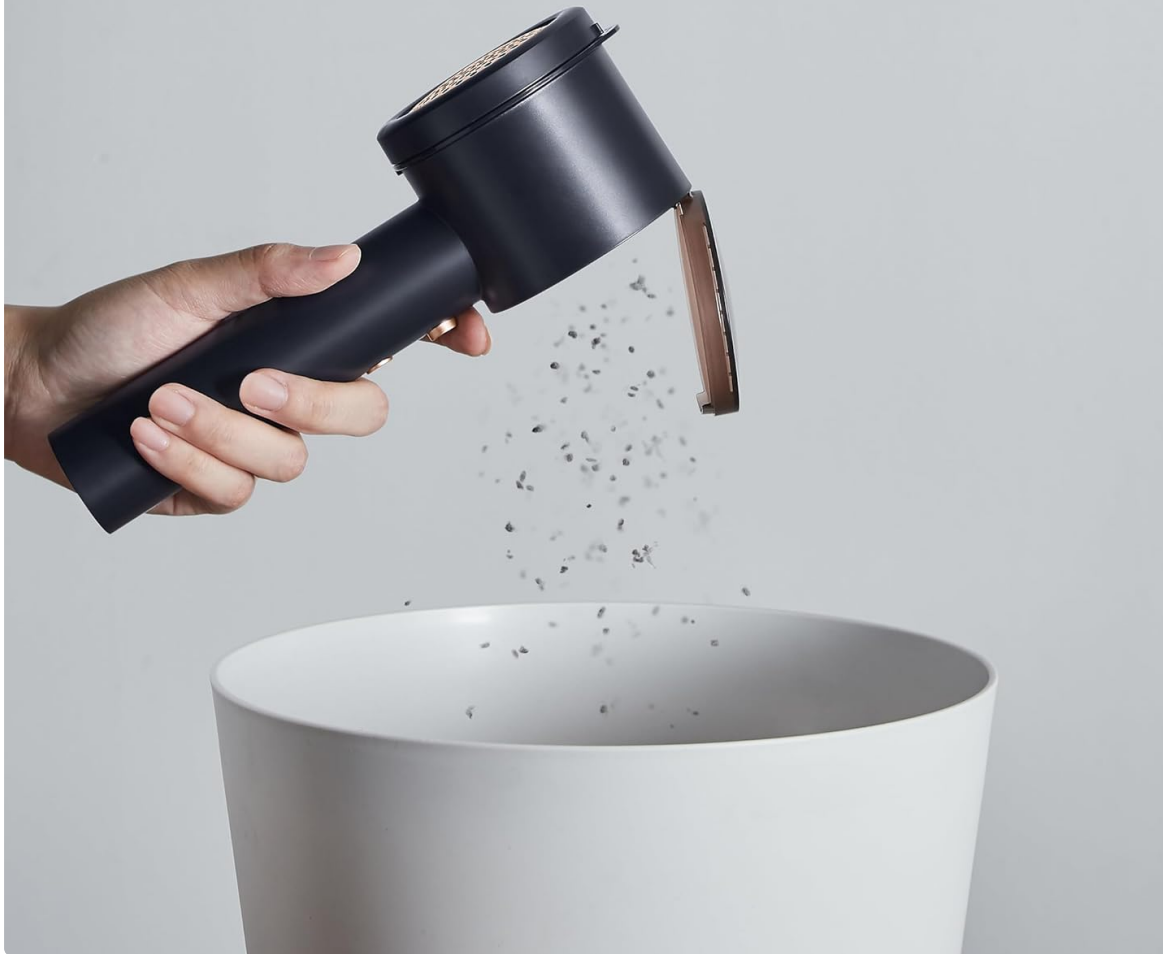
Image 6: A hand demonstrating the one-click cleaning feature, showing lint being emptied from the shaver's collection bin into a waste bin.

Only press the release button to clean the lint bin