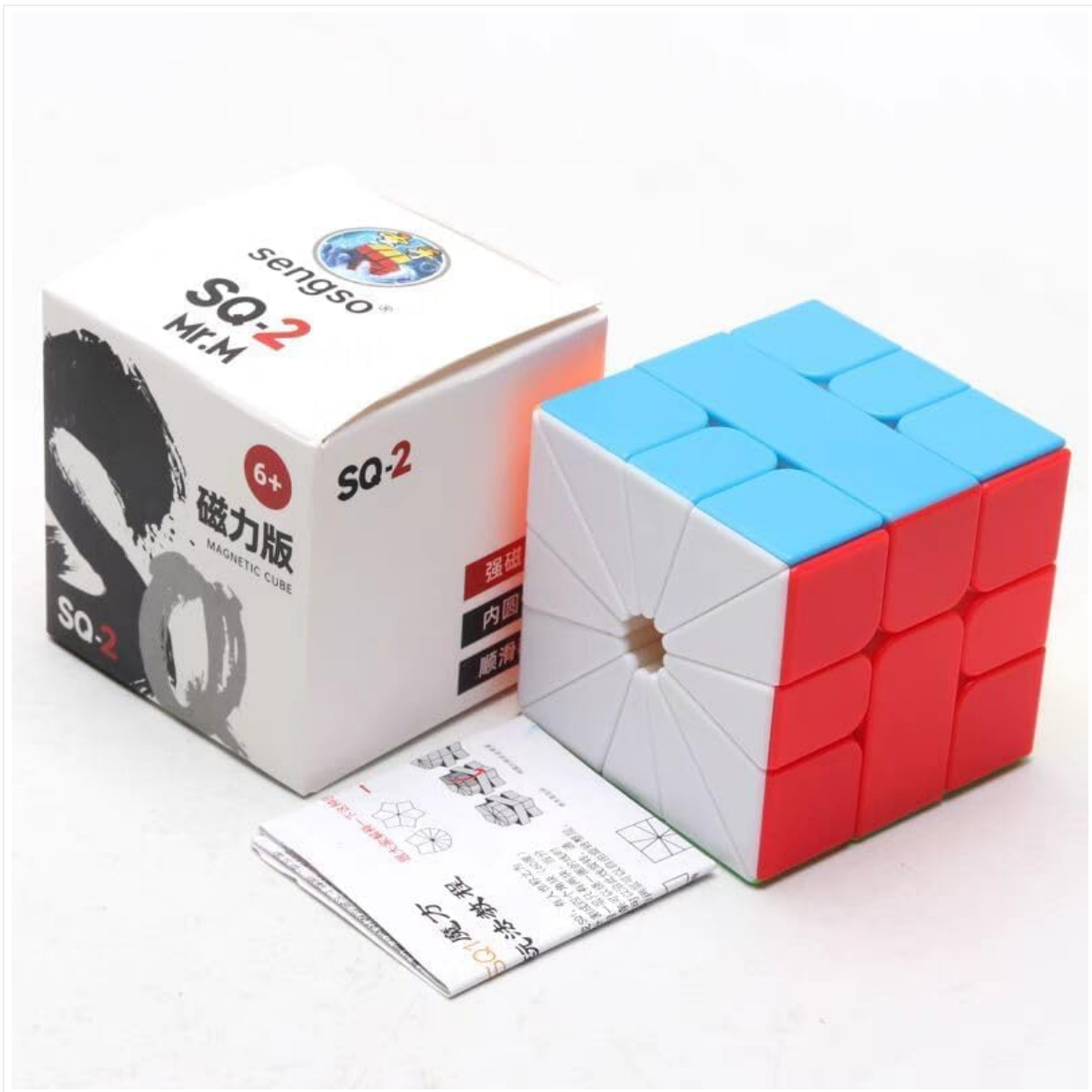
Image: The ShengShou Mr. M Square-2 puzzle cube shown with its original packaging, indicating it is ready for use.