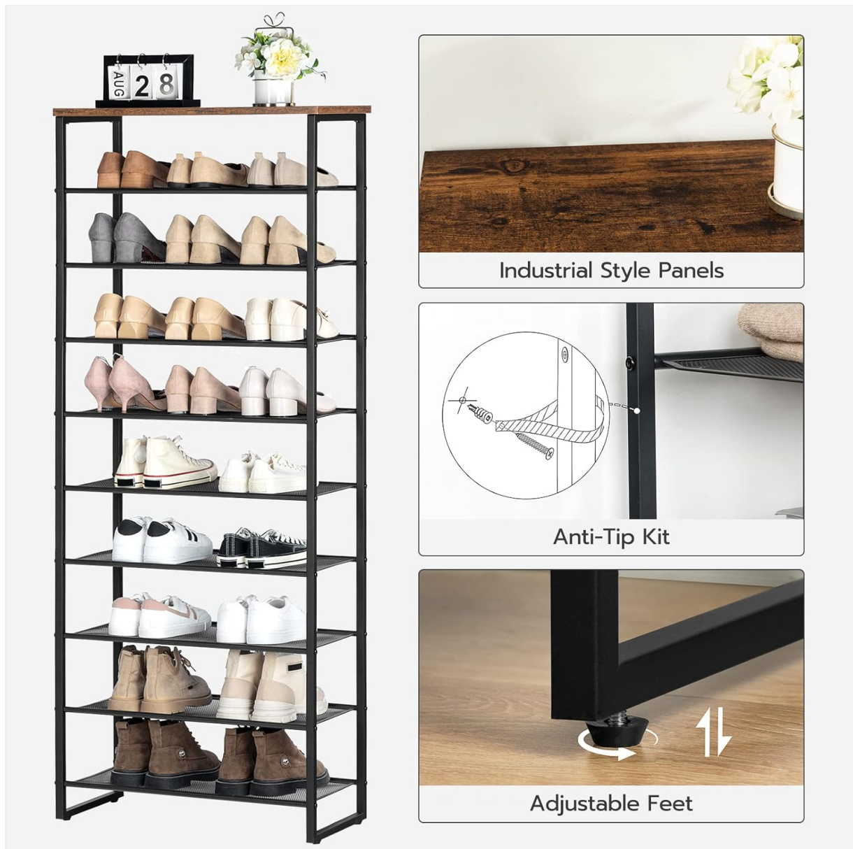
Image: Visual guide for the industrial style top panel, anti-tip kit, and adjustable feet installation.