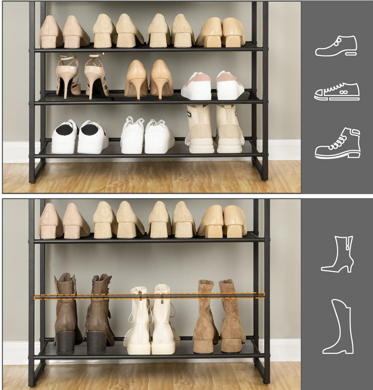
Image: Illustration demonstrating how to adjust shelf height for flat shoes and boots.

The HOOBRO 10-Tier Shoe Rack offers flexible storage options. To accommodate taller footwear such as boots or high heels, simply remove one or more mesh shelves. This allows for customized spacing to fit various shoe heights without compromising the unit's stability.