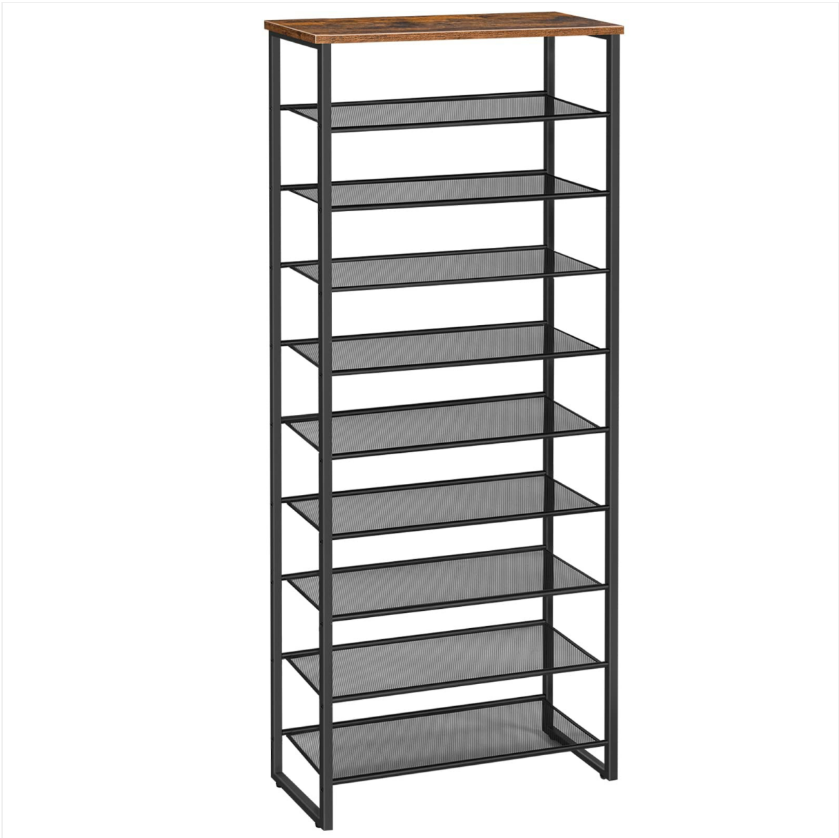
Image: The HOOBRO 10-Tier Shoe Rack, Model BF601XJ01, showcasing its design and capacity in a home setting.