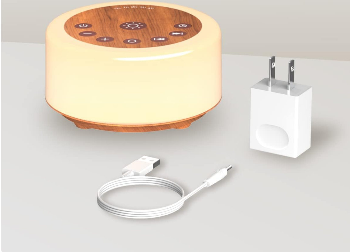
Image: The sound machine illustrating its 5 timer function options.