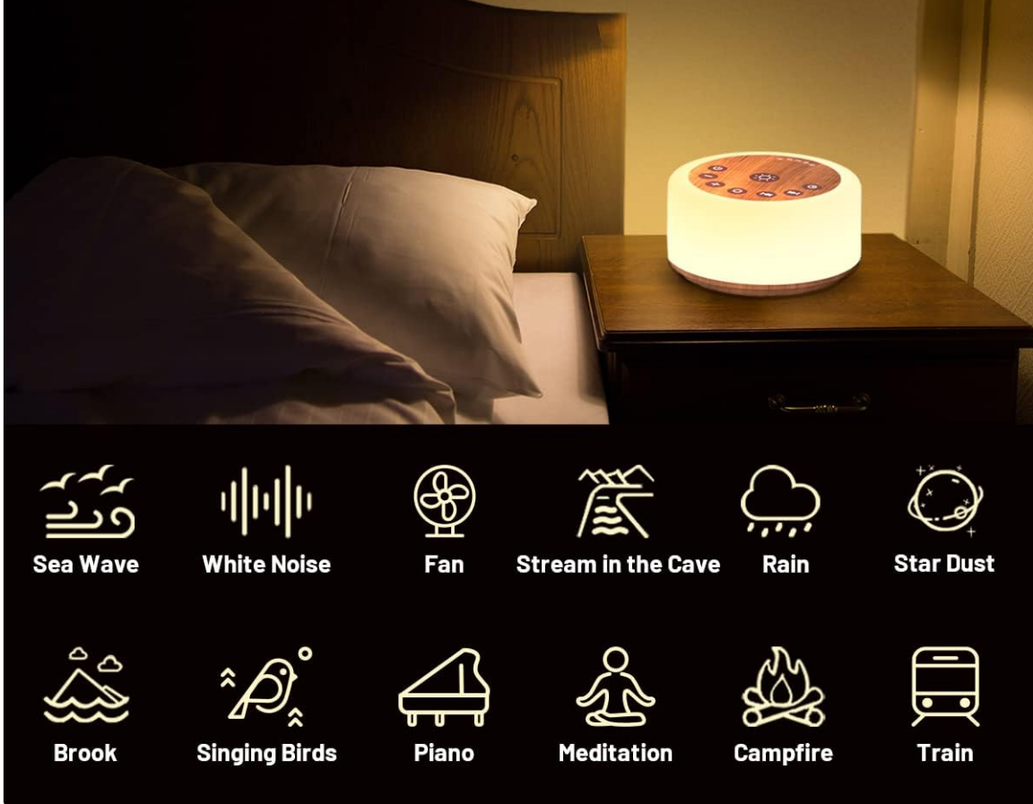
Image: Visual representation of the 30 soothing sounds available on the device.