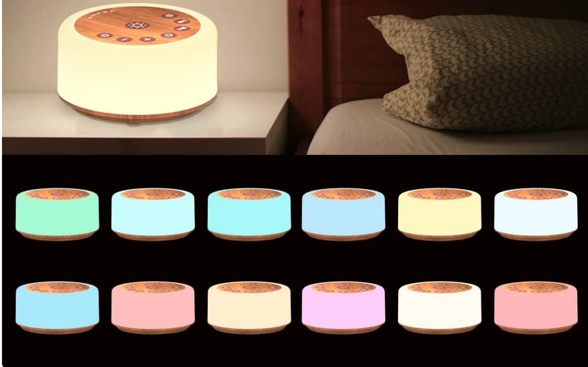
Image: The sound machine showcasing its 12 available night light colors.