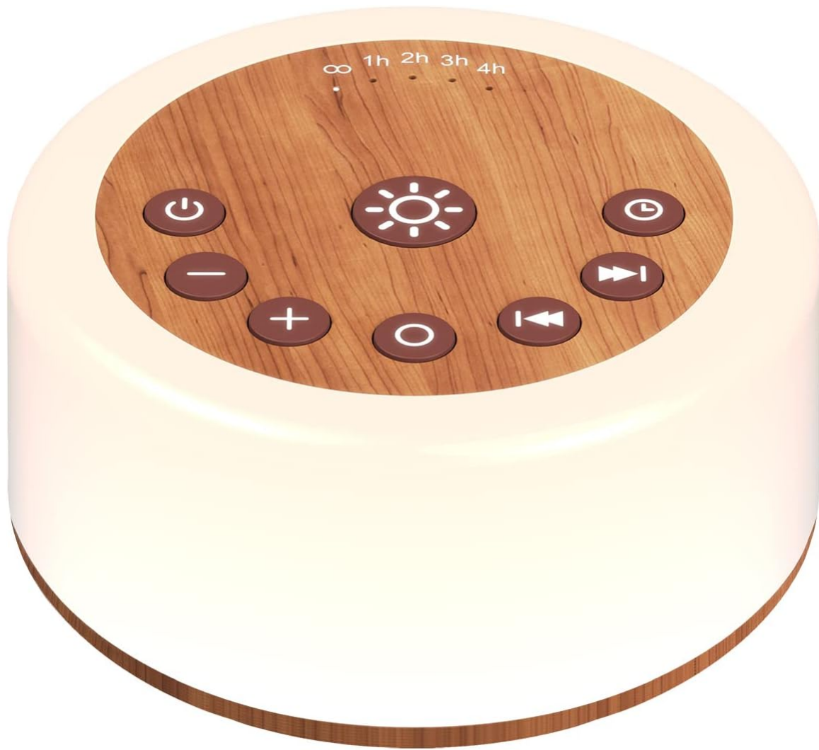
Image: Top view of the ColourNoise Sound Machine showing its control panel.