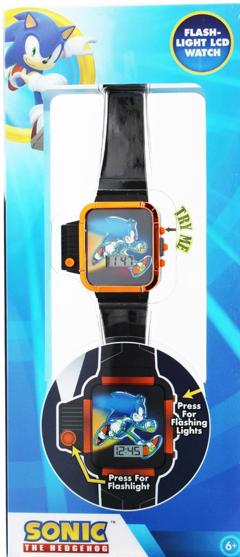
Image Description: The Accutime Kids Sonic The Hedgehog digital watch displayed in its retail packaging. The packaging highlights features like 'Flash-Light LCD Watch' and clearly indicates the button to 'Press for Flashlight' and 'Press for Flashing Lights'.

To activate the integrated flashlight, press and hold the dedicated flashlight button, typically located on the left side of the watch case. Release the button to turn off the flashlight.