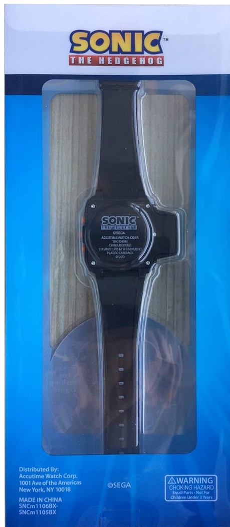
Image Description: The back view of the Accutime Kids Sonic The Hedgehog digital watch as seen through its retail packaging. The back of the watch case displays regulatory information and the model number.