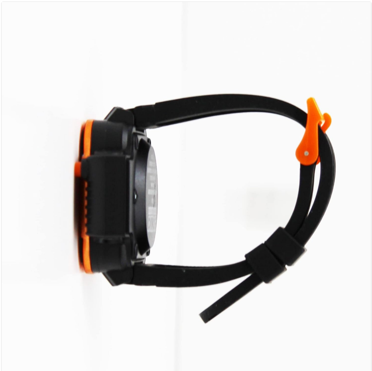
Image Description: A side view of the Accutime Kids Sonic The Hedgehog digital watch, highlighting the watch's profile and the black strap with an orange buckle.