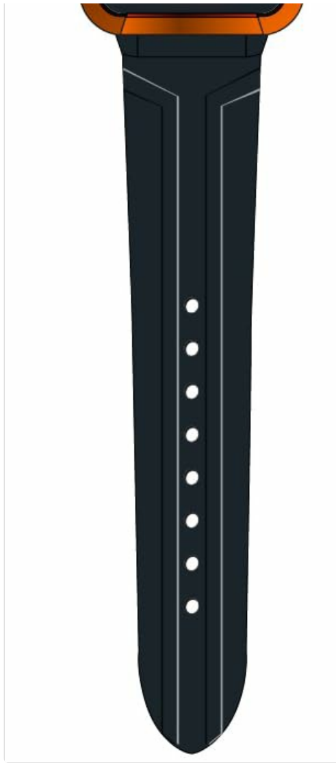
Image Description: A full view of the Accutime Kids Sonic The Hedgehog digital watch. The watch features a black strap and an orange bezel around the digital display, which shows Sonic the Hedgehog and the time 12:45. A small orange button on the left side activates the flashlight.