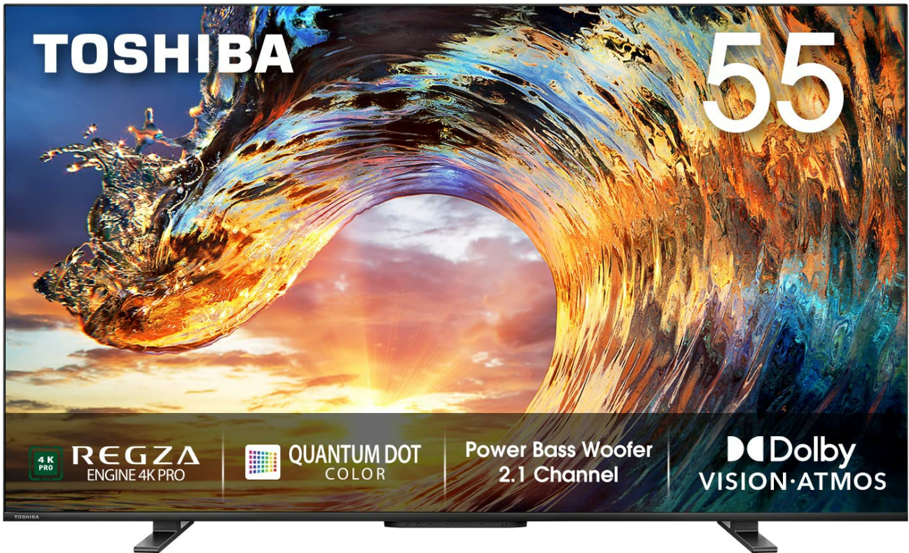
Front view of the Toshiba 55M550LP 4K QLED Google TV, showcasing its slim bezel design.