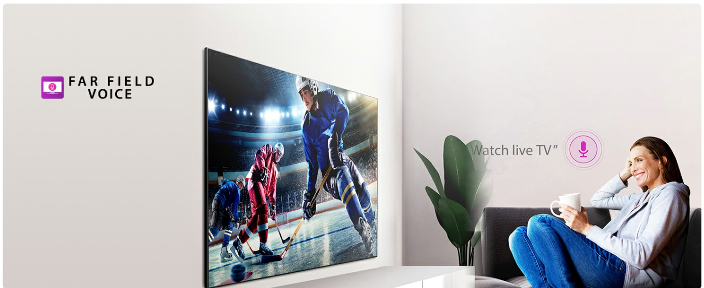
A user interacting with the TV using the 'Hey Google' voice command feature.