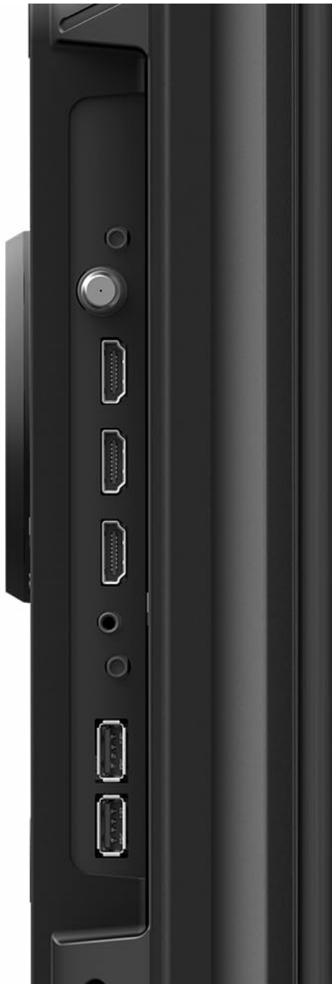
A close-up view of the TV's side ports, including HDMI and USB connections.

The TV supports various connectivity options: