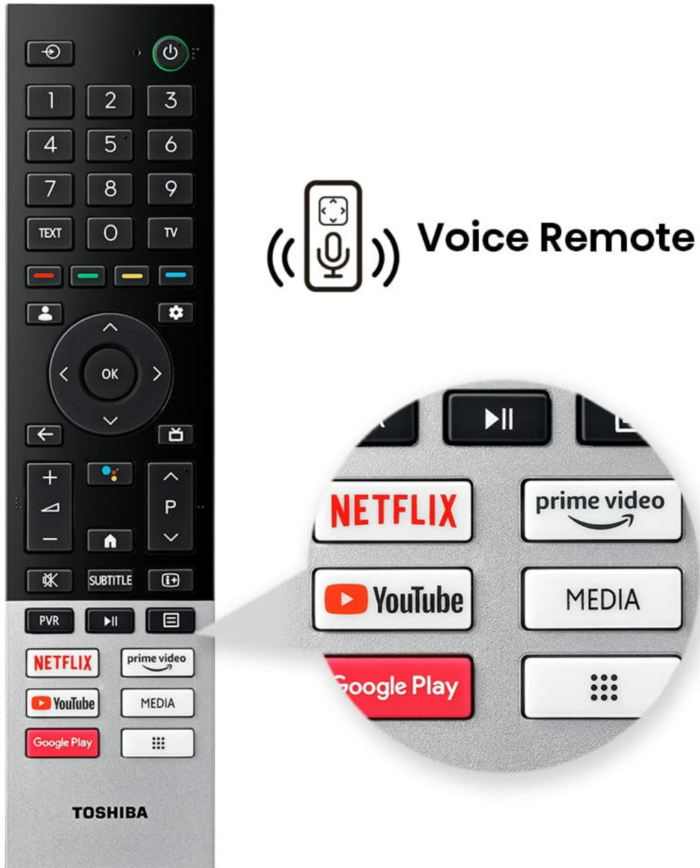
The TV remote control, highlighting dedicated buttons for popular streaming services and the voice assistant feature.