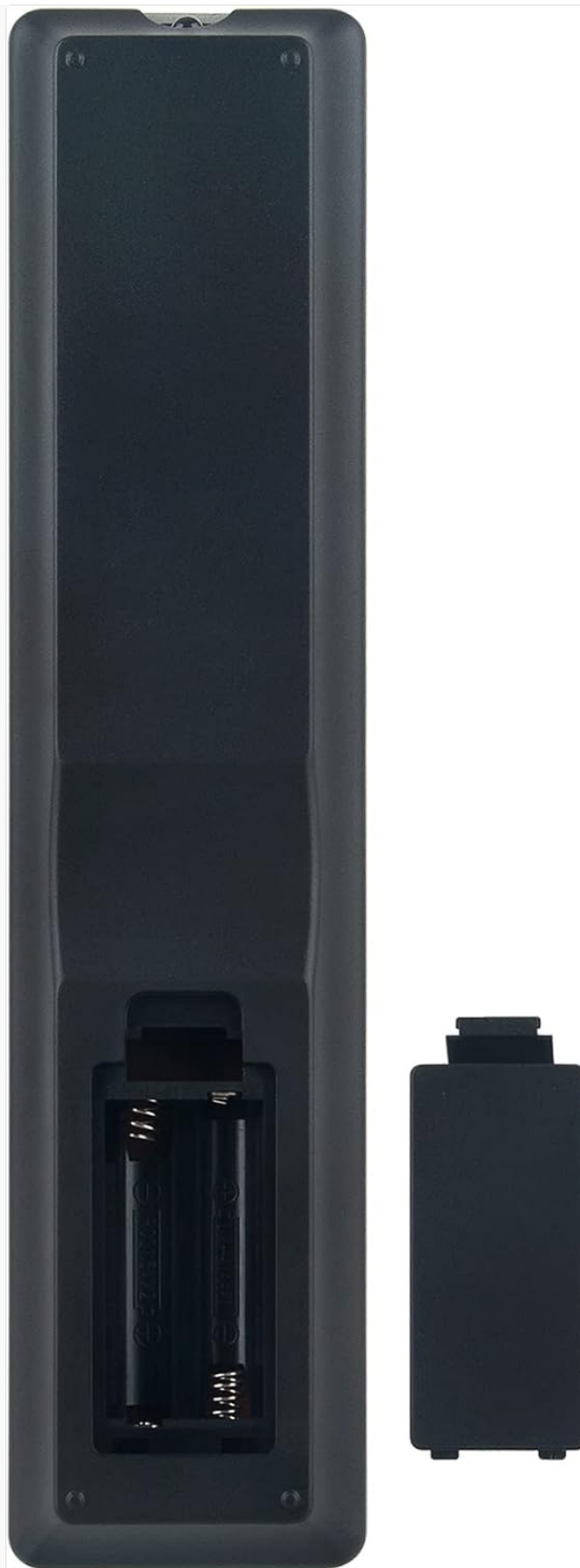
Figure 1: Battery compartment on the back of the remote control.