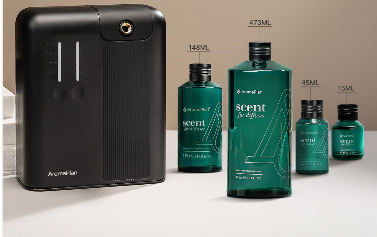
Figure 7: Use only AromaPlan fragrance oils for optimal performance.

We offer various sizes to perfectly match your diffuser