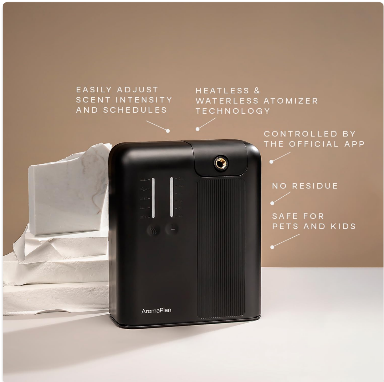
Figure 2: Overview of the diffuser's core features.