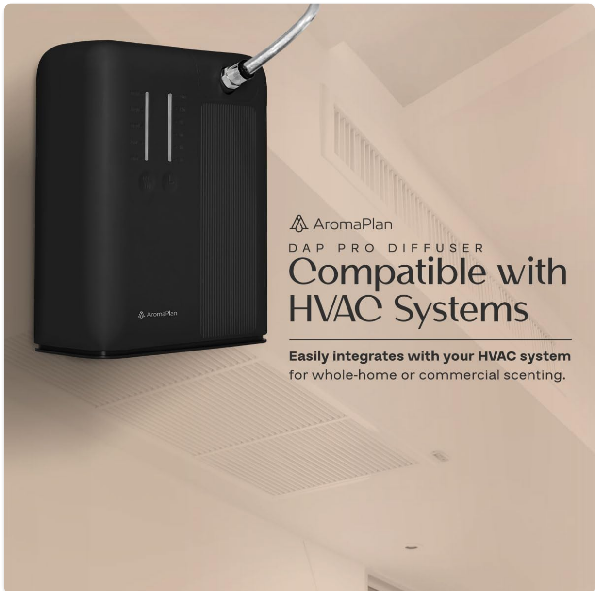
Figure 4: Diffuser integrated with an HVAC system for wide coverage.