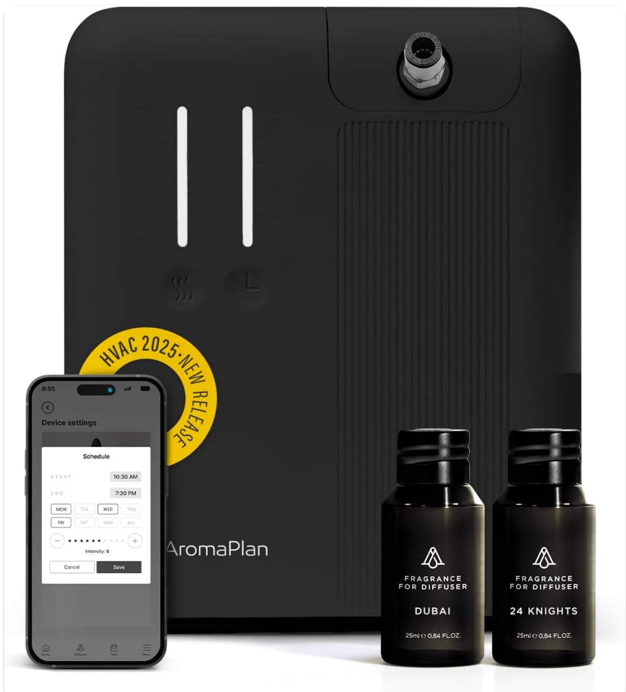
Figure 1: The AromaPlan DAP PRO 2025 Scent Diffuser with included fragrances and app interface.