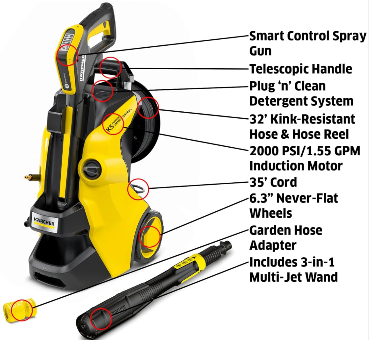
Figure 2.1: Detailed diagram highlighting key features such as the Smart Control Spray Gun, telescopic handle, Plug 'n' Clean system, and hose reel.