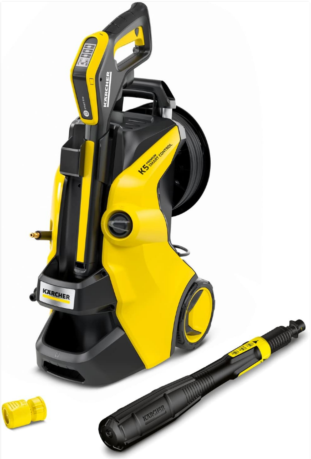
Figure 1.1: Kärcher K5 Premium Smart Control Pressure Washer, showcasing its compact design and included spray wand.