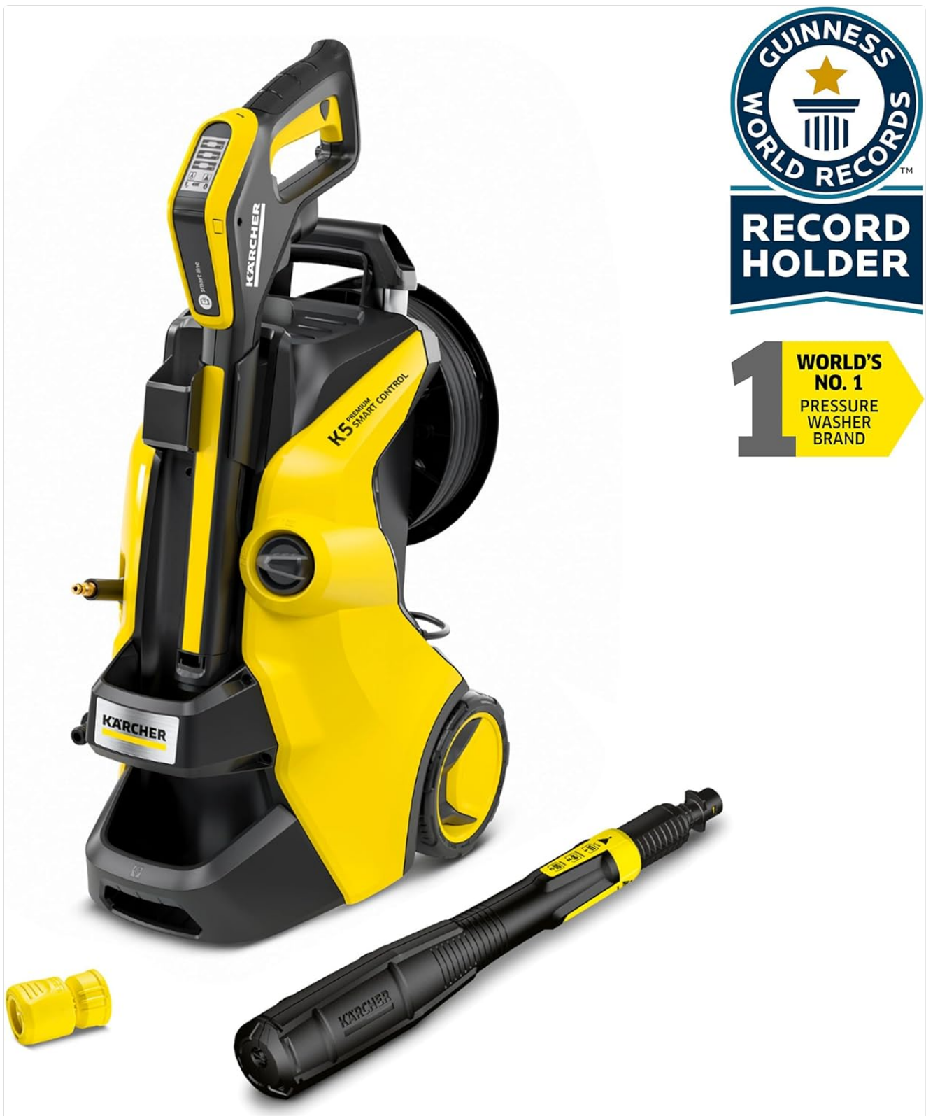
Figure 3.1: The pressure washer comes with essential accessories for various cleaning tasks.