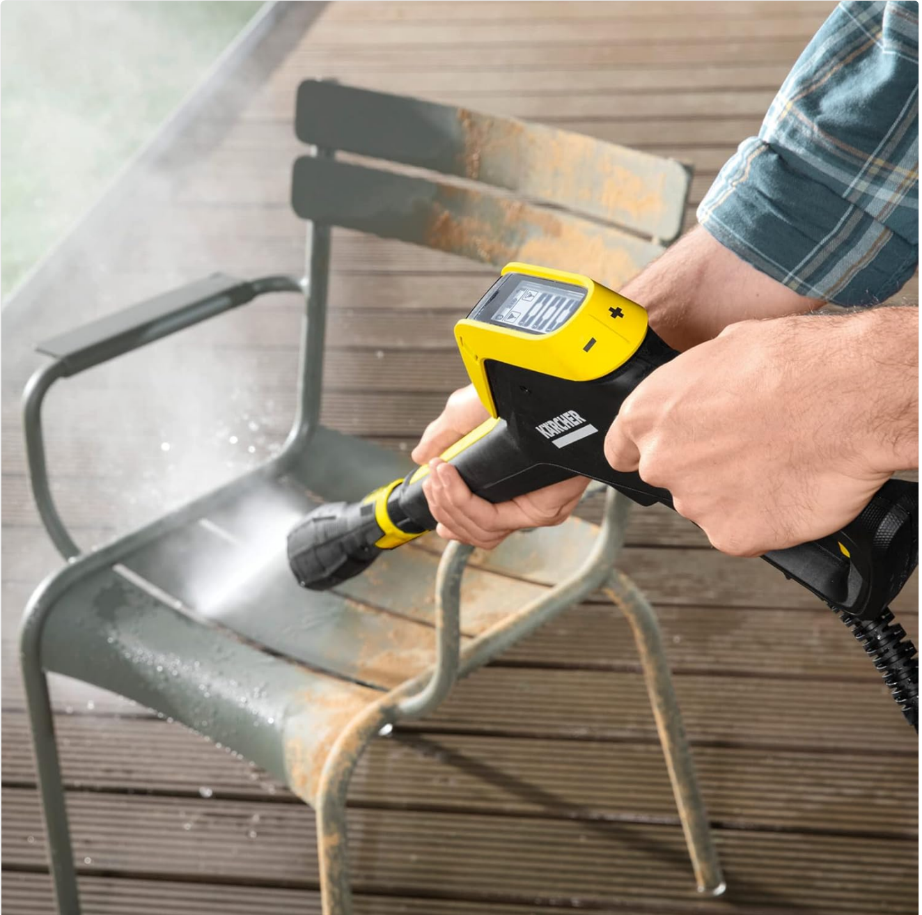
Figure 4.1: The pressure washer is effective for cleaning various outdoor furniture and surfaces.