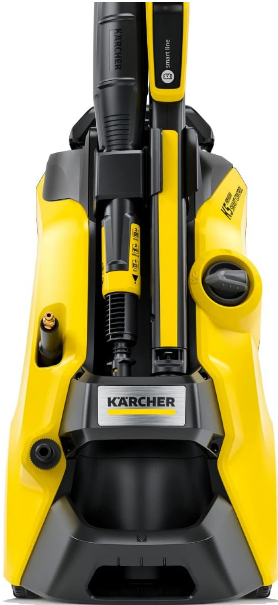
Figure 2.3: The Plug 'n' Clean system allows for quick and easy detergent application.