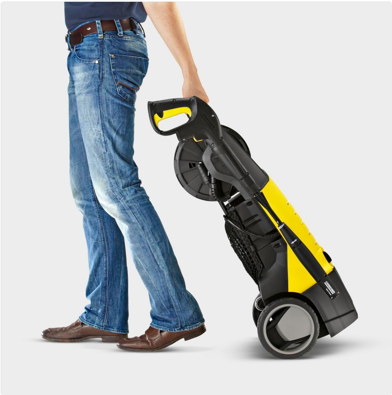
Figure 5.2: The unit is designed for convenient and space-saving storage of all components.