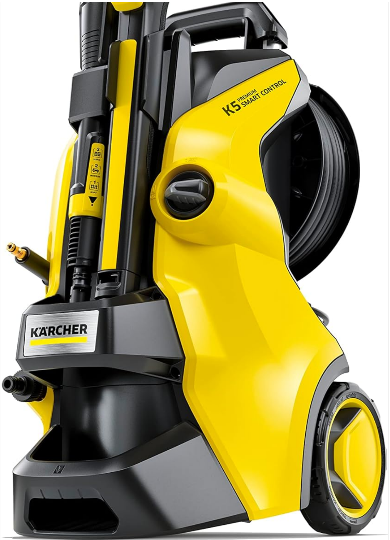
Figure 2.2: The Kärcher Home & Garden app provides guidance and control for optimal cleaning results.