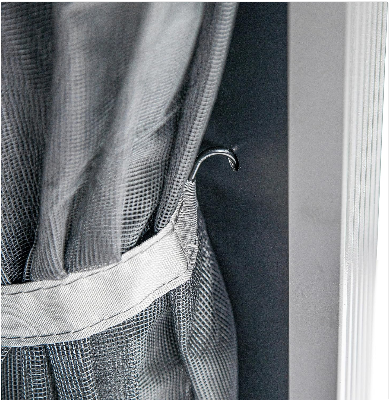
Image 4.2: Close-up of the hook mechanism for securing the mosquito netting, demonstrating the ease of use for pest prevention.