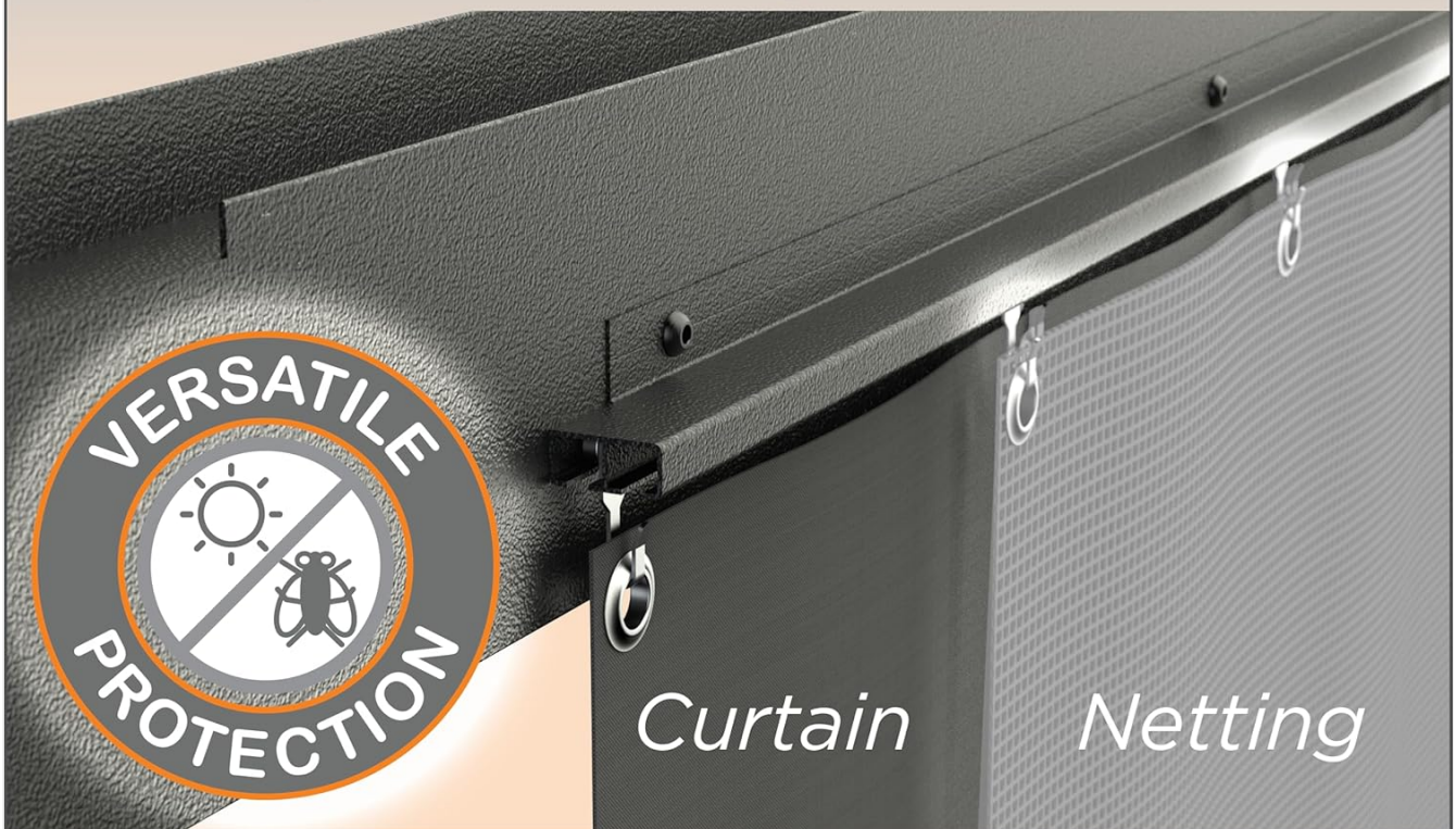
Image 5.1: Visual representation of the rustproof aluminum frame, highlighting its ability to provide maximum protection from the elements due to its durable coating.

allows for simultaneous use of mosquito netting and curtains