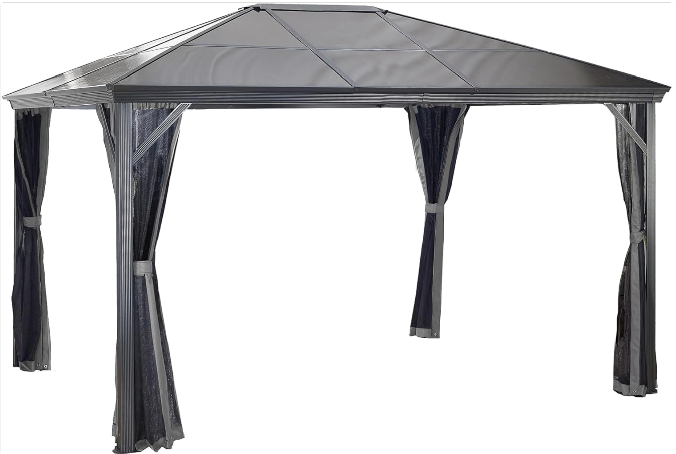
Image 1.1: The Sojag Verona 10 Ft. X 14 Ft. Gazebo, a durable outdoor structure designed for year-round use.

This manual provides detailed instructions for the assembly, operation, maintenance, and troubleshooting of your Sojag Verona 10 Ft. X 14 Ft. Gazebo. Please read this manual thoroughly before beginning assembly or use to ensure proper installation and safe operation. Keep this manual for future reference.