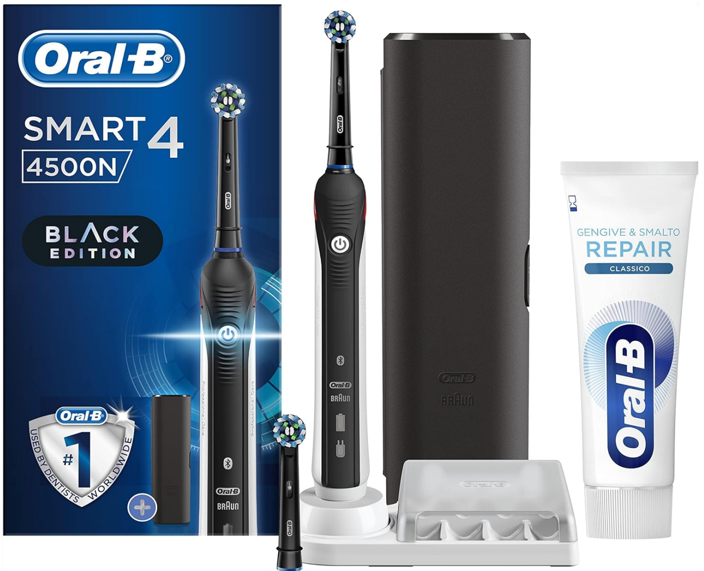
Figure 2: Components of the Oral-B Smart 4 4500, showing the handle, brush heads, charger, and travel case.