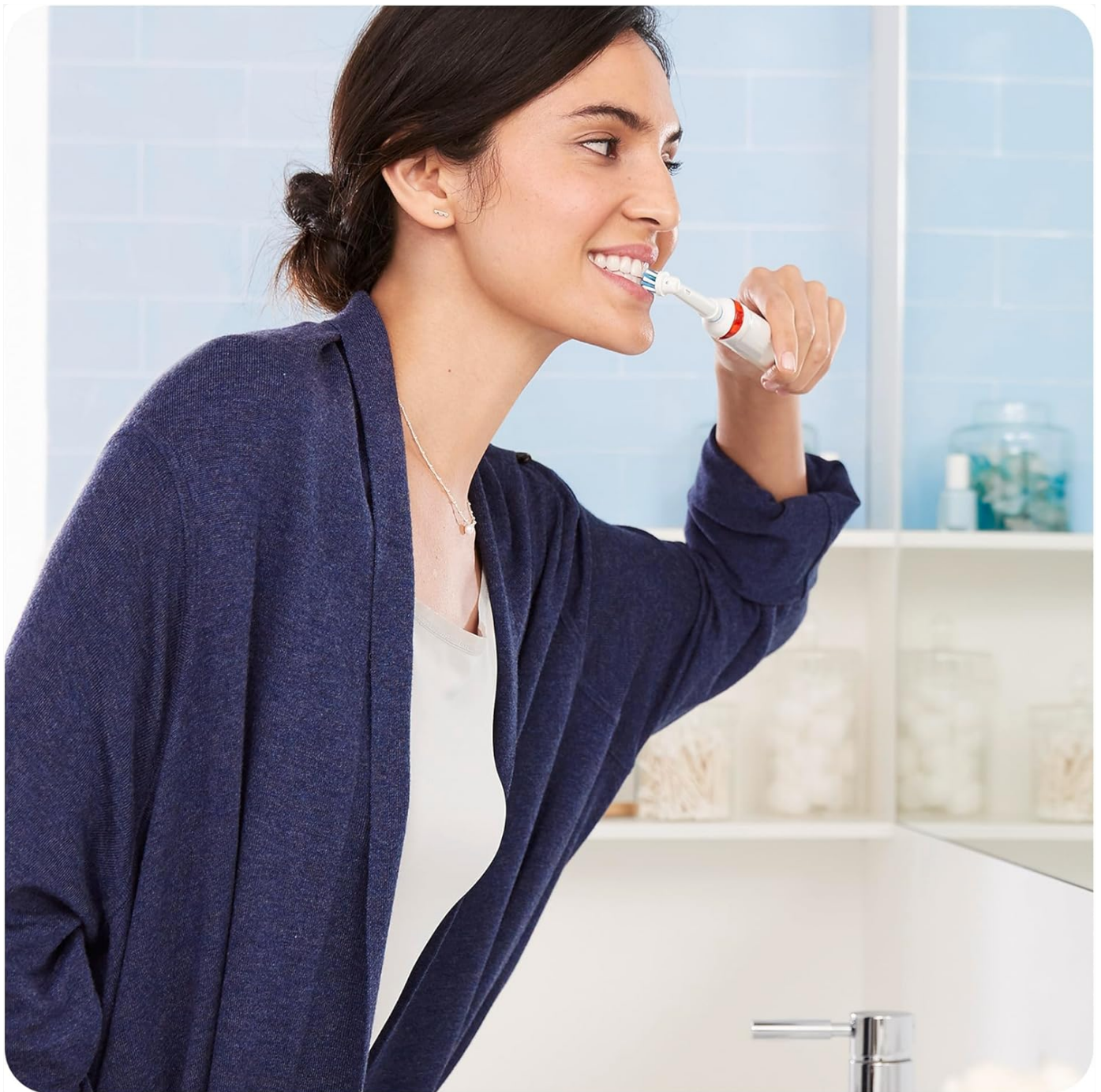
Figure 3: The Bluetooth symbol on the toothbrush handle, indicating connectivity for smart features.