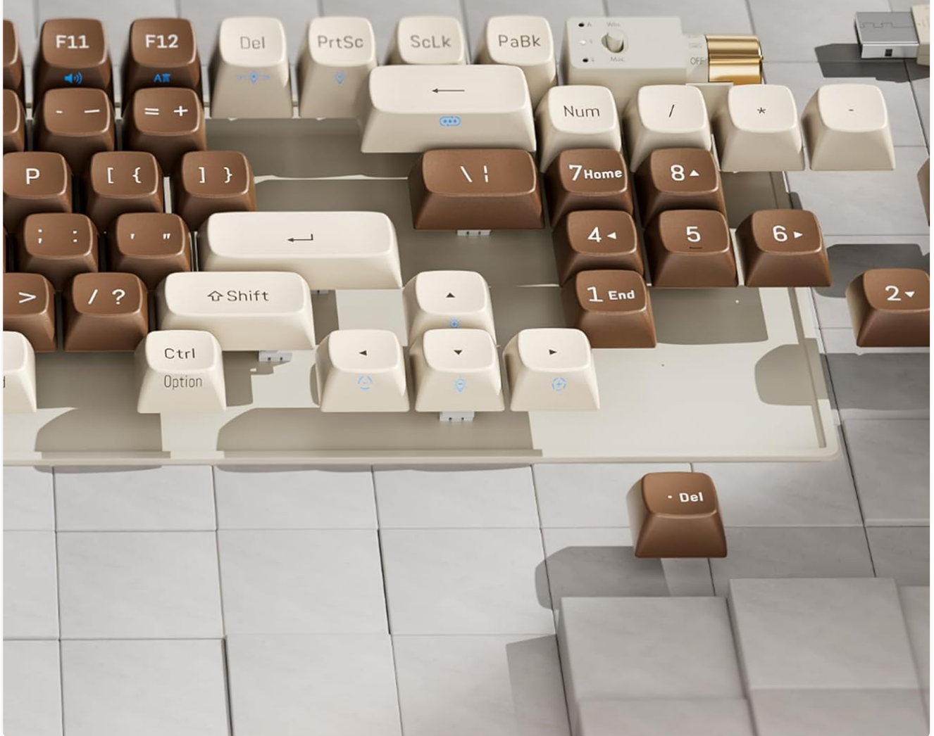
Image: A close-up view of the PBT double-shot keycaps, highlighting their oil-resistant and wear-resistant properties.