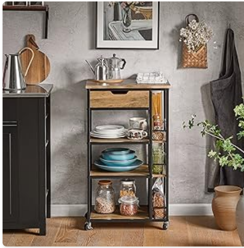
Image 4.2: View of the main shelves and the integrated mesh side shelves, designed for various kitchen items.