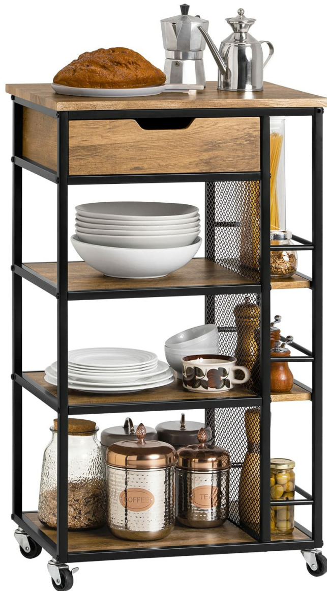
Image 1.1: Front view of the assembled SoBuy FKW99-N Kitchen Trolley Cart, showcasing its industrial vintage design with a wooden top, drawer, and multiple shelves.