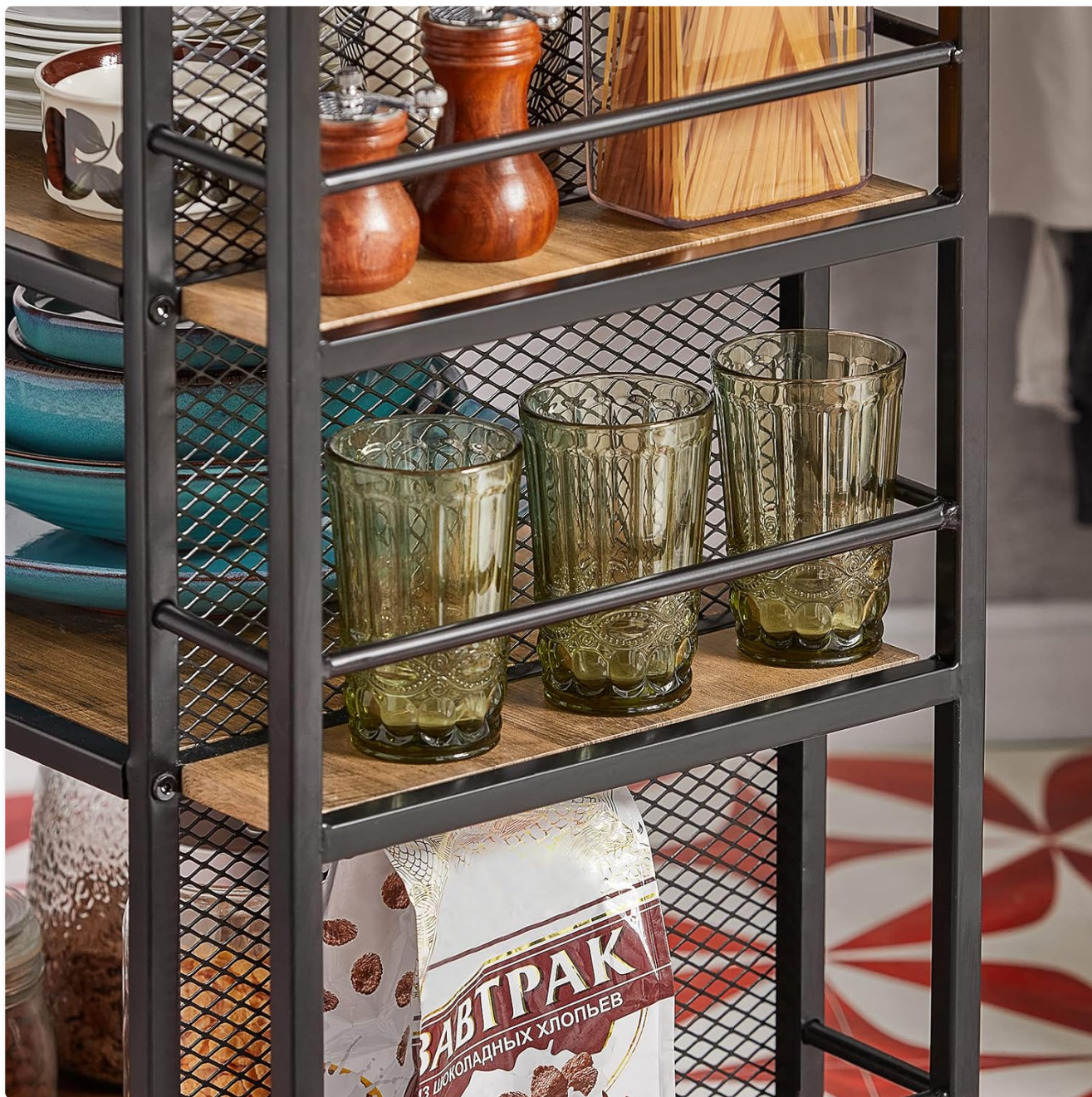
Image 5.1: The convenient side shelves are ideal for storing bottles, glasses, or other frequently used items.

The trolley features a top surface, a drawer, three main shelves, and three side shelves. Organize items according to their size and weight, placing heavier items on lower shelves for stability.