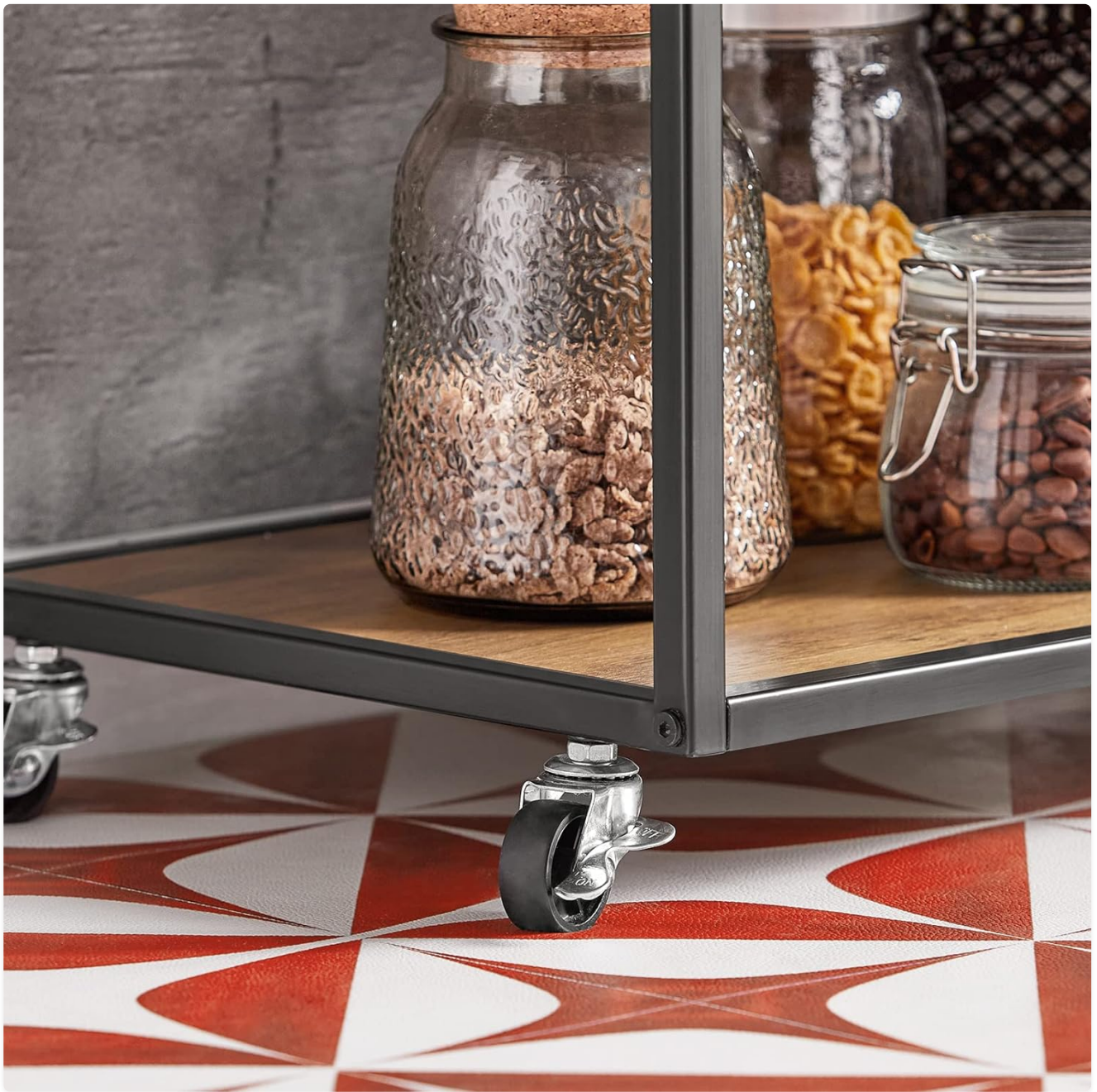
Image 4.1: Detail of a caster wheel, showing the locking mechanism. Ensure these are securely attached to the base.