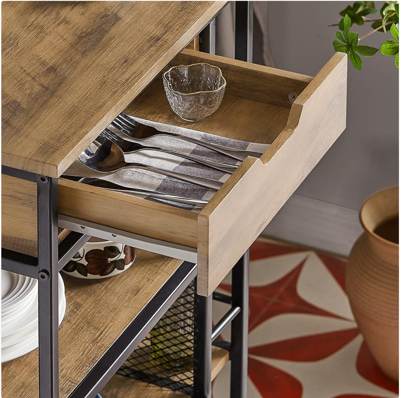
Image 4.3: The top drawer, suitable for storing cutlery or small utensils.