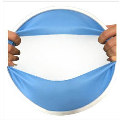
Figure 4: Expanding the silicone opening.