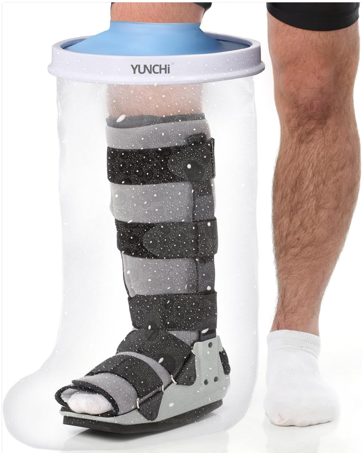
Figure 1: YUNCHI Waterproof Extra Wide Leg Cast Cover in use.