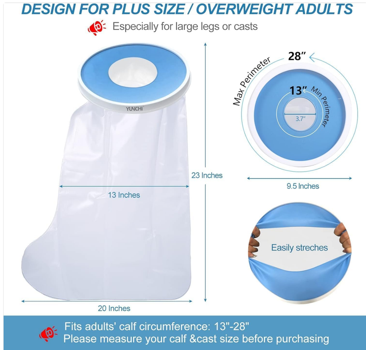
Figure 2: Product dimensions for the XL-Extra Wide Leg Cast Cover.

This XL-Extra Wide model features a widened hard ring diameter of 9.5 inches and a center hole diameter of 3.7 inches. It fits calf circumferences from 13 to 28 inches. The overall length of the cover is 23 inches.