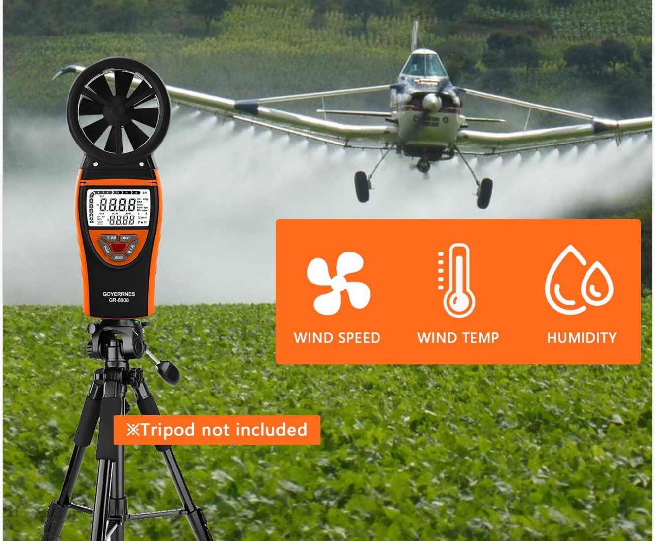
Image 1.1: The GR-8808 Anemometer displaying its 3-in-1 measurement capabilities for wind speed, temperature, and humidity.

You can get environmental conditions in seconds in the palm of your hand including Wind Speed, Temperature, Humidity,