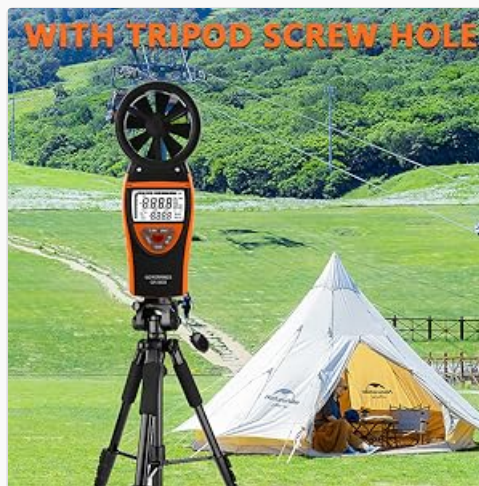
Image 3.2: The anemometer can be mounted on a tripod for stable measurements.

The GR-8808 features a standard metal threaded hole at the bottom, allowing it to be mounted on a tripod (not included) for stable, continuous measurements. This is particularly useful for applications requiring hands-free operation, such as drone flying or long-term monitoring.