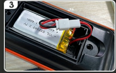
Image 3.1: Steps for connecting the internal battery before first use.