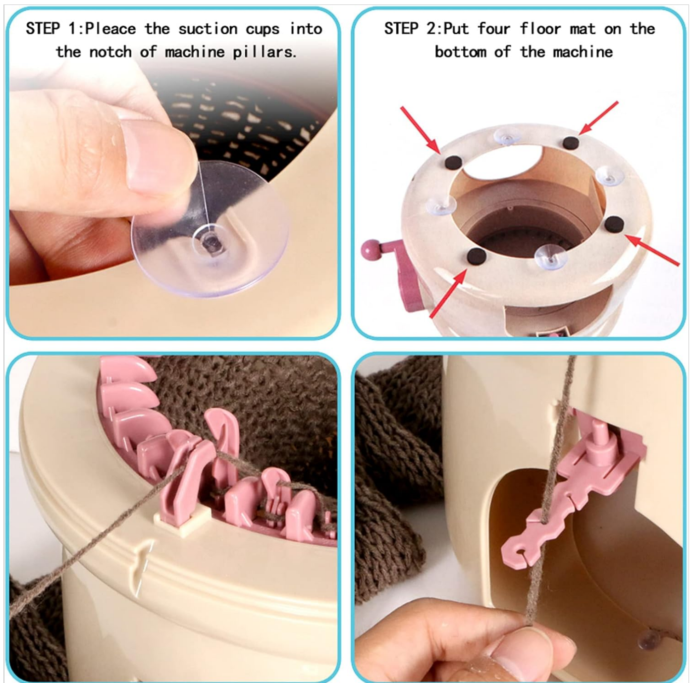
Image: Visual guide for installing the suction cups and anti-slip mats on the machine's base.