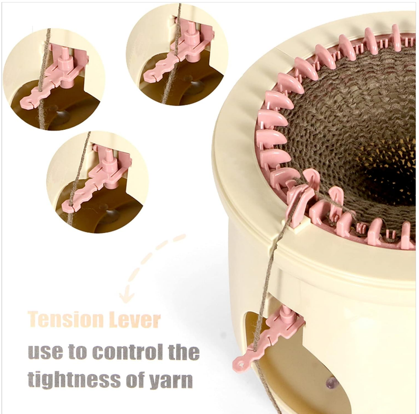
Image: Detailed view of the tension lever, showing how it guides the yarn.