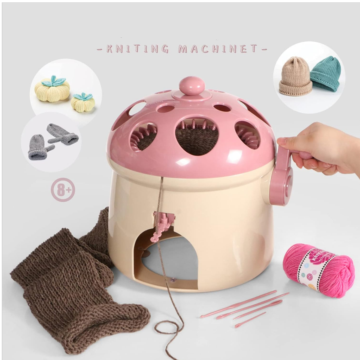
Image: The SENTRO 32-Needle Knitting Machine, demonstrating its capability to produce knitted hats and mittens.