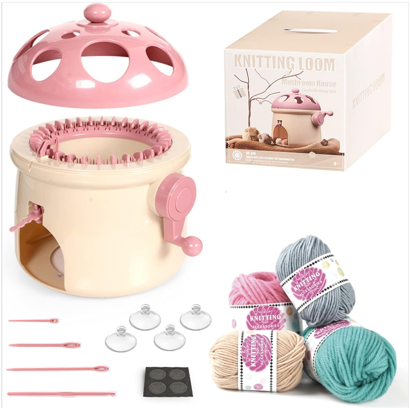
Image: Overview of the SENTRO 32-Needle Knitting Machine and its included accessories.