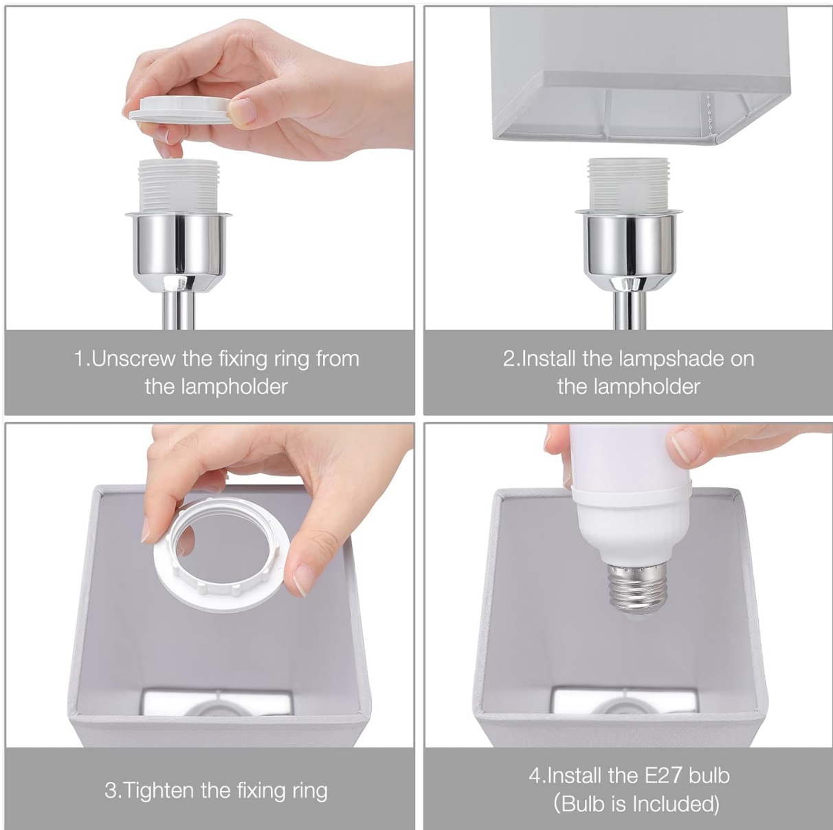
Image: Step-by-step assembly guide for the lamp.