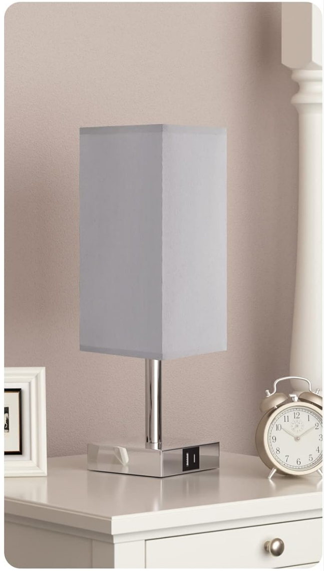
Image: Visual representation of the three brightness levels.