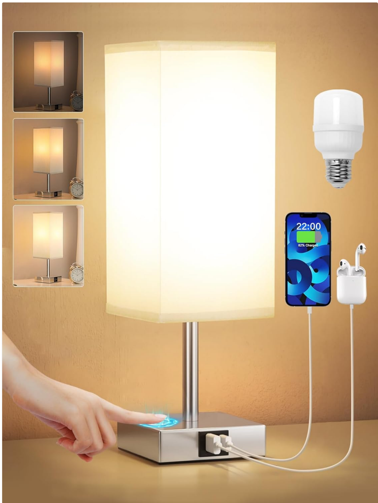
Image: Kakanuo Touch Control Bedside Lamp in use, highlighting its touch control and charging capabilities.