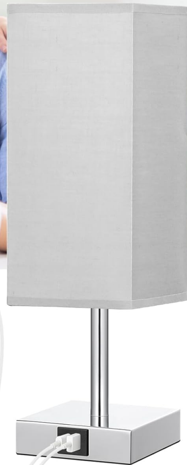
Image: The lamp's USB-A and USB-C charging ports in use.