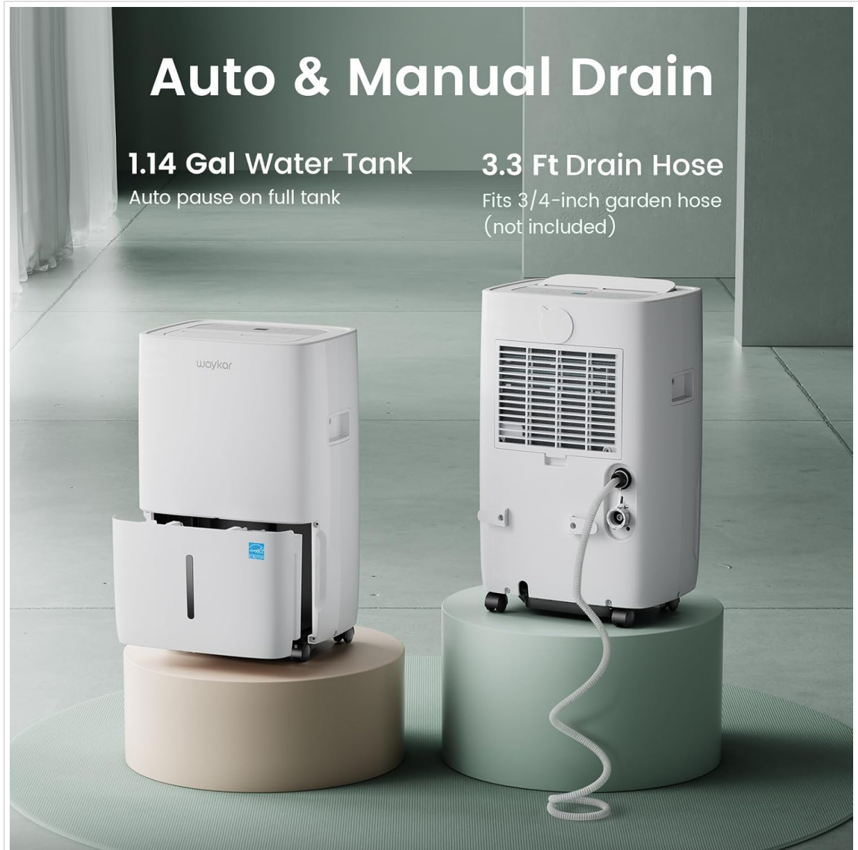
Image: The Waykar Dehumidifier illustrating its dual drainage capabilities: the removable water tank for manual emptying and the rear connection for a continuous drain hose.