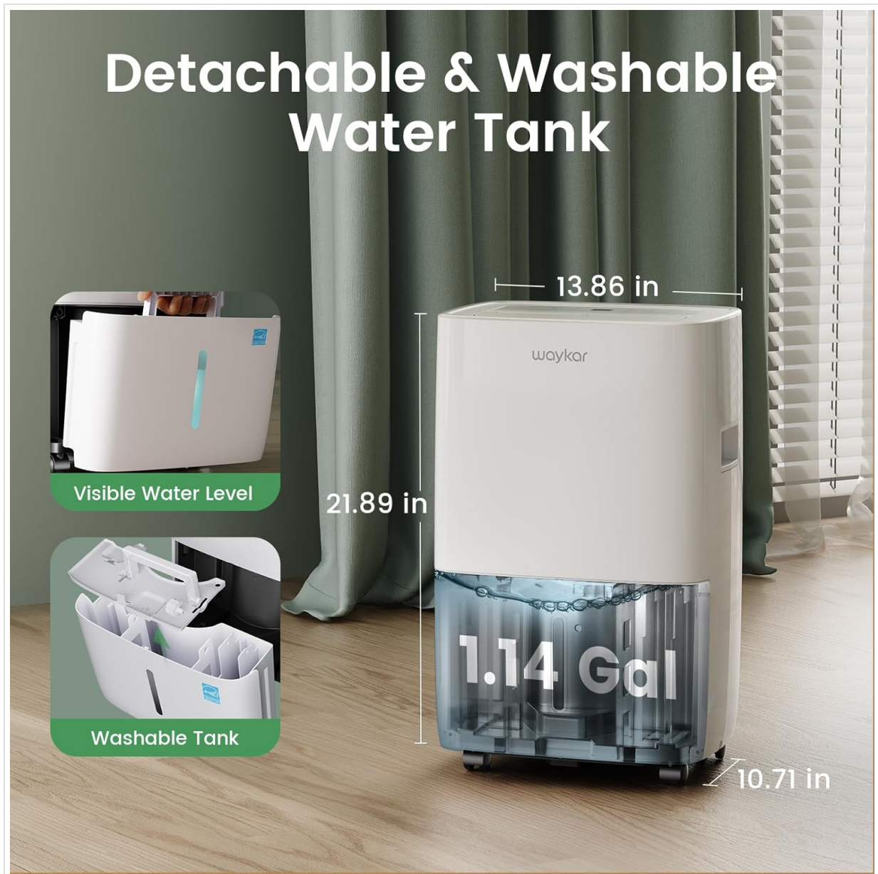
Image: The detachable water tank of the Waykar Dehumidifier, showing its visible water level indicator and washable design.