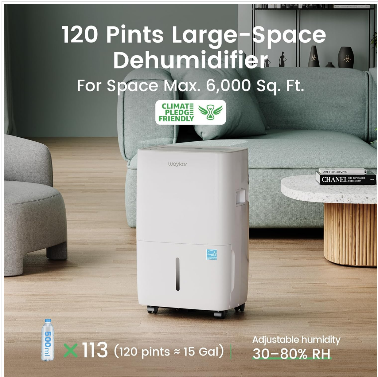
Image: The Waykar 120 Pints Dehumidifier positioned in a living room, showcasing its compact design and portability.