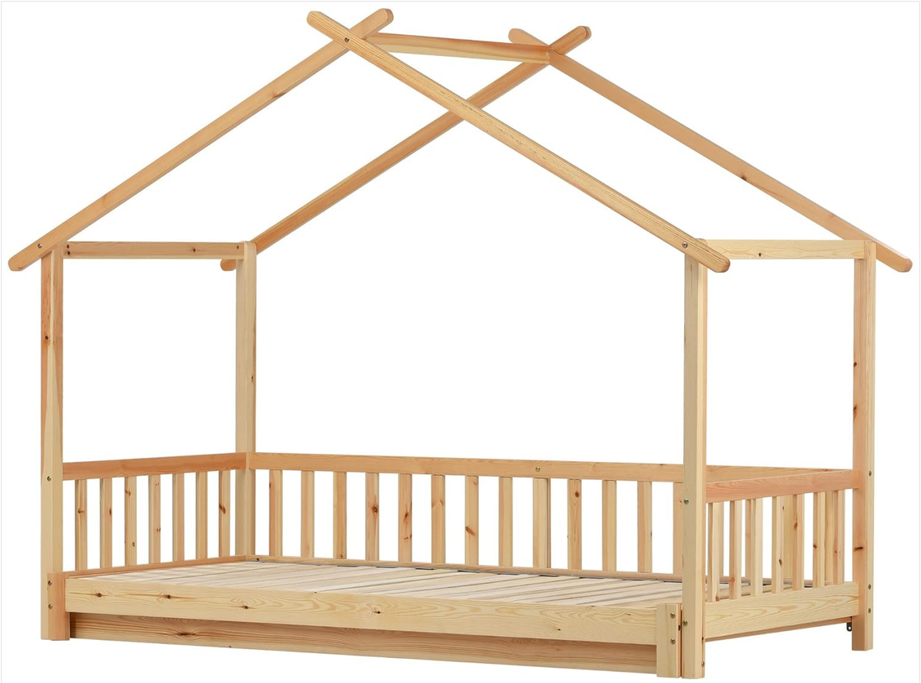
Figure 3.2: Front view of the assembled Merax House Bed, showcasing the house structure and integrated guard rails.