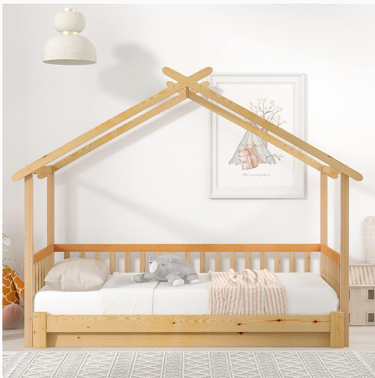
Figure 4.1: The Merax House Bed configured as a single bed, with the extendable section stored underneath.