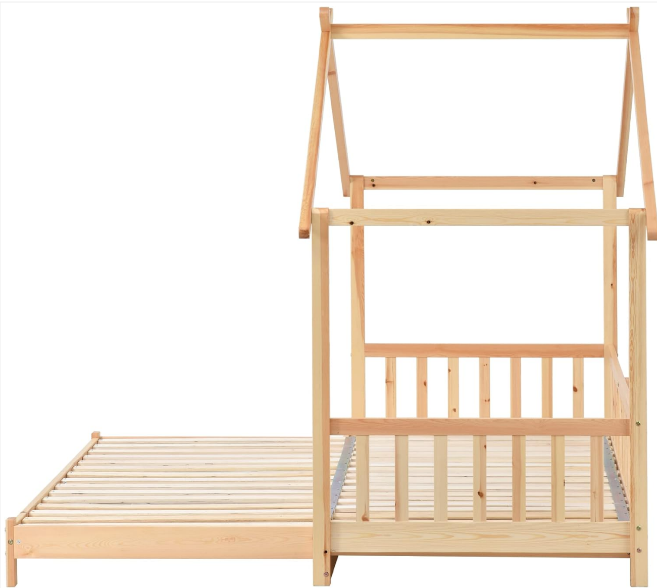
Figure 3.3: Side view illustrating the extendable bed frame designed to slide beneath the main bed.