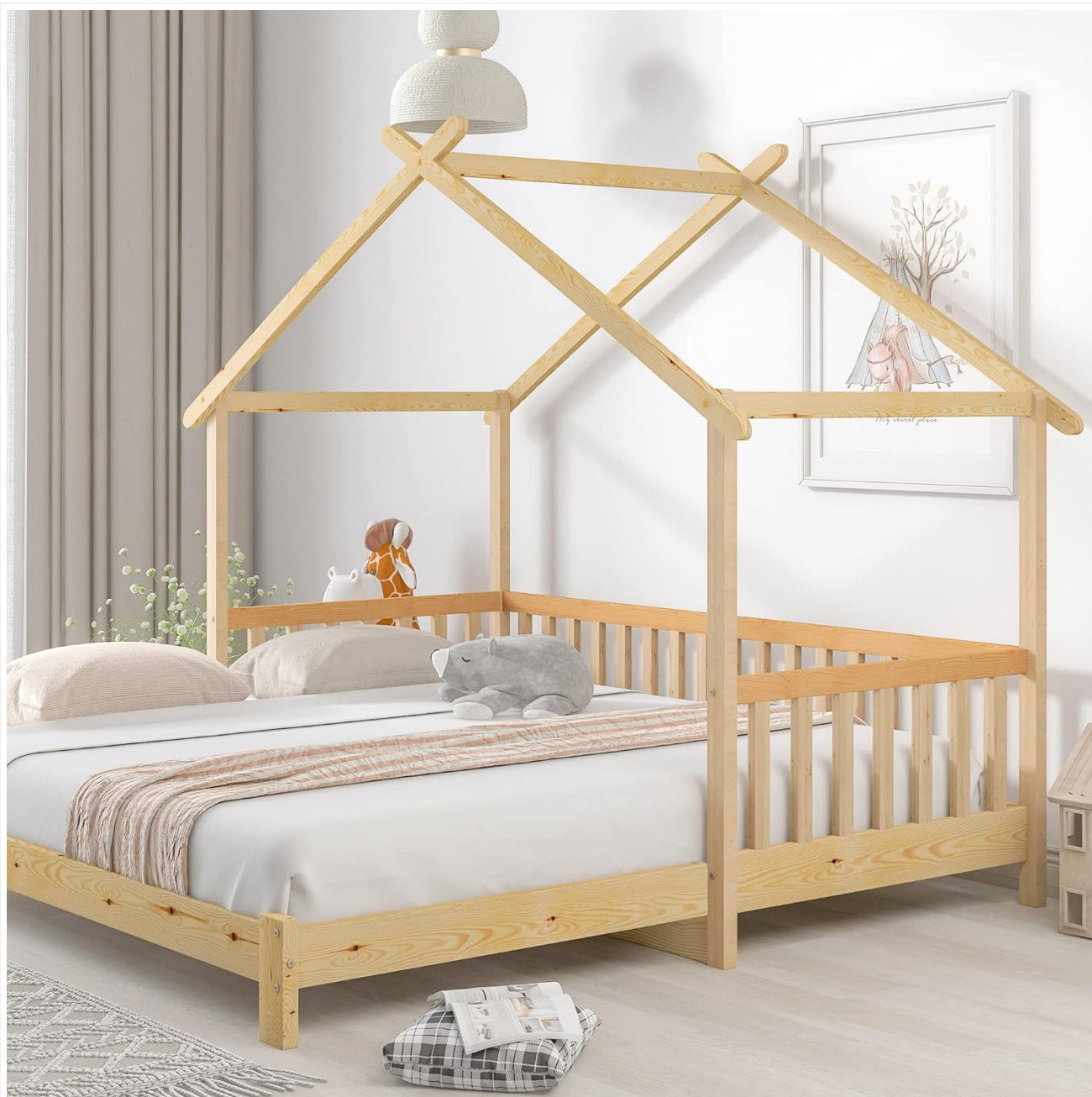
Figure 4.2: The Merax House Bed fully extended into a double bed configuration, providing ample sleeping space.