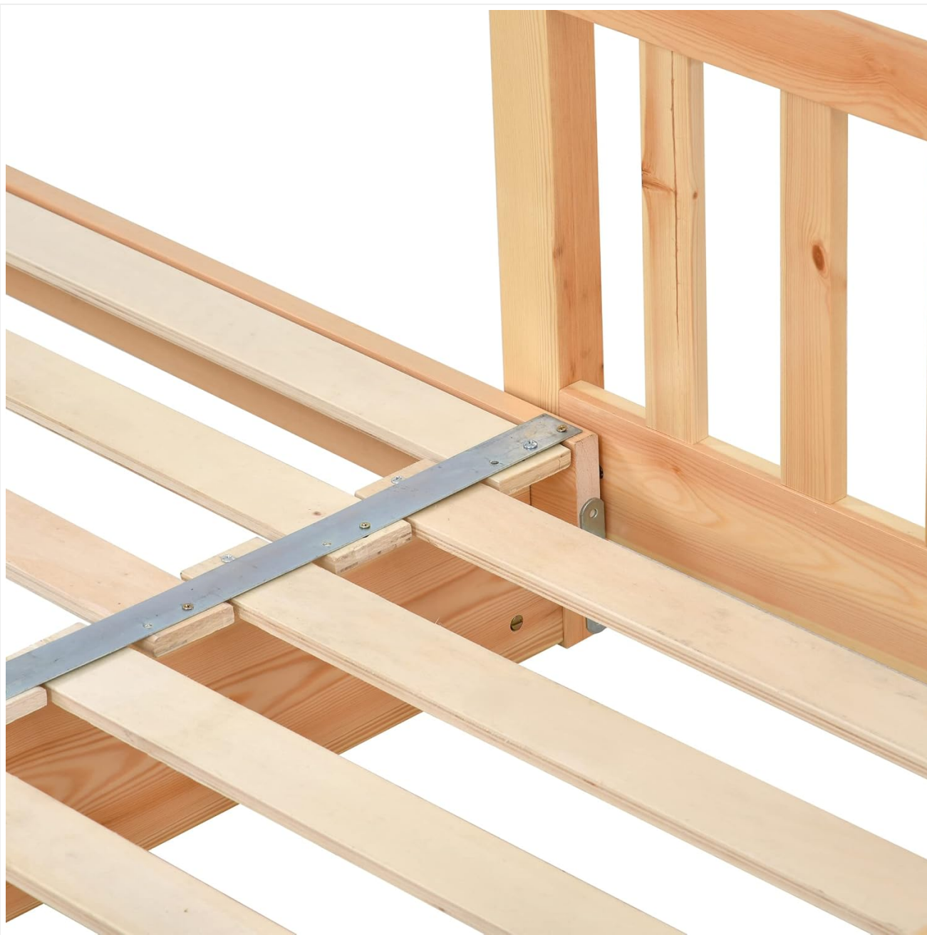
Figure 3.5: Close-up view of the metal support bar that reinforces the slatted base, enhancing stability.