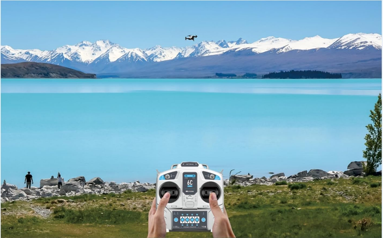
Image: A scenic view of a lake and mountains with a person holding the GoolRC MicroZone 6CH RC Transmitter, controlling a small aircraft in the distance. The image emphasizes the long remote control distance and anti-interference capabilities of the system.

Long remote control distance, anti-interference.