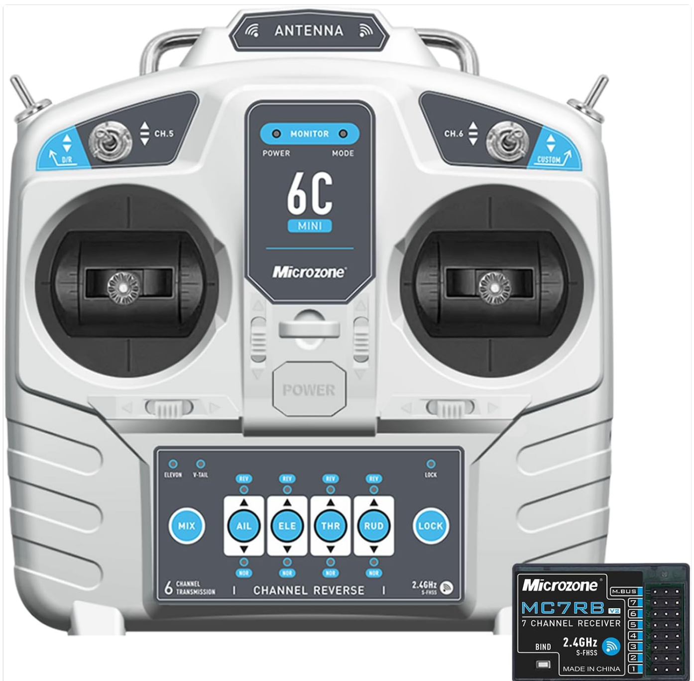
Image: The GoolRC MicroZone 6CH RC Transmitter (top) and the MC7RB Receiver (bottom right). The transmitter is white and grey with a central display showing "6C MINI Microzone" and various control sticks and buttons. The receiver is a small black rectangular unit with multiple ports and an antenna.