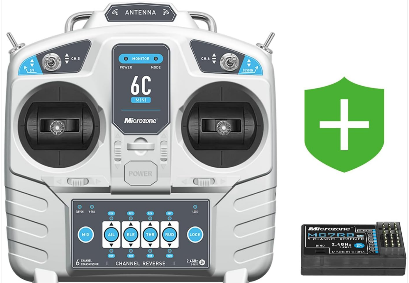
Image: A visual representation of the runaway protection feature. The GoolRC MicroZone 6CH RC Transmitter and MC7RB Receiver are shown alongside a green shield icon with a plus sign, symbolizing protection. Text explains that the system works when the receiver cannot receive the transmitter signal normally or when the transmitter is turned off and the distance exceeds the signal range. In such cases, it returns to a set runaway protection value to prevent damage to the model.

It works when the receiver is unable to receive the transmitter signal normally, and when the transmitter is turned off and the distance exceeds the signal range that the receiver can receive. When the signal cannot be received, it returns to the set runaway protection value to protect the model from damage.