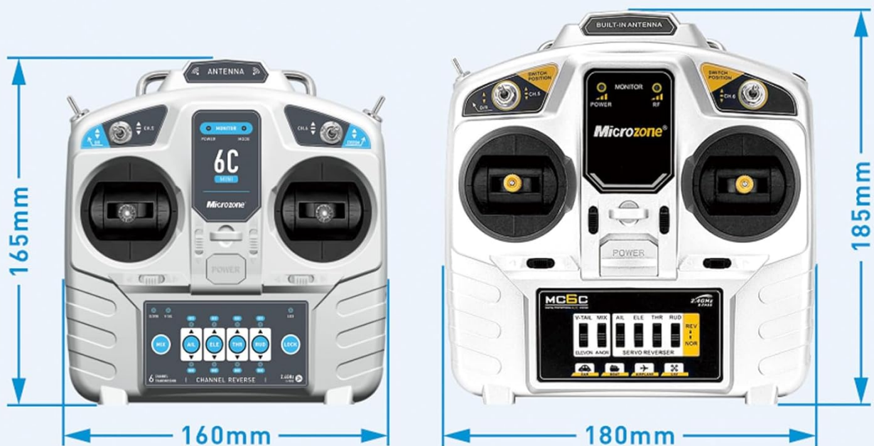
Image: A side-by-side comparison of the GoolRC MC6C transmitter (right) and the 6C-mini transmitter (left), showing their relative sizes. The 6C-mini is depicted as 160mm wide and 165mm high, while the MC6C is 180mm wide and 185mm high, illustrating that the 6C-mini is indeed smaller and lighter.

It is more convenient to carry, with a better feel and experience.