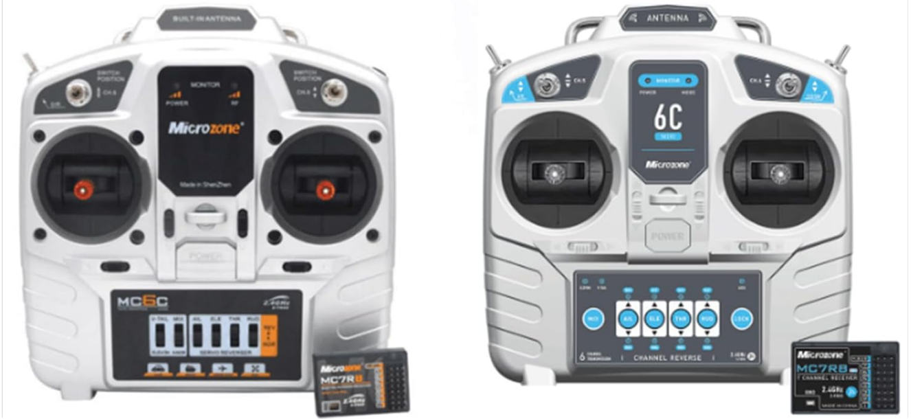
Image: Two different styles of GoolRC RC transmitters are shown side-by-side. The left transmitter is the MC6C model, and the right is the 6C-mini model, illustrating that either style may be received.