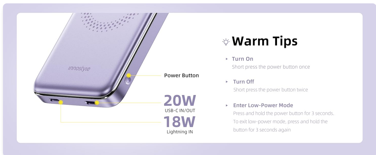
Image 3.1: Key components of the Innostyle Magnetic Wireless Power Bank, including the power button, USB-C IN/OUT port, Lightning IN port, and LED indicators.

Familiarize yourself with the components and features of your power bank.