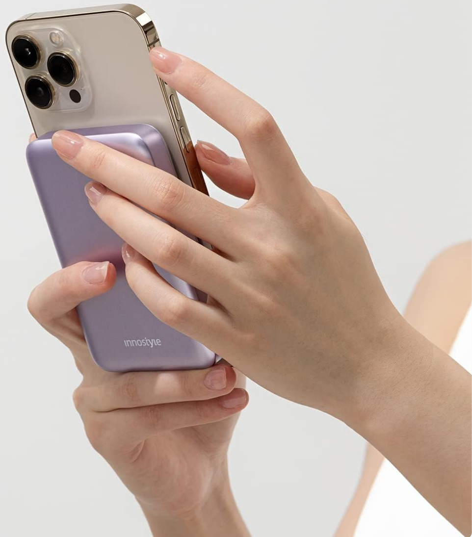
Image 5.5: The power bank attached to an iPhone, showing that the camera remains unobstructed during use.