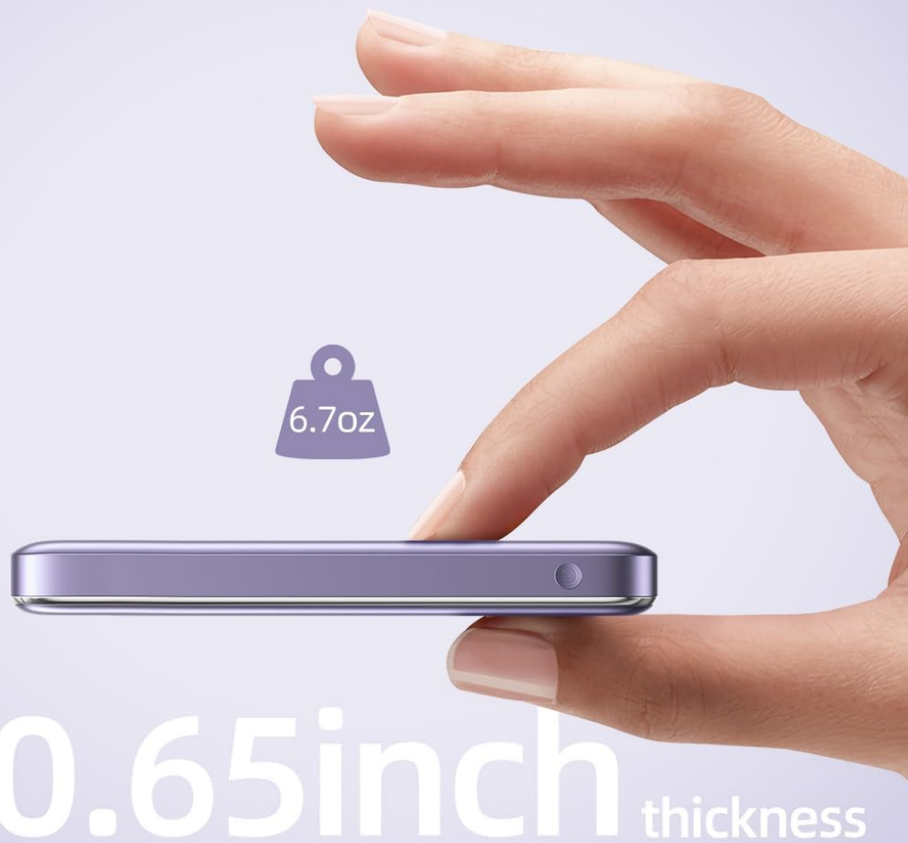
Image 8.1: The compact dimensions and light weight of the Innostyle Magnetic Wireless Power Bank.