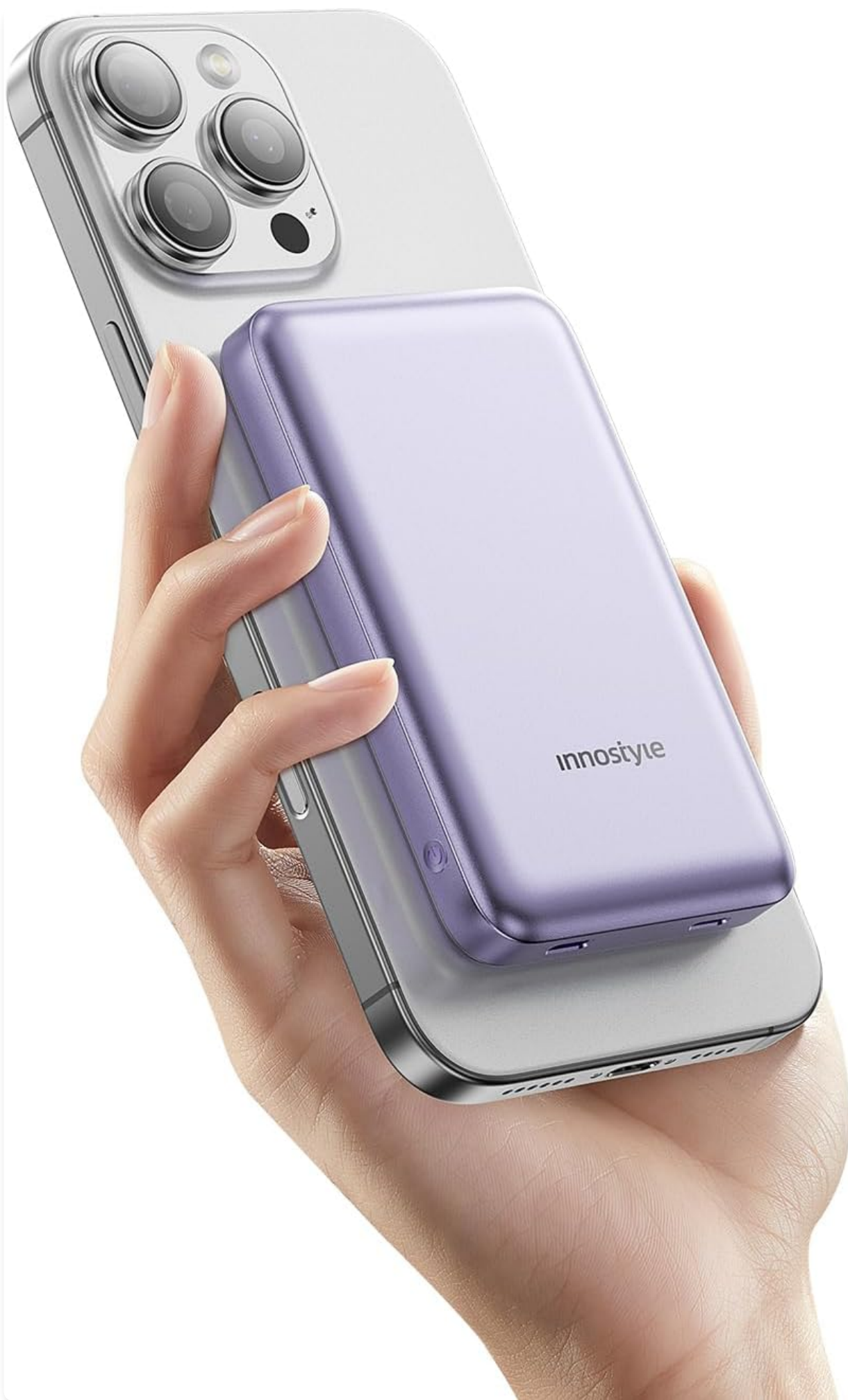
Image 1.1: The Innostyle Magnetic Wireless Power Bank (Purple) magnetically attached to the back of an iPhone.