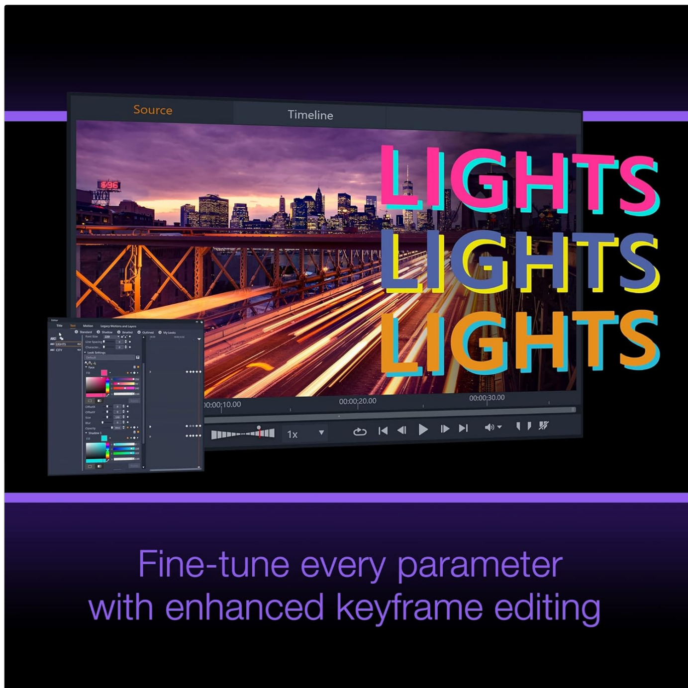
Figure 3: Detailed view of keyframe editing in Pinnacle Studio 26 Ultimate, allowing precise adjustments to video parameters.