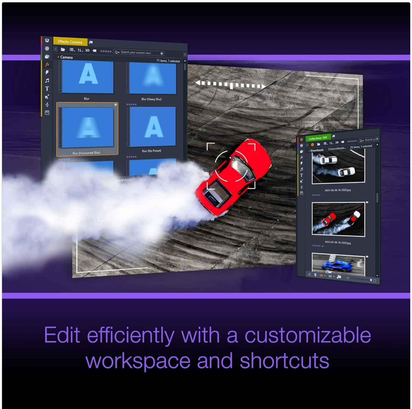
Figure 7: A customizable workspace in Pinnacle Studio 26 Ultimate, displaying effects and media library for efficient editing.