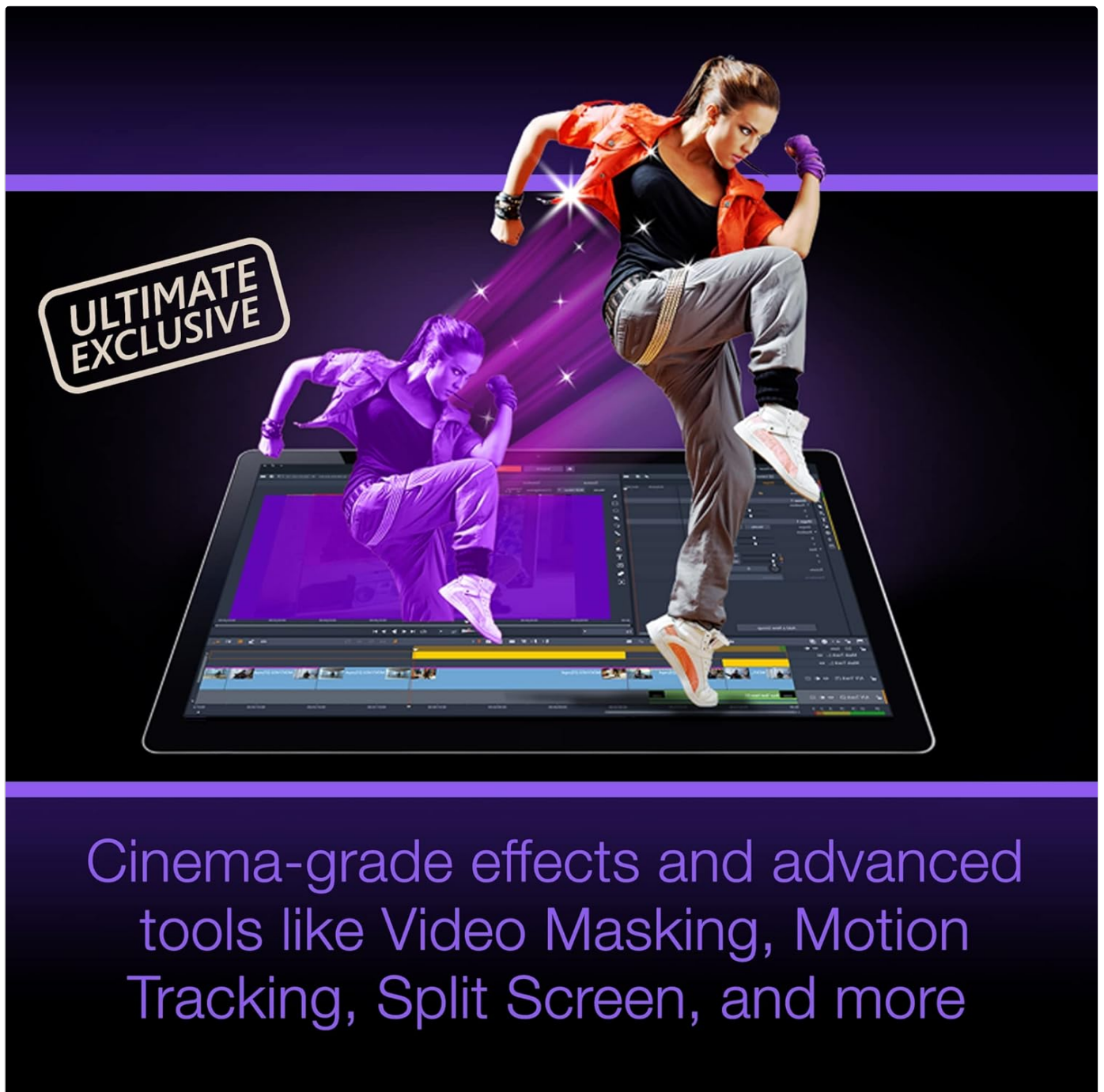
Figure 4: An example of cinema-grade effects in Pinnacle Studio 26 Ultimate, highlighting features like Video Masking and Motion Tracking.