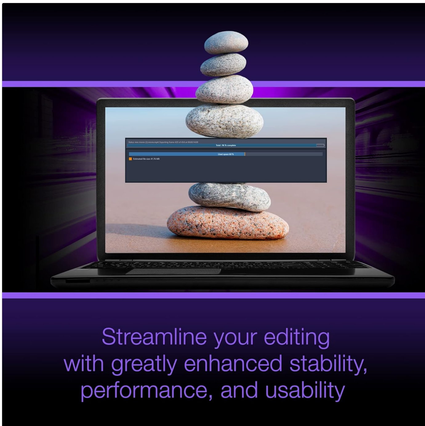
Figure 8: A laptop screen displaying a progress bar, illustrating the software's enhanced stability and performance during operations.