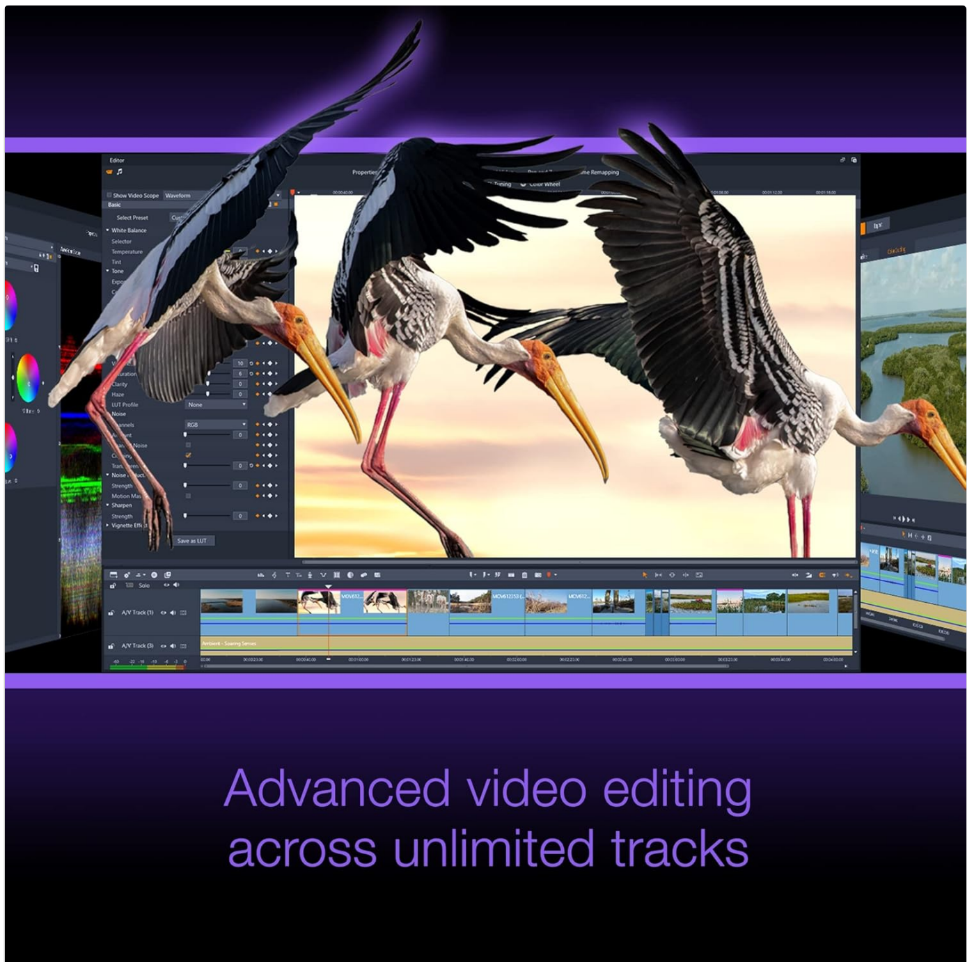
Figure 2: The Pinnacle Studio 26 Ultimate interface demonstrating advanced video editing capabilities across multiple tracks.